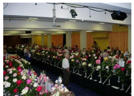
Right – Previous National Rose Show in Palmerston North, 2007