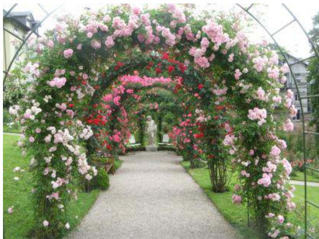
Beutig – Baden Baden

of the roses. The Delbard rose which won Gold in Geneva was equally successful in Baden Baden where the well known 'tunnel' of arches were laden with blooms.