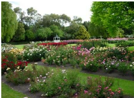
Left – International Rose Trial Grounds and Dugald Mackenzie Rose Garden, Palmerston North

2. The Convention week in the city of Palmerston North: From November 22, to November 27, 2013. Main events include the renowned National Rose Show featuring fabulous roses and floral art from the country's top exhibitors followed by a glittering prize giving and banquet. You will be able to judge and attend the awards for the International Rose Trial Grounds at the famed Dugald Mackenzie rose gardens. There will be visits to Matthews' Rose Nursery in Wanganui and the exciting, newly created, Sam McGredy rose collection in Hastings. A lecture series rounds off a fantastic week in the city.