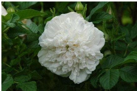
Souvenir de Philemon Cochet