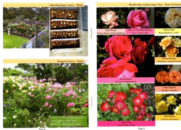
Right - Colour spread from the centre fold of the quarterly journal