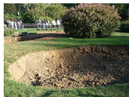
Parc de la Tête d’Or

The park is home to the first botanical garden in France, a newly renovated zoological park, and no less than three different rose gardens: