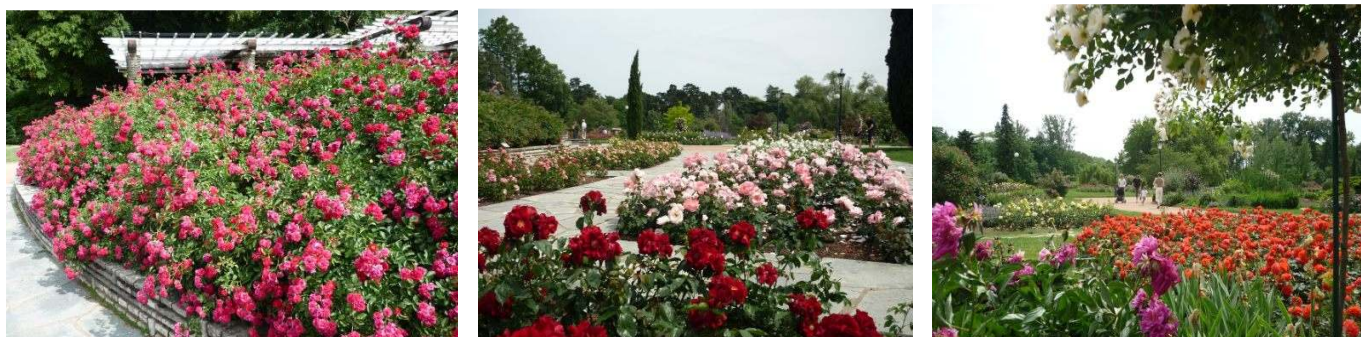
Parc de la Tête d'Or, Lyon

We are committed to giving nature a dominant role in our development with all the advantages this implies for our citizens. In the last few years thousands of roses and other flowering plants have been planted, especially around the Garnier Hall, where great horticultural exhibitions were once held.