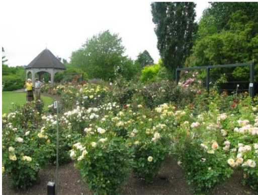
Pacific Rose Bowls Trials, Hamilton