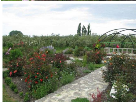
Left – McGredy Garden, Hastings