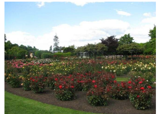
Klamath Falls Rose Garden, Rotorua