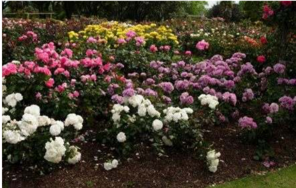
Left – Parnell Rose Garden, Auckland