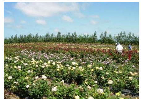
Right – Matthews Nurseries, Wanganui