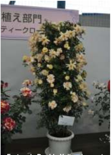
Fortune's Double Yellow in a pot

around those gardens, admiring their beautiful designs and the flowers planted there, taking photos of their families and friends in front of the