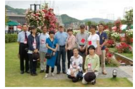
Judging panel of the 1<sup>st</sup> International Rose Trials of Huis Ten Bosch