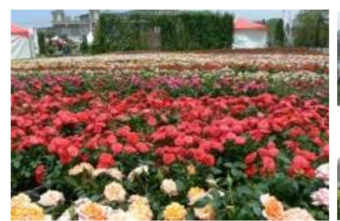
View of Huis Ten Bosch Park