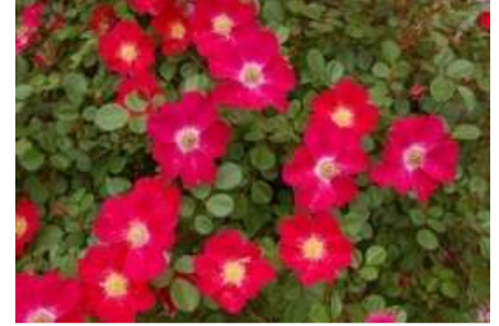
Candia Meidiland – Golden Rose and Special award for landscape roses