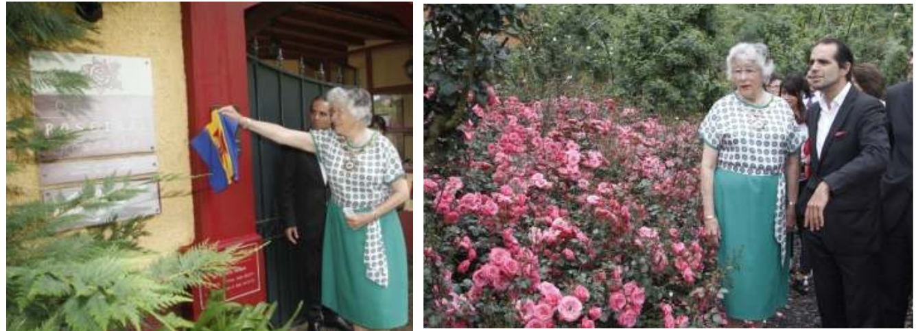
Unveiling the Plaque

roses are at their best, a crowd of dignitaries congregated at the Roseiral da Quinta do Arco for the unveiling of the prestigious WFRS Garden of Excellence Award. In the presence of