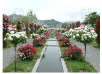
Beautiful rose bed