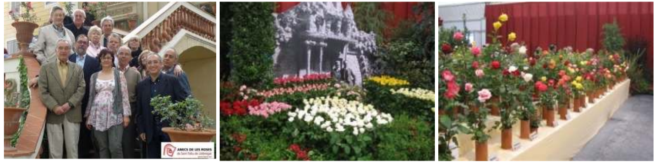
Dynamic team of the San Felieu committee

The Rose Society of Sant Feliu is in the process of working on a very interesting project creating a "rose road" which will pass through Europe ending up in Sant Feliu. We will certainly have the opportunity to hear more about this initiative in the future.