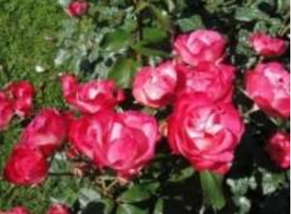
Perfume appreciated by two specialists