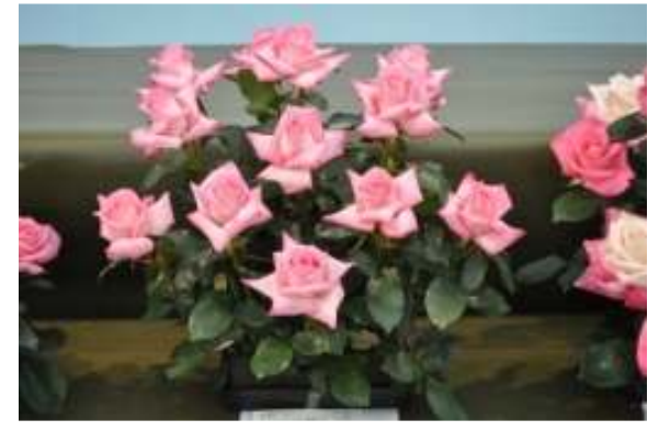
The Grand Prix Roses at the contest on the first day

gardens. Many of them visited the booths of rose nurseries and were looking for the roses they saw in those gardens – again usual scenes we see at the show