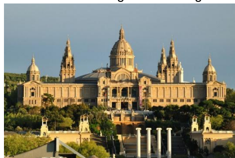
National Art Museum, in Montjuïc Park

Wednesday 14 May – Lectures and Closing ceremony