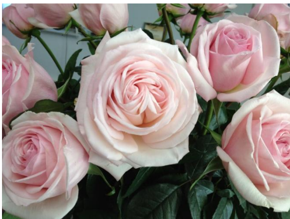
CUT ROSES Meitroni is also used as a fresh cut rose like this bouquet of California