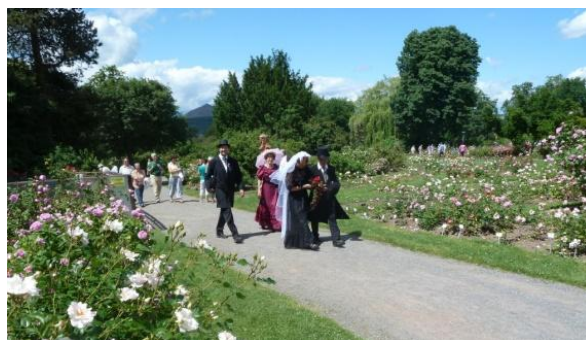
The Rose and Wedding Parade