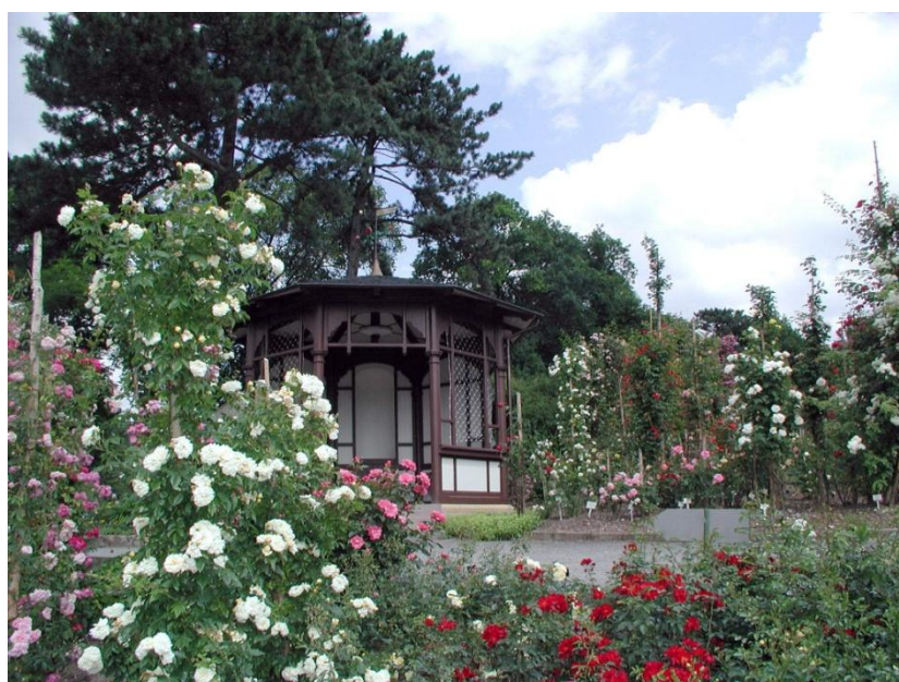
Europa-Rosarium Sangerhausen's Historic Pavilion

To the WFRS 13 th International Heritage Rose Conference June 2013