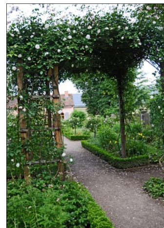
A private garden in Weimar

Our meeting place for departing Weimar was the town's main square, the Marktplatz. This square still retains the old flavour of the city and is the site of a weekday market. Somewhat surprisingly, no one in our party got lost and everyone arrived back to our coach in time for the return journey back to Kelbra. We had time to “freshen-up” before the trip back to Sangerhausen in the evening for the “Friends of the WFRS” dinner. A most enjoyable day was had by all.