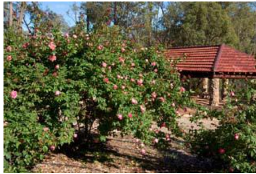
'Lorraine Lee' in the Heritage Rose Garden

The Heritage Rose Garden is on a hillside overlooking the valley and contains a wide variety of roses, both heritage and modern. There are significant plantings of both Tea Roses and the Australian- bred-Alister Clark roses. Gallicas, albas, damasks and other classes are also grown.