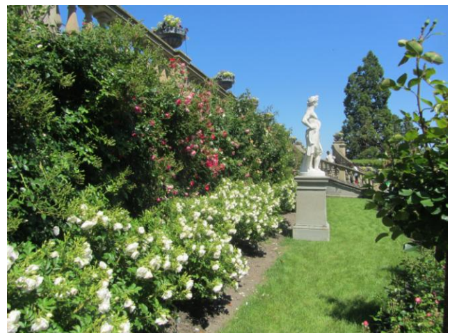
Part of the Rose Garden at Mainau