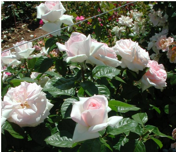
FIRST PICTURE of Meitroni in 2003 in our Field of Le Luc in Provence, France.

Head of Research at Meilland International