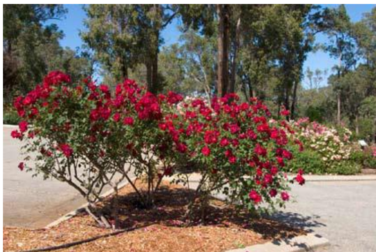
Alister Clark rosebed – 'Restless' which flowers well into the winter.

Today Araluen has a significant rose collection of some 400 varieties and 2,000 plants. The rare "found roses" both from WA and elsewhere in Australia are given pride of place. The roses are grown throughout the Park, both in formal beds and amongst the native vegetation of jarrah, marri and grass trees. This provides a unique Australian setting. There are few supporting structures in the Park so the huge R. gigantea hybrids and other large roses grow as freestanding mounds.