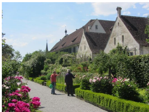
Ittengen Abbey gardens

As participants (including 3 Canadians and 2 South Africans) of The Australian Tour Group arrived in Europe on different flights, we all congregated at the Zurich Airport to begin what was anticipated to be an exciting tour of Germany including the WFRS International Heritage Rose Conference to be held in Sangerhausen. We boarded the coach and headed to Lake Konstanz stopping en route at Ittengen Abbey to view the gardens where 'Sämpling von the Garland' sprawled itself over the walls and up the sides of the buildings. The Rugosas, planted at the front of the border with a backdrop of the Wild Rose 'Rosa Rubiginosa' were just coming into flower. The masses of peony roses were spectacular and, as was discovered, grow exceptionally well throughout Germany.