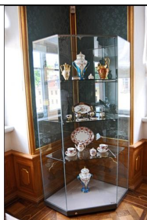
Belvedere Palace Porcelain and Glassworks