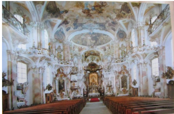
Basilica of Our Lady - Birnau

Leaving Lake Konstanz en route to Baden-Baden., we stopped at Birnau to view the Basilica of Our Lady, a beautiful old baroque church with exquisite artwork covering the walls and ceiling. Certainly a sight to behold! The next stop was at Freudenstadt in the Black Forrest where cuckoo clocks of all shapes and sizes were made.