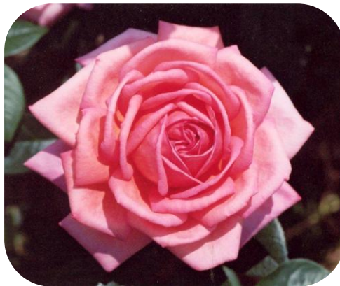
'Lily de Gerlache'