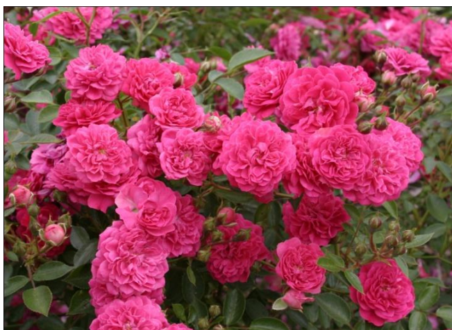
Frederick Law Olmsted Award for Best Groundcover 'Roxy' – Kordes Rosen, Germany