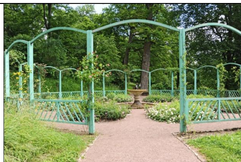
Belvedere Park Rose Garden