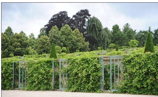
Brickwork was pierced to allow figs to grow in the niches

Sanssouci and its extensive gardens became a World Heritage Site in 1990 under the protection of UNESCO. In 1995, the Foundation for Prussian Palaces and Gardens in Berlin-Brandenburg was established to care for Sanssouci and the other former imperial palaces in and around Berlin. These palaces are now visited by more than two million people a year from all over the world.