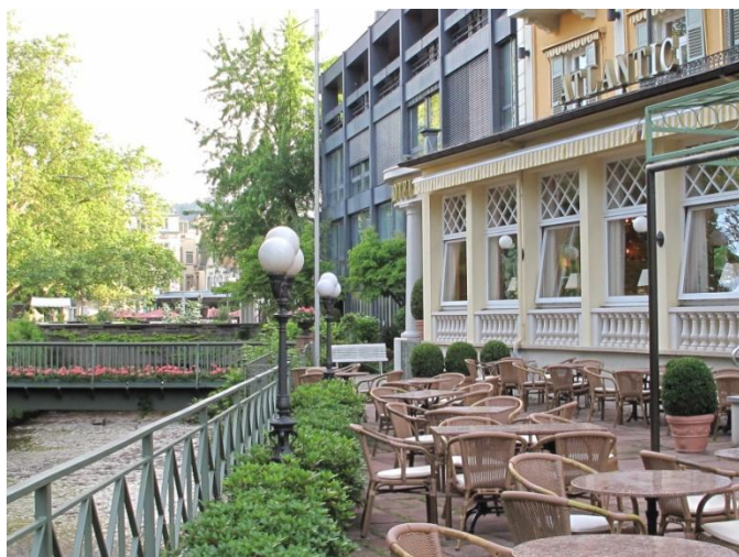
Parc Atlantic Hotel