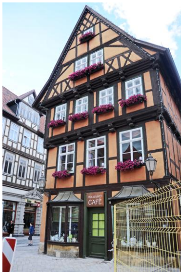
Half timbered building

On leaving Gernrode, we travelled the 12 kms to visit the historic old town of Quedlinburg where a local guide took us on a walking tour of the town. The town has a history extending back to the 9th century and is regarded one of the best-preserved medieval and renaissance towns in Europe, having escaped major damage during World War II. It is regarded as the birthplace of the German Nation as King Henry I was crowned King of Germany there in 919 - the first time anyone had ruled Germany as a single entity.