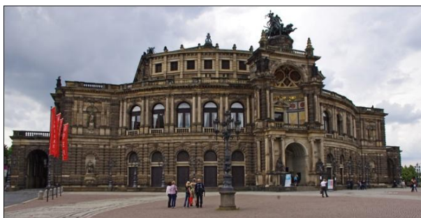
Semper Opera House