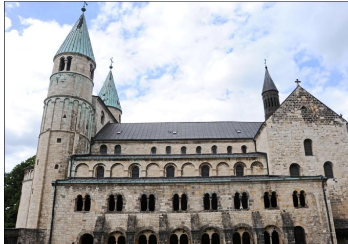
Protestant Collegiate Church of St. Cyriacus

Today, the church is owned by the Protestant community and is used ecumenically. Since 1997, the preserved foundation buildings have served as a youth meeting centre and convention centre of the Protestant Church of Anhalt.