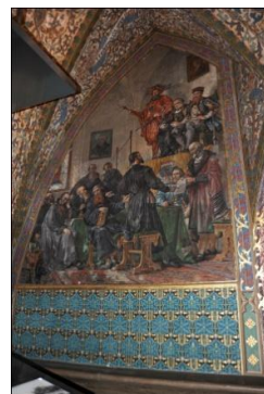
Albrechtsburg Castle Interior