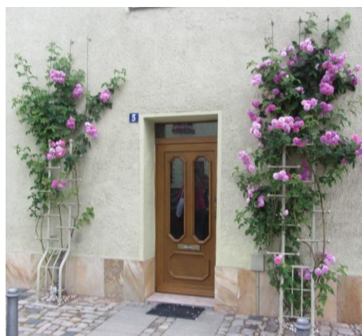
Typical house entrance - Sangerhausen Sheenagh Harris