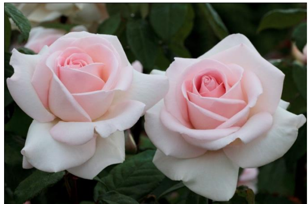
GARDEN ROSE a unique blend of pink and white and splendid green glossy foliage.