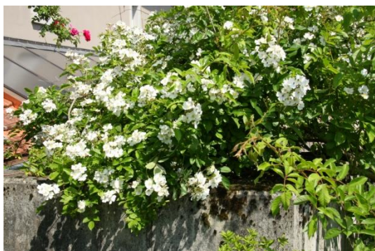
'Sämpling von The Garland'