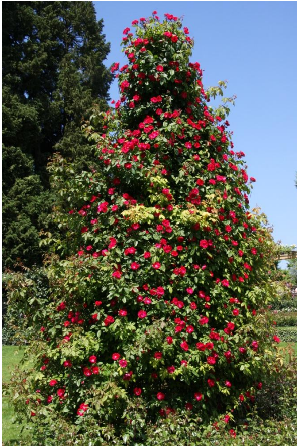
'Till Uhlen Spiegel'