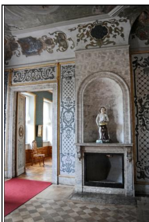
Belvedere Palace Interior