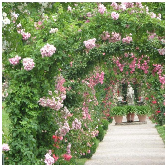
Arches of roses leading to the statue of Hebe at Beutig – Baden Baden