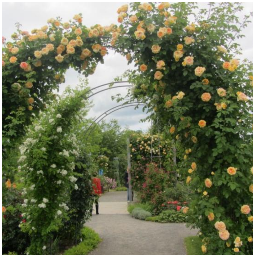
'Alchymist' - Sangerhausen Rosarium