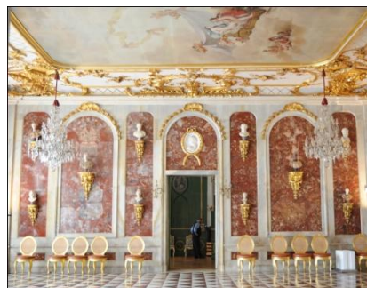
Interior of Sanssouci Palace