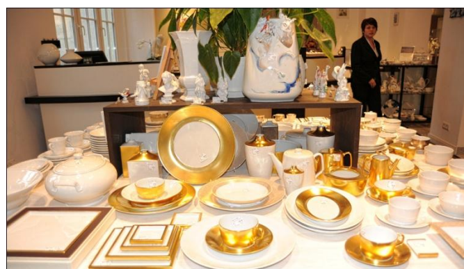
Meissen Porcelain sale