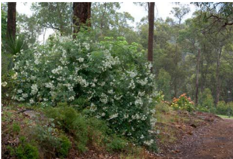
Spring flowering roses in a bushland setting