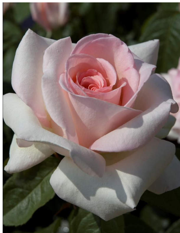
Meitroni is :

For the house of Meilland, having test fields under many different climatic zones, this