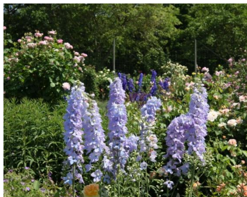
Delphiniums interplanted with roses