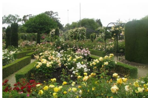
Trevor Griffiths Rose Garden Hayden Foulds