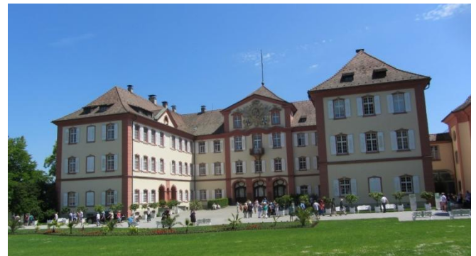
Baroque Castle of Mainau

The Rose Garden Room was bordered on all sides, the walls being covered with climbing roses and large statues intermingled throughout. The many varieties of the peonies, numerous beds of annuals and perennials, new and massive old trees and shrubs as well as water and garden features added to the overall effect.