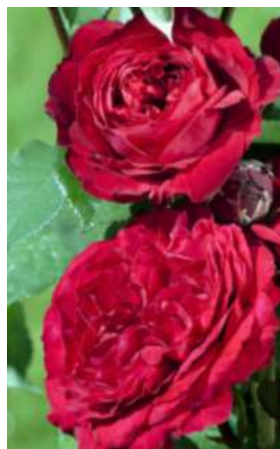
‘Jubilé Laperrière’ var. Lapjub

In the year of its 150 th anniversary, the Laperrière dynasty has demonstrated its capacity to undertake successfully the challenges of the 21st century. Their professional commitment, willingness to produce roses of a high standard and concern for the environment by applying strict production measures, are all qualities which indicate that the future will be extremely promising.