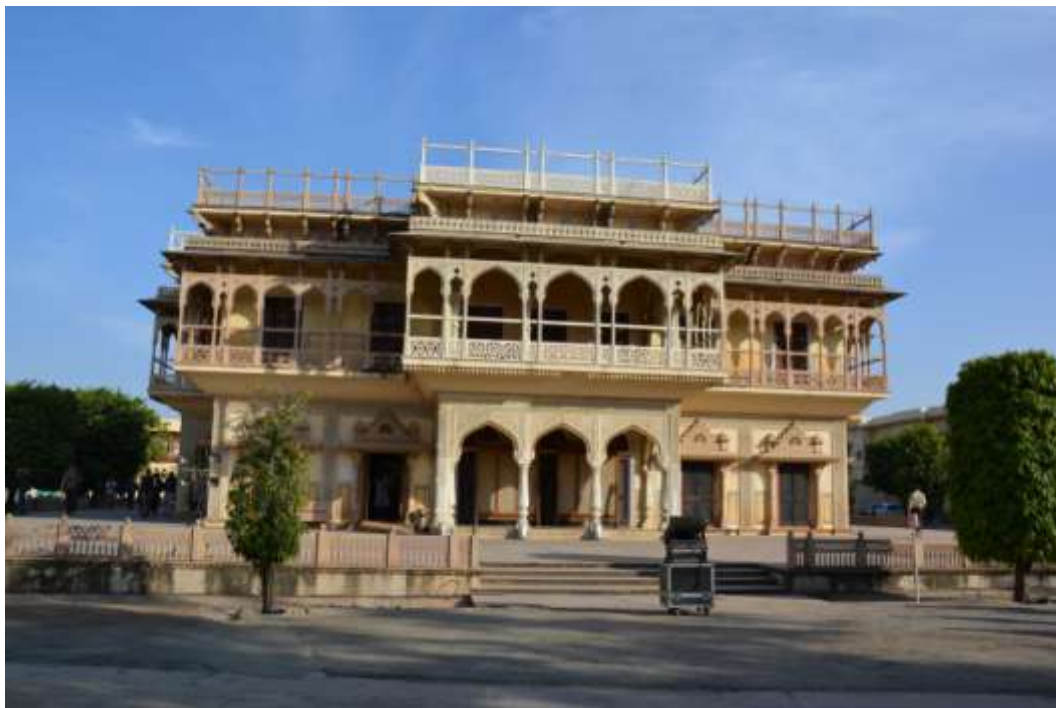
Maharaja Sawai Man Singh II City Palace

Next stop was the Maharaja Sawai Man Singh II City Palace. This is a large complex, with gorgeous buildings and a marvellous collection of art and artefacts. A major part of the City Palace consists of the Maharaja Sawai Man Singh II Museum. It is also the residence of the Jaipur Royal Family.