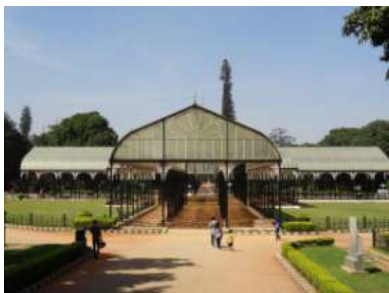
The glass house of Lal Bagh Botanical Gardens

Lal Bagh means “the red garden” because of the colour of the big rocks and hill in red granite in the heart of this park. The Lal Bagh Rock is said to be one of the oldest rock formations on earth, dating back 3000 million years. We climbed it!