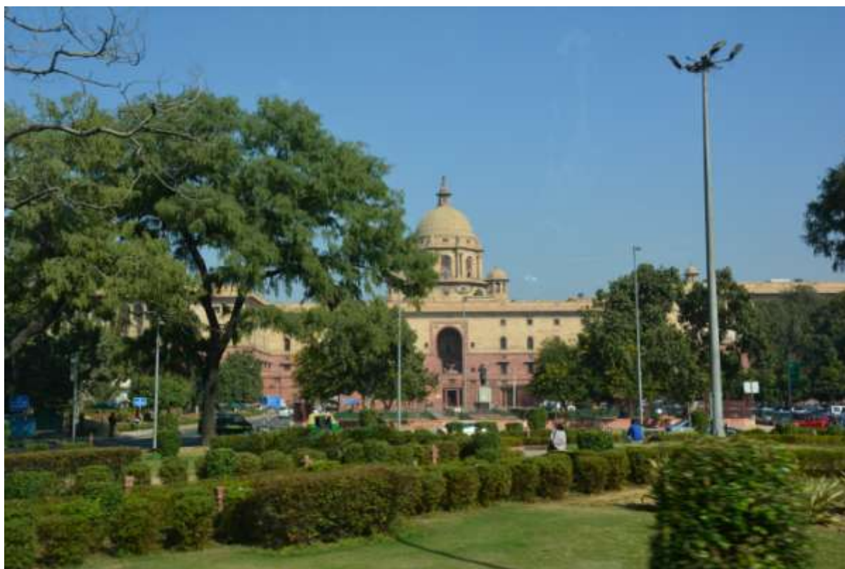
Residence of the President of India

Our last day started with a site-seeing tour through the embassy quarter - the residence of the President of India. It is a very clean district where you don't find slums or dirt on the street and where we were not allowed to stop to take pictures.