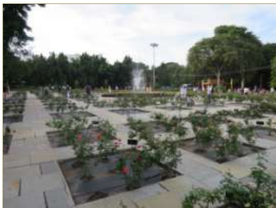
GHMC Indira Park

The second day included four lectures in the morning and was followed by the Rose Show Awards. After the awards and lunch we all caught air conditioned coaches to visit the public gardens. The first garden was the Public Gardens, Hyderabad created by the Government of Andhra Pradesh Department of Horticulture. This was a large renovated central lawn with a fountain that was surrounded by hundreds of rose bushes. The rose garden was attached to a large public garden area where locals could be seen having picnics and gatherings with family and friends.