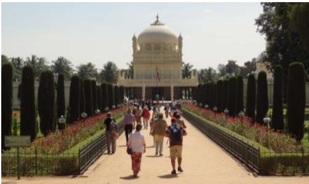
Walking to the Tipu Sultan's Mausoleum

Let me provide you with some information about Tipu Sultan, because this important man created the history of this place and India.