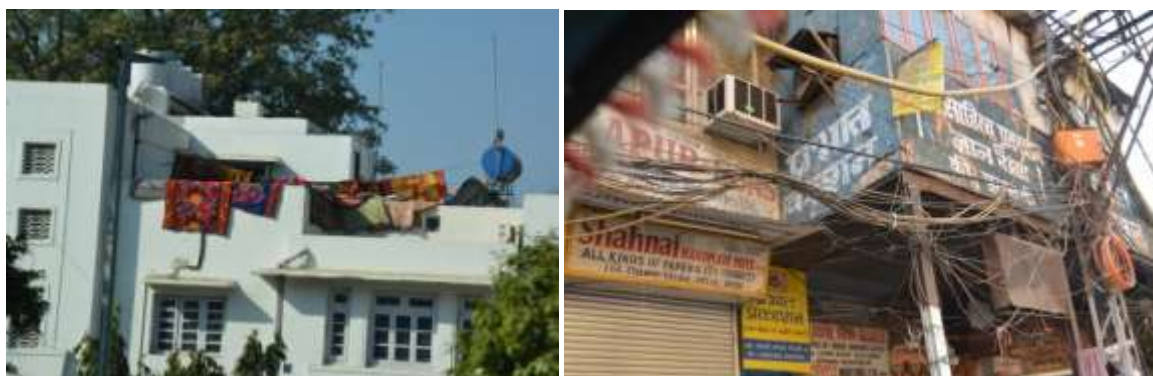
As seen in the streets of Delhi