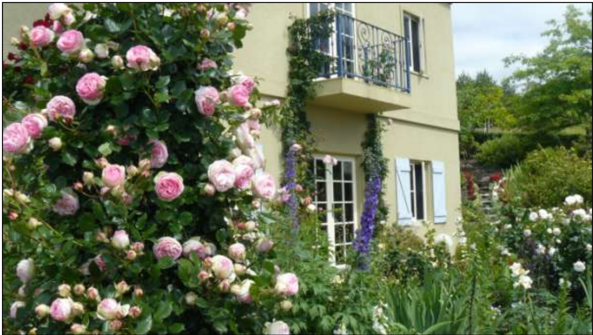
'Pierre de Ronsard' at Bracken Ridge, south of Hobart

During the first day of the pre-conference tour we visited four gardens south of Hobart, most with magnificent views over the sea and hilly terrain. Perennials, especially delphiniums, thrived in these gardens with their cool, moist climate. We were all amazed at the size and colouring of the roses, all larger, deeper in colour and more luxuriant than those grown on the mainland. 'Albertine' seemed to be a favourite, covering trellises and archways in most gardens. The Kordes rose, 'Cinderella', made an excellent pillar and was a mass of soft pink, apple-fragrant blooms. We saw 'Pierre de Ronsard' in nearly every garden we visited, a mass of creamy pink blooms hanging from archways, pillars and trellises. And David Austin roses featured prominently in most of the gardens, all very large plants and massed with colour.