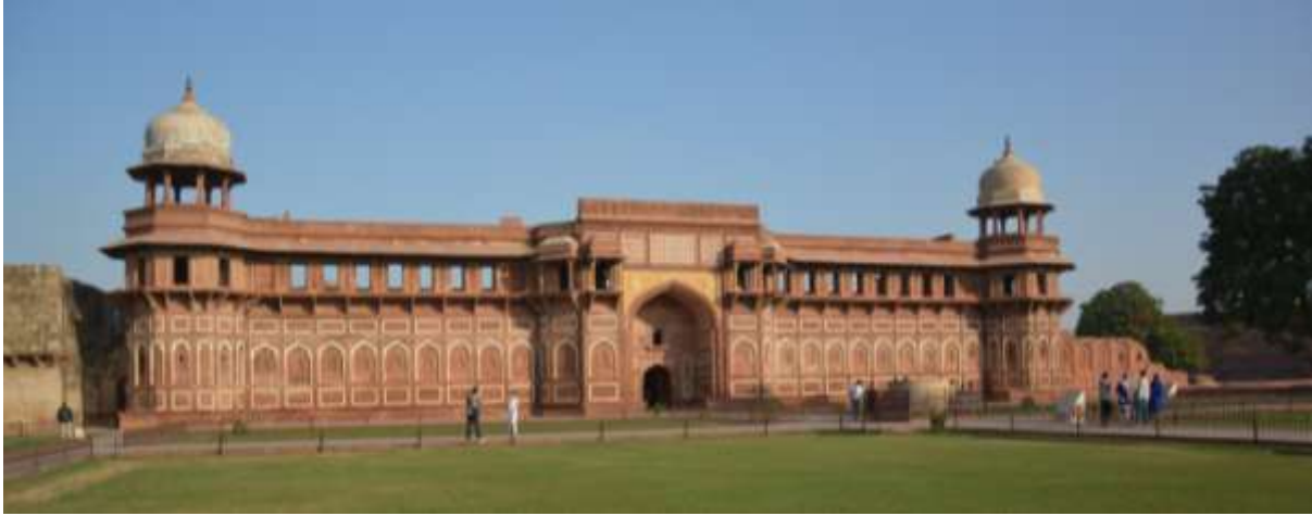
The Red Fort

The next day we continued to Jaipur, the pink city, capital of Rajasthan. On our 6 hour journey by bus you could hear coughing all the time, most of us had caught a cold or had some problems with the smog and the dust.