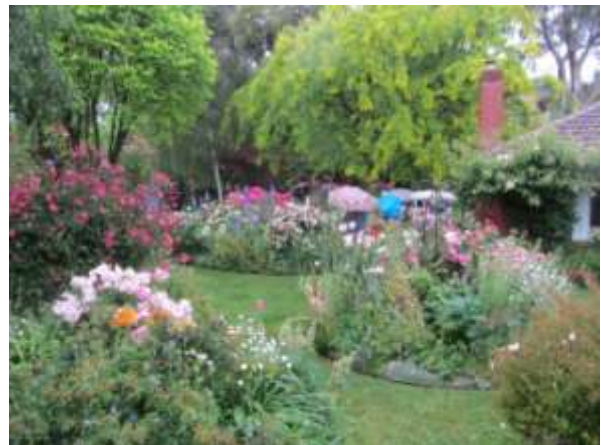
Bagdad cottage garden in the rain