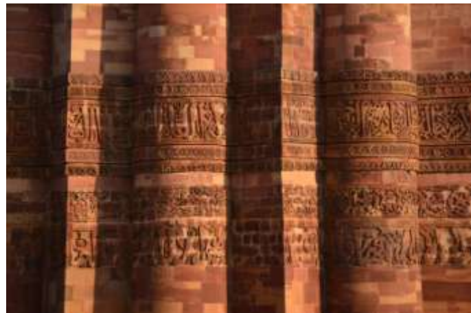
Qutb Minar in detail

After lunch we were shown Qutb Minar, a soaring, 73 m-high tower of victory, built in 1193 by Qutab-ud-din Aibak immediately after the defeat of Delhi's last Hindu kingdom. Our guide always told us a lot of interesting facts about Indian history, but to me it was impossible to remember all these complicated names of the former rulers. The tower has five distinct storeys, each marked by a projecting balcony and tapers from a 15 m diameter at the base to just 2.5 m at the top.