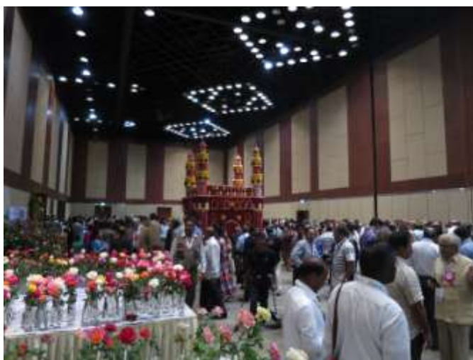
The Rose Show