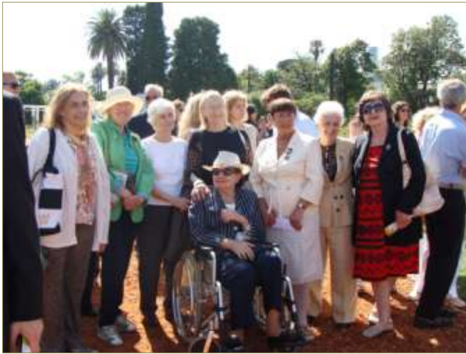
Members of the Asociacion Argentina de Rosicultura