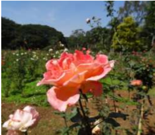
The rose garden in Lal Bargh

We all looked forward to what the rose garden was going to hold for us. But personally, I was a little bit disappointed on discovering it. The rose garden is not open to the public; it is more like a conservatory. They started this rose garden in 2002/2003, and at this time, there were more than 800 different varieties and they improved the rose garden every year by planting 200 new varieties. However, without labels, it was difficult to recognize the varieties. Another strange thing for me was the way of cultivation. As we are in a tropical zone, the rose bushes have no real rest period and they prune the bushes twice a year in June and November, but only by reducing one third of the size of the bush, totally differently to what we are used to in our temperate climate.