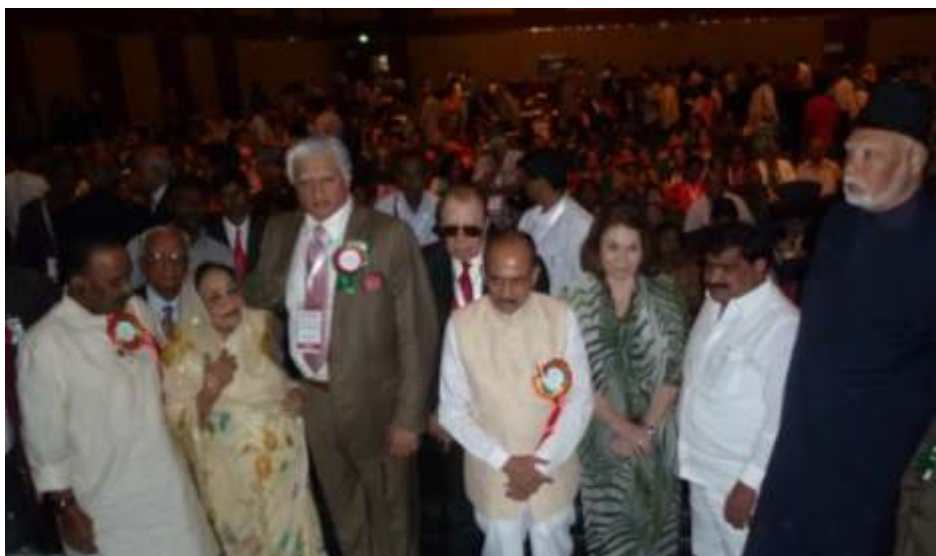
Taken at the Opening Ceremony