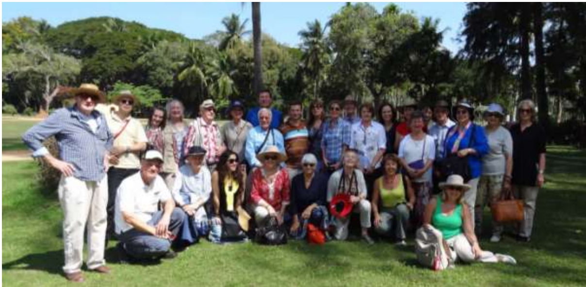
The group in the Tipu Sultan's summer residence

After 3 hours driving, our first stop was to visit Tipu Sultan's Palace and Mausoleum in Srirangapatnam, a quite charming place to visit! Tipu Sultan built this tomb as a tribute to his illustrious father Hyder Ali and his mother. It is a very elegant structure, a mausoleum in white and black marble. This place is near the summer palace, with the walls richly decorated and illustrated with the history of the battles of Mysore.