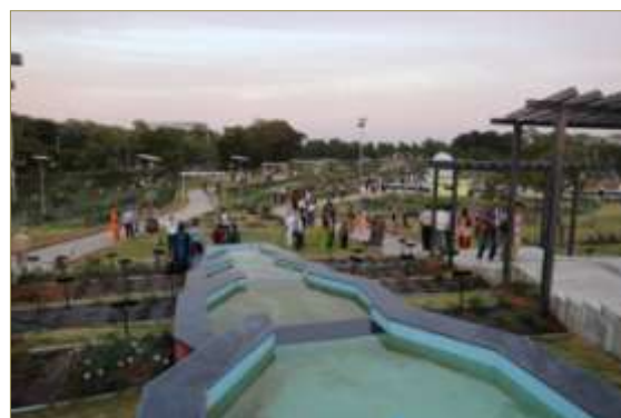
Sanjeevaiah Park - Rose Garden of the Hyderabad Metropolitan Development Authority