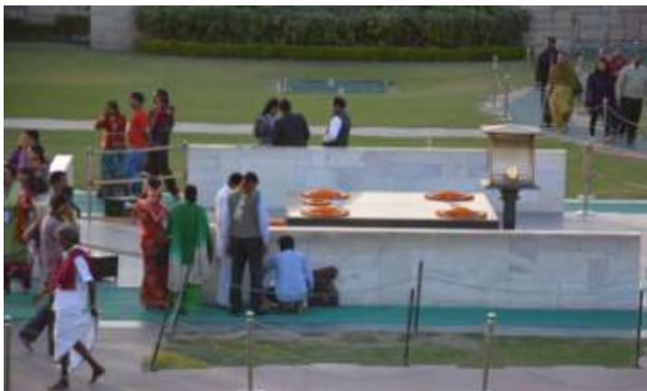
Raj Ghat – memorial to Mahatma Gandhi

Our next stop was Raj Ghat, a memorial to Mahatma Gandhi. It is a black marble platform that marks the spot of Mahatma Gandhi's cremation on 31 January 1948, the day after his assassination. It is left open to the sky while an eternal flame burns perpetually at one end. It is located on the banks of the river Yamuna in Delhi, India on Ring Road officially known as Mahatma Gandhi Road. A stone footpath flanked by lawns leads to the walled enclosure that houses the memorial. Ghat walls is a very quiet place in the centre of this pulsating city.