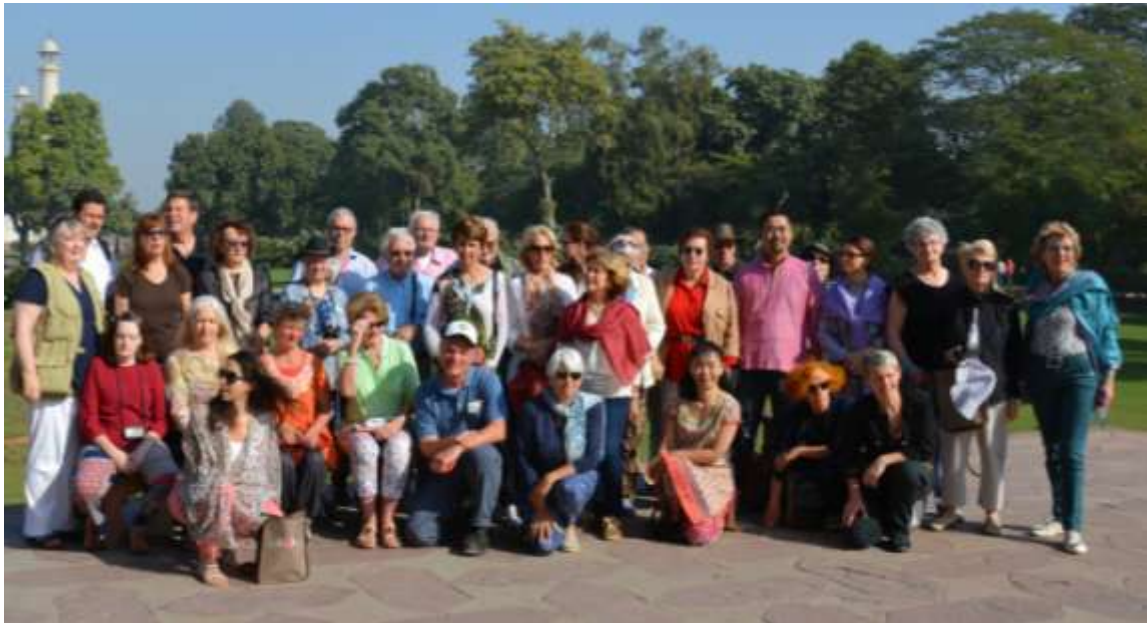
The post Convention group outside the Taj Mahal

The Taj Mahal was built by Mughal emperor Shah Jahan in memory of his wife Mumtaz Maha, who died during the birth of their 14th child. It is regarded by many as the finest example of Mughal architecture, a style that combines elements from Islamic, Persian, Ottoman Turkish and Indian architectural styles. The construction began around 1632 and was completed around 1653, employing thousands of artisans and craftsmen. When standing in this white marble mausoleum, we forgot the thousands of tourists surrounding us; we were deeply overwhelmed and fascinated by its beauty.