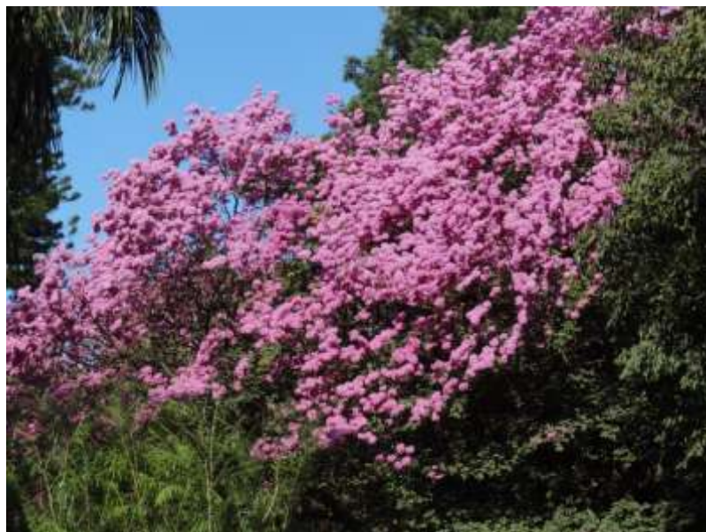
The magnificent Tabubeia rosea

We made another short stop for a walk around the State Central Library garden. This is a rose garden that unfortunately we were not able to enter, but in a nice environment with Royal Palms ( Roystonea regia ) and many other big trees including a nice tree in full bloom with pink flowers ( Tabubeia rosea ). Tabubeia is from South America (Mexico, Venezuela, Ecuador, and Salvador, where it is the national tree).