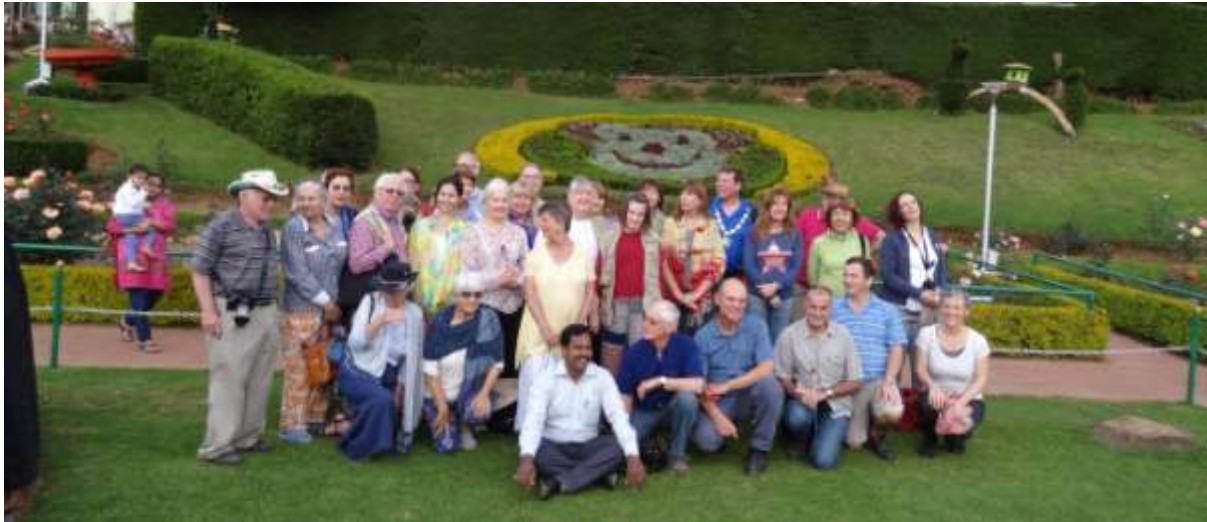
The group in outstanding Ooty Rose Garden

Then we had an official reception, hosted by the Nilgiri Rose Society at the Gem Park Hotel. We expressed our sincerest gratitude to our hosts who provided us with such a sumptuous dinner.