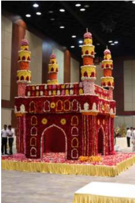
Char Minar Gate – Hyderabad