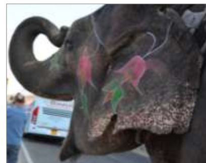
Elephant ride to Amber Fort