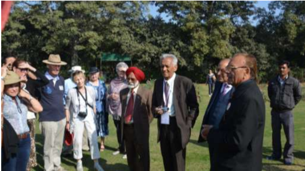
Members of the Delhi Rose Society