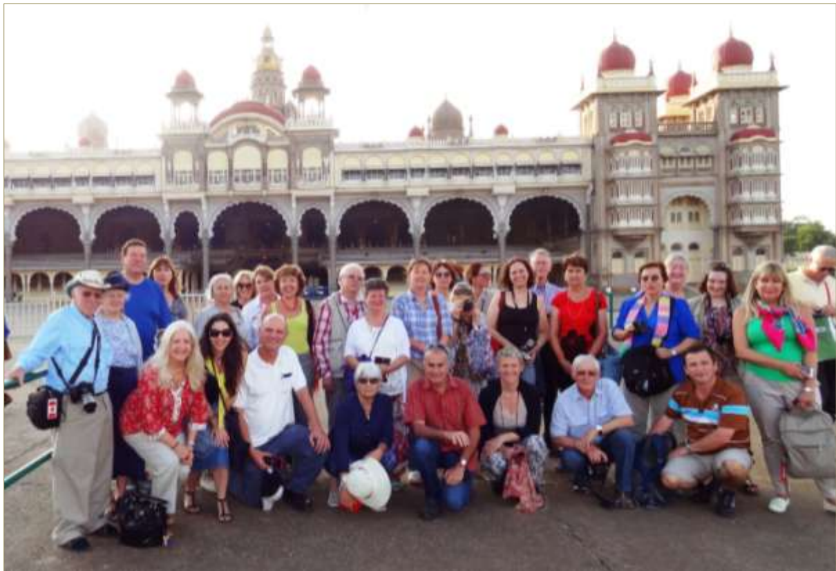
The group at the Palace of Mysore

Mysore is noted for its palaces, including the Mysore Palace, and for the festivities that take place during the Dasara festival when the city welcomes a large number of tourists.