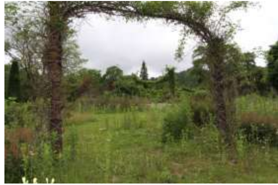
The deserted garden after the family were forced to evacuate due to the 2011 disaster