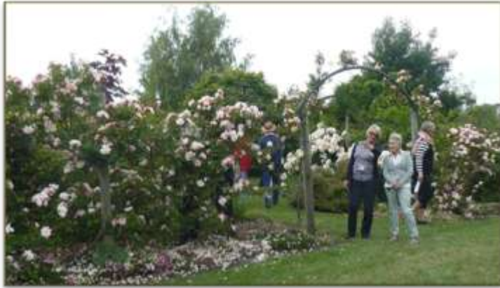
Admiring 'Albertine' at Cilbrook, Cambridge, near Hobart