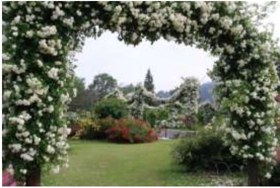
Futaba Rose Garden prior to the calamities of 2011