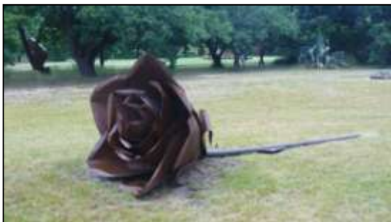
Folko Kooper's garden and bronze rose sculpture

Day four and it was off to Launceston via Ross, a small historical village with its beautiful old convict built bridge. On the way we visited two memorable gardens, viewing both of them in the rain. Folko Kooper's garden was filled with his exquisite sculptures in bronze, glass, stone and steel and Gay and Laurie Clark's Bagdad magical garden crammed full of all sorts of goodies – a real cottage garden, my favourite here being 'Comtesse du Cayla'.