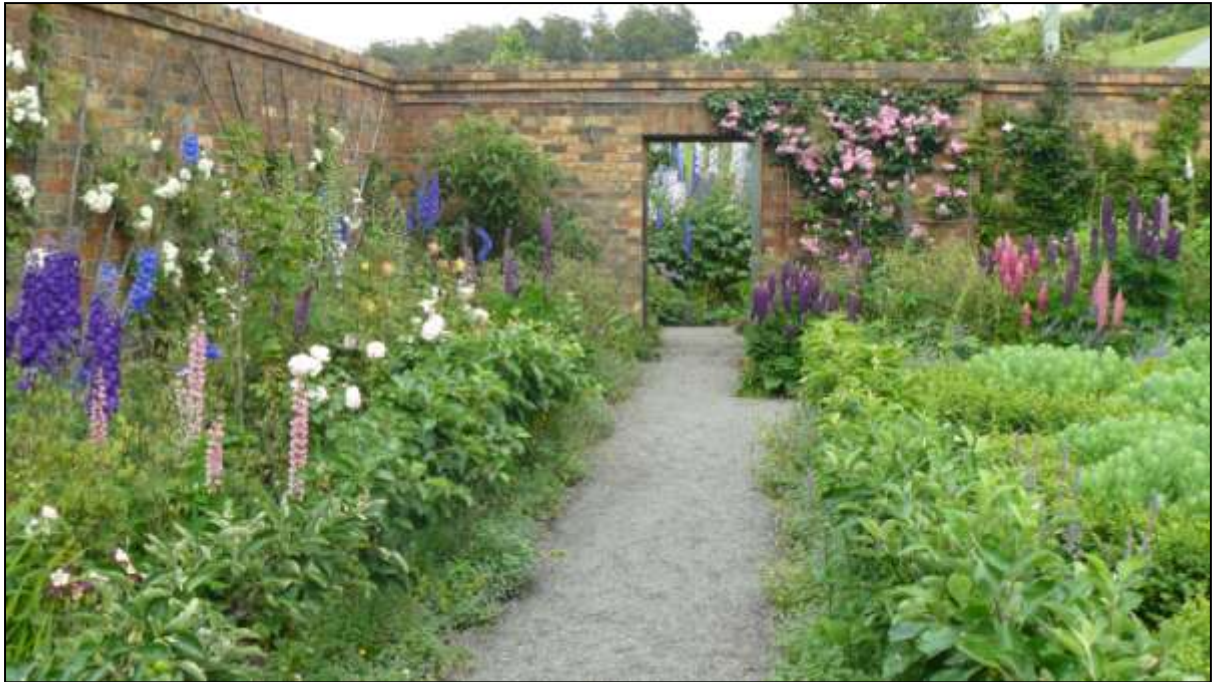
Delphiniums and lupins at Old Wesleydale

hybrid musks, made a great statement, we visited two gardens in Deloraine both of which housed many cottage garden delights along with dogwoods, camellias and deutzias.