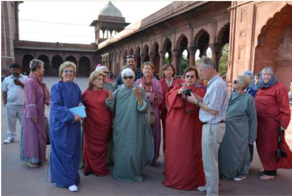
Jama Masjid Mosque

This is the principal mosque of Old Delhi in India. Construction began in 1650 and was completed in 1656. It lies at the beginning of the Chawri Bazar Road, a very busy central street of Old Delhi. With three great gates, four towers and two 40 m-high minarets, it is constructed of strips of red sandstone and white marble. About 25,000 people can pray here at a time. The mosque has a vast paved rectangular courtyard, which is nearly 75 m by 66 m.