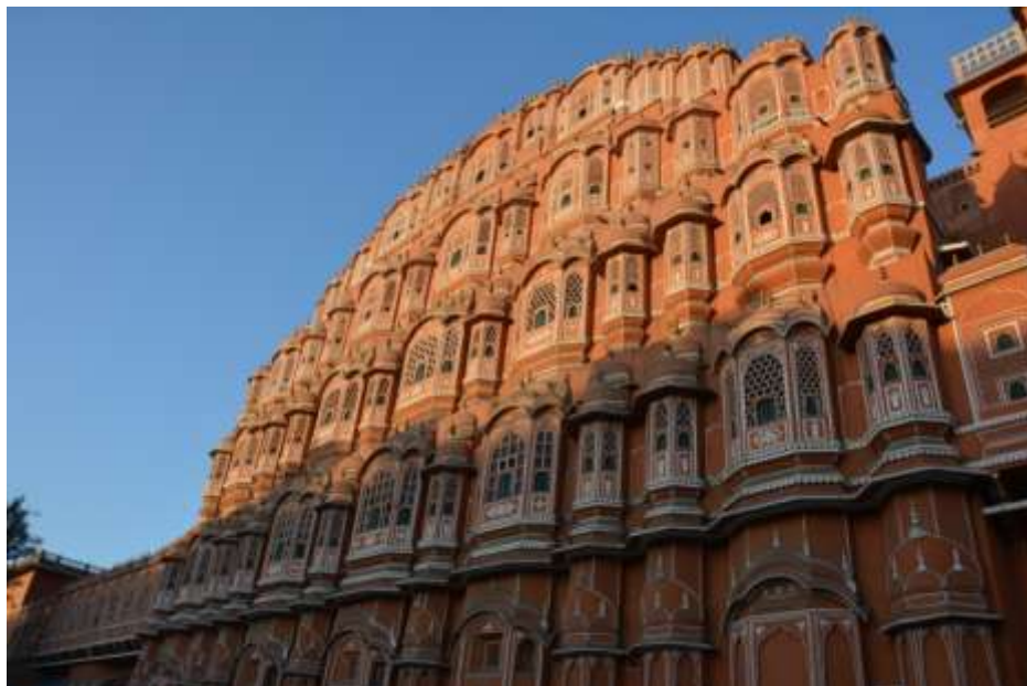
Palace of Winds

On the next morning our guide took us to the Palace of Winds or Palace of the Breeze, a palace so named because it was essentially a high screen wall built so the women of the royal household could observe street festivities while unseen from the outside. After a short photo-stop we continued to Amber Fort.