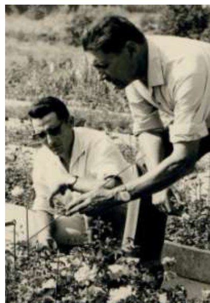
selecting new varieties in the 60's

generation whenever necessary. The yearly production now totals over 300,000 roses.