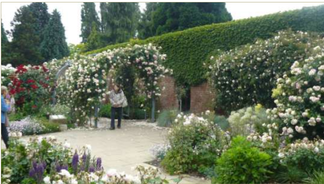
'Pierre de Ronsard' at the Hobart Botanic Gardens