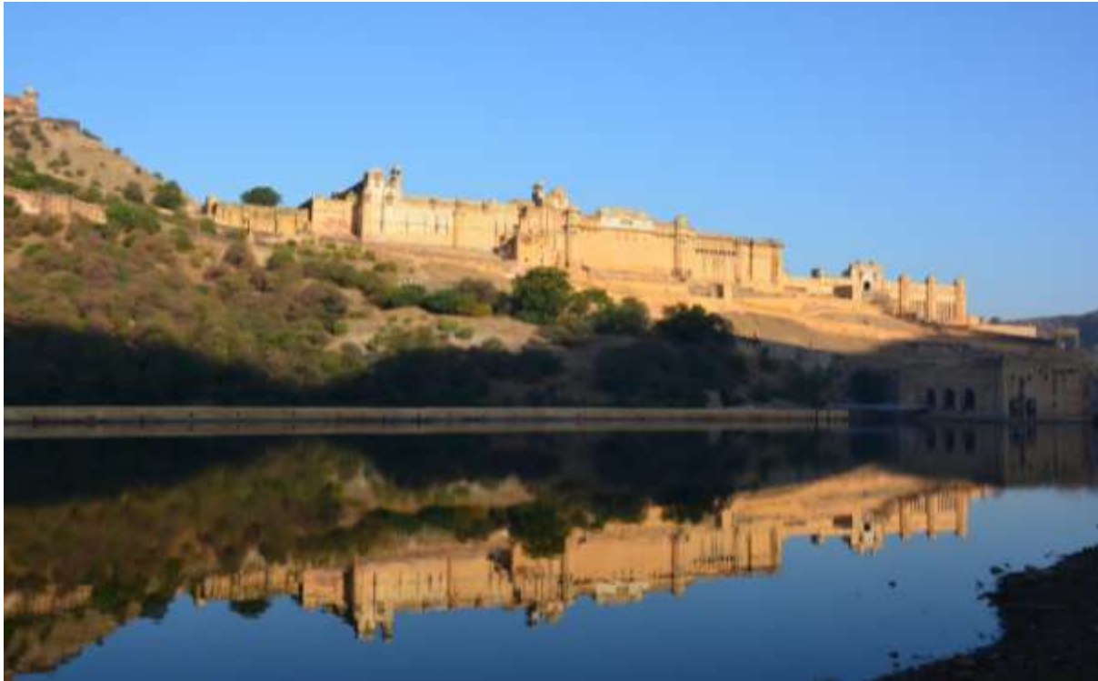
Amber Ffort and Maota Lake

As soon as we were out of the bus, we were surrounded by merchants offering us the traditional scarves, pictures, wooden elephants, etc. Painted elephants took us to the palace on top of the mountain, a shaky trip, and all along the path Indian photographers took pictures of us which they offered us later for money.