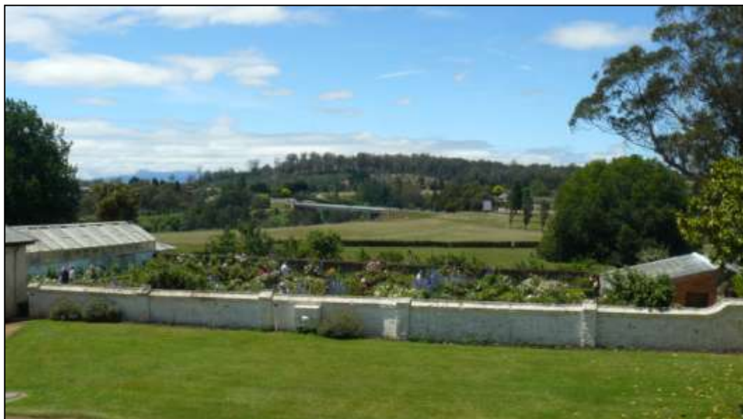
An overview of the walled garden at Entally House

The second day honed in on the historic homesteads, Clarendon House, Franklin House and Entally House. We were also able to look through the homesteads all furnished in the traditional lifestyle of their time. The bonus of the day was our tour of the Brickendon garden, the homestead still owned and lived in by the seventh generation of Archers. This garden is a plantsman's paradise with a huge array of unusual perennials, shrubs and trees. Amidst many spectacular roses 'Sally Holmes' held pride of place, a huge mass of creamy single blooms.