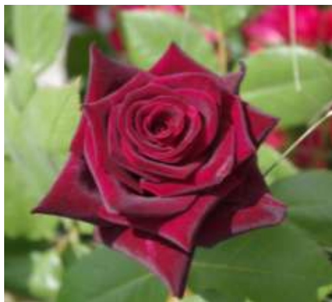
'Black Baccara' (Meilland, 2000)

Sunday, 31 st May - After lectures and presentations of future conventions the afternoon was free to enjoy the Rose Festival in Parc de la Tête d'Or. Lots of people and lots of activities were in the rose garden. Local rose breeders, different rose societies, cities, rose parks and gardens and private people had stands exhibiting their roses, organizations, parks, products and other excellences. The city of Orleans' stand was outstandingly tasteful and from the city of Nantes there was quite an exhibition of pots in all shapes and sizes. A walk along the breeders' stands was a show window for new varieties. Eye catchers for me were, among others 'Black Baccara', 'Chateau de Pupetières' and 'Souvenir de Josephine'.