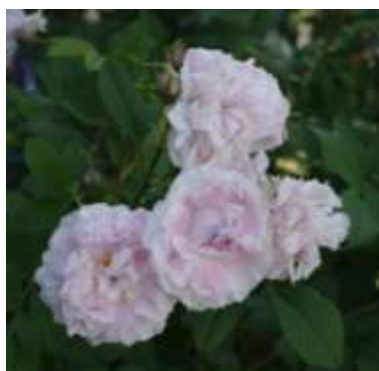
'Martin Frobisher' (Svejda, 1961)

What we had not expected was two Canadian rugosas: 'Martin Frobisher' and 'David Thompson'. They are appreciated roses in Iceland, Norway, Sweden and Finland with their somewhat colder climate, but here in France they looked splendid and thrived well. More noisettes, moschatas and old roses filled this beautiful and very varied garden, a garden with a nice, and cozy straightforward atmosphere.