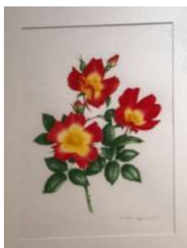
Painting of 'Cocktail'