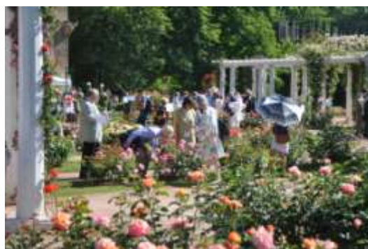
International Jury at Parc de la Tête d'Or