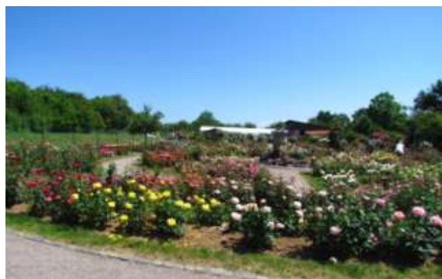
Rosheim Garden