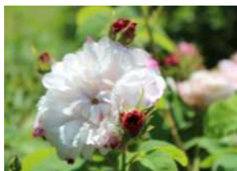
'Léda' - 1826