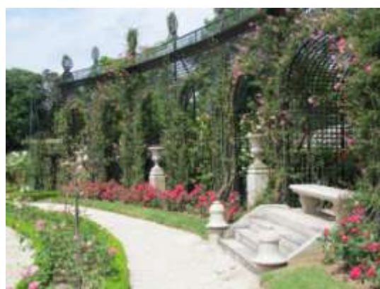
Roseraie de l'Hay du Val de Marne