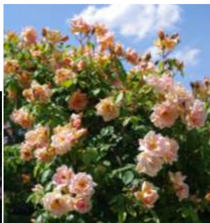
'Crépuscule' (Dubreuil, 1904)