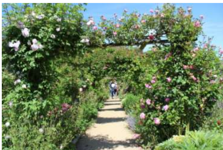
Arbour of climbing roses

We were greeted by a long arbour, simply composed of birch wood that supports climbing roses and clematis. Here we saw some of the most beautiful Old Garden Roses. Andre's garden is a lovely mix of old garden roses, modern roses, perennials and annuals. This must be what heaven looks like.