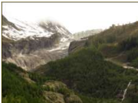
The Glacier d'Argentière photographed with a telephoto lens from Argentière. The bare rock shows the original thickness and extent of the glacier

The Glacier d'Argentière high above Argentière could be seen clearly as we left the restaurant. It still shows the spectacular crevassed ice front and the bare rock exposed in front of it as the glacier has retreated due to global warming.