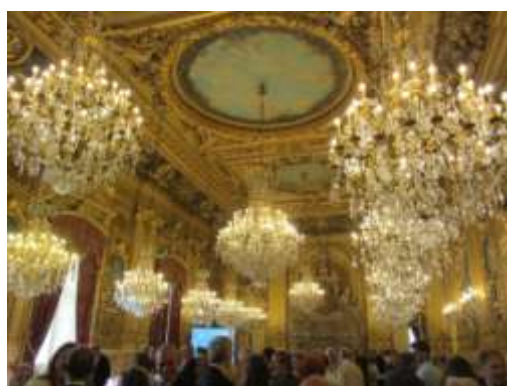
The regal interior of the Hotel de Ville