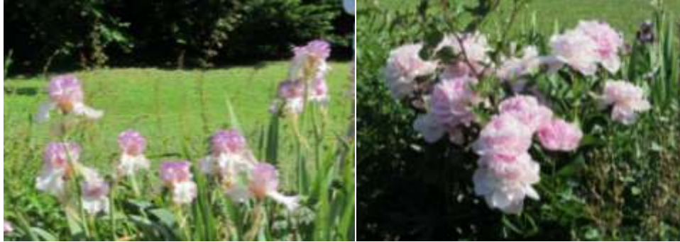
Delicate shades of irises and peonies adorn this tranquil garden

The Bionnay Gardens and Château are situated within the Beaujolais region and date back to the early 1900's. In 2011 the garden was listed as 'Jardin Remarquable' by the French Ministry of Culture. This 5 hectare garden comprises a number of smaller gardens of different themes.