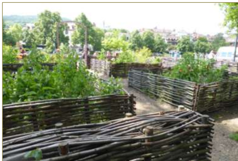
The Medieval Garden with its traditional willow walls

We walked through the Botanic Garden which consisted of various rooms – Japanese, Renaissance, and Jurassic Park etc. toward the boat "Dragon Fly" where lunch was served whilst cruising around the lake.