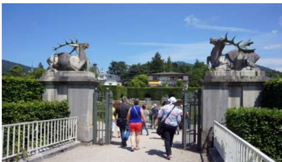
Gönneranlage Rose Garden - Baden Baden