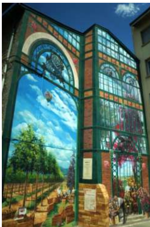
Fresco of roses – a tribute to the rose growers Champagne au Mont d'Or