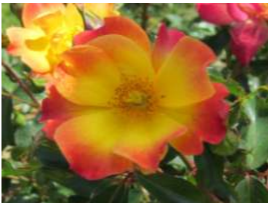
'Tout Feux Tout Flamme'