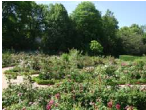
The new Rose Garden at Malmaison