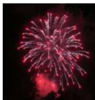
Fantastic fireworks display