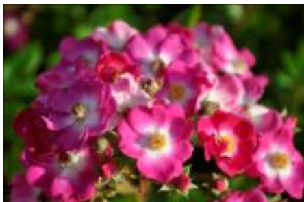
No. 523 "La Palme du Rosier Paysager" – for the best shrub or grandcover rose Y 1247 Breeder: Lens, Belgium

Some other outstanding rose novelties were awarded a medal by the members of the permanent jury and have to be mentioned: