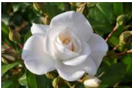
No. 140 "La Palme du Rosier à Massif" - for the best Floribunda Prague ® Castle ® Poulcas 043 Breeder: Poulsen, Denmark