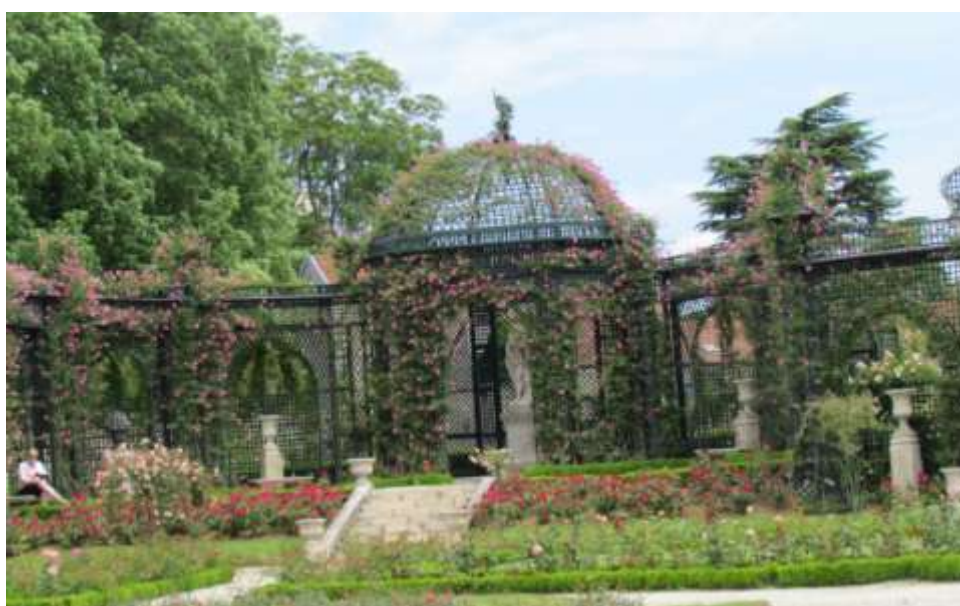
Roseraie de l'Hay du Val de Marne

grown over rows of large arches. Roseraie de l'Hay has the distinction of being the first European garden dedicated entirely to roses, and its 13 areas tell the story of the rose from its Asian beginnings to the present, including sections such as The Garden of Gallic Roses, The Garden of Modern French Roses, and the Garden of Modern Roses.