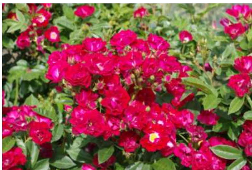
'Merveille des Rouges' (Dubreuil, 1911)

We decided to walk back to the Centre de Congrès through the lovely park. We used the opportunity to walk by the Rose Trial Garden to see some of the (perhaps) "roses of tomorrow". A lovely day, but with more to come: At 22.30 all hell broke loose – but in the good way. For more than 20 minutes the most fantastic fireworks, offered by the municipality of Caluire et Cuire, filled the sky over Lyon. From "our" side of the Rhône we had the best view of these spectacular fireworks which had brought lots of locals in the street. Fireworks cannot be described – they must be seen and experienced. I have never seen or experienced anything as exceptional as this.