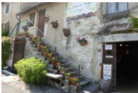
Anxious for flowers – geraniums at the Caveau Bugiste

On to the Caveau Bugiste for wine-tasting with more food, and whilst the historic collection of stone tools, cork screws and liqueur glasses was riveting – and yes, there were some roses in bloom – the grandeur of those giant trees would have to be the ever-lasting memory of this Pre-Convention Tour.