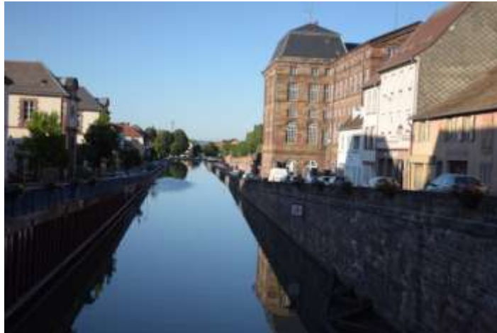
Canal near the hotel Chez Jean on the way to Saverne