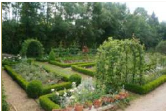
Château St. Bernard hedged rose garden and arched pear trees