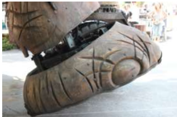
Machine – the Grand Elephant spraying water and an elephant foot

We enjoyed dinner at Maison Baron Lefèvre where the salmon was the best. On our last day of the tour, we visited the Roseraie Loubert. A conservatory of antique roses and botanically significant plants. Their roses and plant collection are listed in the national CCVS (Conservatory Collection of Specialized Plants). The purpose of CCVS is to help preserve and prevent the loss of antique plants, maintaining biodiversity.