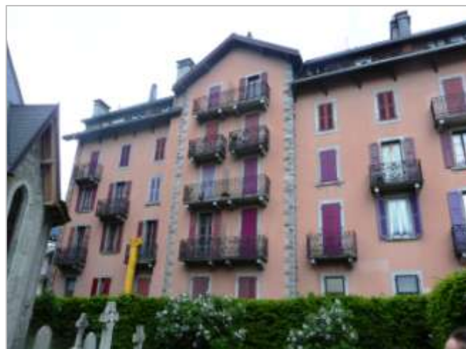
Interesting balconies seen from the bus along the way

This tour can best be described as “50 shades of green – and not a rose to be seen” – well not quite, but nearly. A pick-up time of 06.30 at the Best Western and then a circuitous route to the Congress wasn't a bright start, but then we were off driving along the promenade alongside the Rhone on a glorious sunny morning, admiring the beautiful wrought-iron balconies of the apartments.