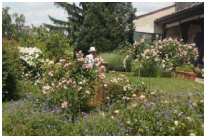
Bernard Tuaillon's Garden