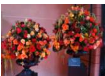
Beautifully arranged roses at the entrance to the Finger Buffet function, which took place on the evening of Wednesday 27 th May. Original foods and wines from the Rhone-Alpes region were served.