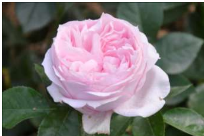
No. 126 Prix "Armand Zinsch – Prestige de la Rose" - for the best Hybrid Tea Rose Chateau Barbeyrolles ® Lapbar Breeder: Laperrière, France

Four special prizes were awarded which were based on the judging of the international jury: