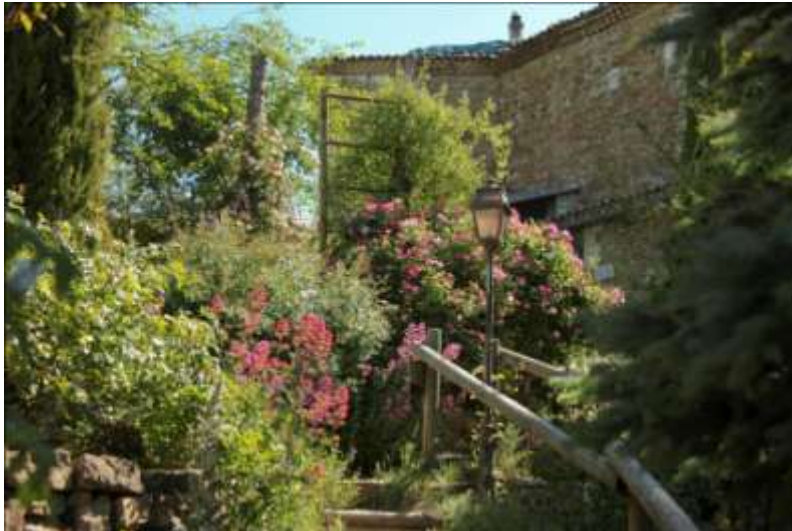
Abbey of Valsaintes garden

The last stop was the garden of Dominique Croix at Bourg Argental in the heart of Pays du Pilat regional park which lies in a mountain range between 1400 and 1432 meters altitude. Here the Mediterranean, continental and oceanic climates alternate and compete and give an incredible diversity of natural resources.