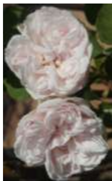
'Souvenir de la Malmaison' 1893