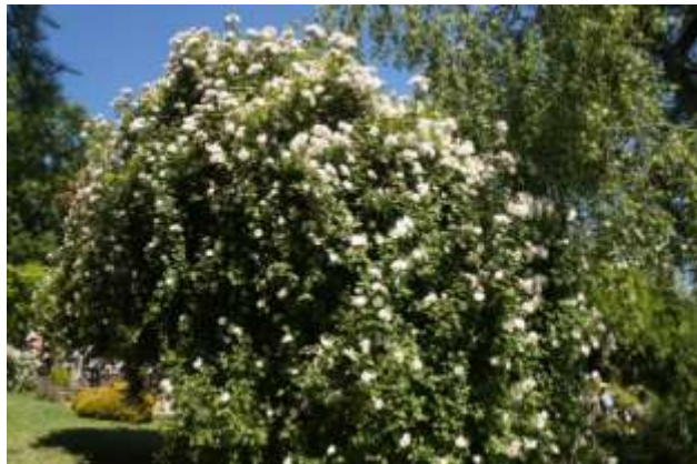
'Venusta Pendula' reintroduced in 1928 by Kordes