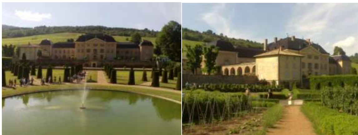
Château De La Chaize