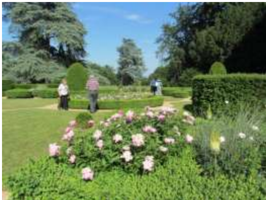
Old established trees form a backdrop to this section of the garden