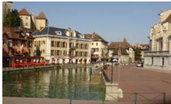
Walking around Annecy, nicknamed "Venice of the Alps"

We walked through the Botanic Garden which consisted of various rooms – Japanese, Renaissance, and Jurassic Park etc. toward the boat "Dragon Fly" where lunch was served whilst cruising around the lake.