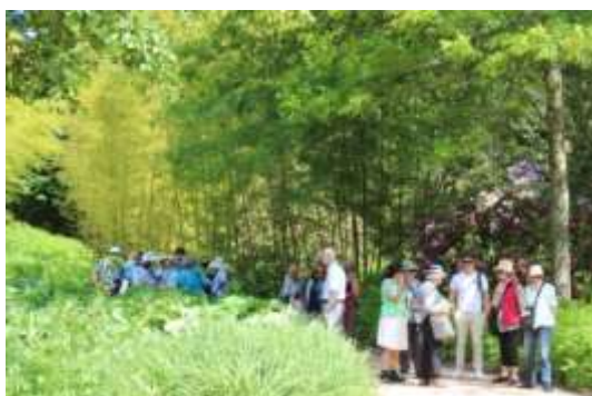
Walking trail through the park