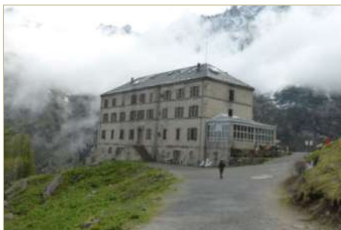
The railway station at Montever where some hot coffee was welcome

The glacier is reached by the rack railway of Montever, a veritable wonder of engineering, and as we arrived there was a light fall of snow - how is that for someone who "loves a sunburnt country"? Then the sun came out - we walked around the glacier, into the crystal cave, looked through the museum showing early explorers and the workers building the railway and watched a short film. Back onto the bus – and the drive back down the mountain was not for the faint-hearted.