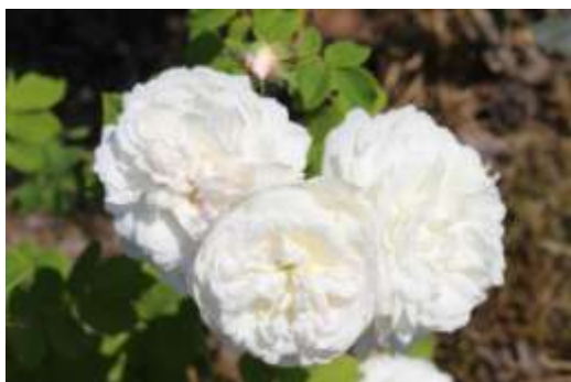
'Mme Plantier Alba'