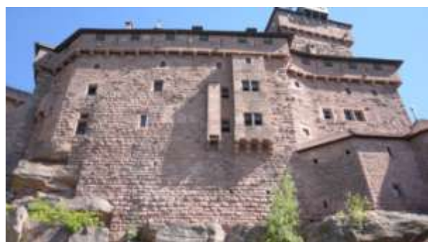
Chateau du Haut-Koenigsbourg - Strasbourg