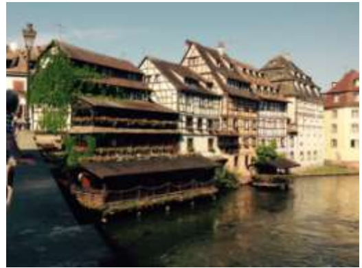
15 th and 16 th century buildings as seen from the boat on the Third River