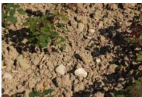
Note the chunks of limestone in the rose garden beds - the soil is quite alkaline