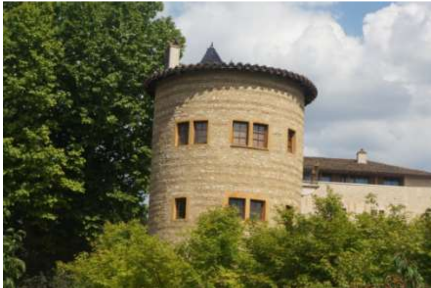
Rear view of Château St. Bernard

CHÂTEAU SAINT BERNARD is a 13 th century castle, located on the banks of the Saône River approximately 20 km north of Lyon, The castle's restoration commenced in 1996 and in 1997 it was classified as an Historical Monument. The Gardens of Saint Bernard Castle are composed of three parts: the main garden consisting of twelve small theme gardens, including more than 600 apple and pear trees; the rose garden which connects the two main parts of the garden; and the nearly 500,000 daffodils in spring;