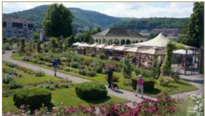
Roseaie de Saverne – France

In Saverne we visited Roseaie de Saverne which dates back to 1898. This is a WFRS Award winning Garden of Excellence (2002). Here we were welcomed by the President of the Rose society and entertained with traditional dancing and supper in the rose garden which was a most enjoyable and fun evening.