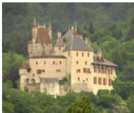
The 'fairy-tale' castle, Château de Menthon-Saint-Bernard