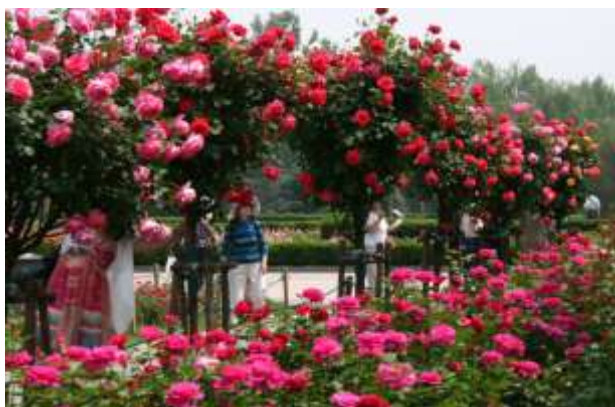
Rose Garden at the Beijing Botanical Garden

The 2016 WFRS Rose Convention in Beijing promises to be most exciting, with lectures, daily tours to historic sites and rose gardens, special performances and dinners. There are two pre-convention and three post-convention tours to choose from. The sixteen lectures cover history, breeding, culture and science of modern and old roses. Some of the speakers are: