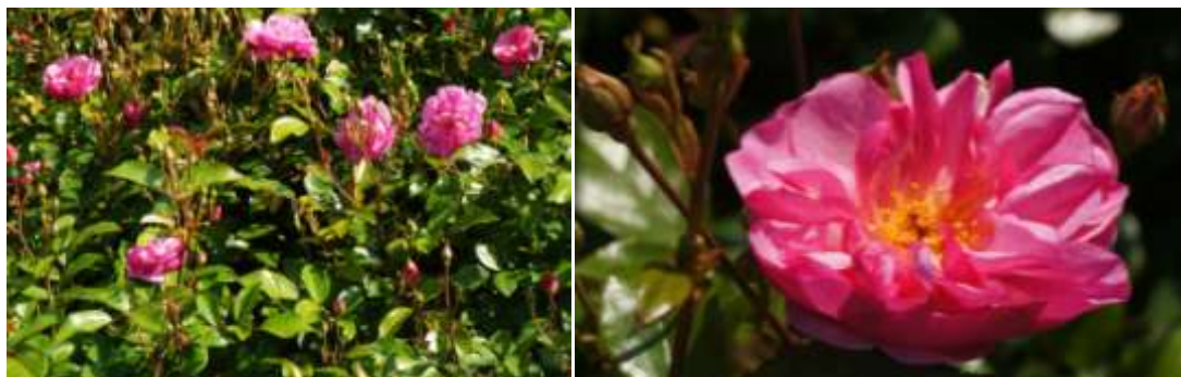
'Louis Blériot' AEN 'Lavender Meidiland' (2009)