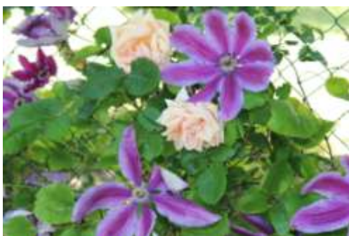
'Paul Lede' - 1913