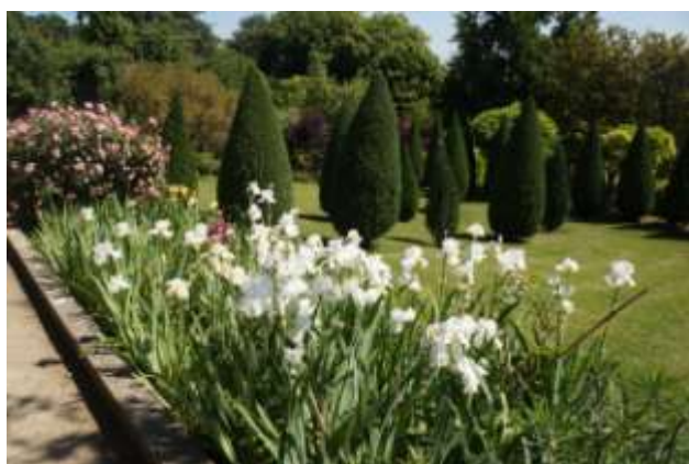
'Raubritter' (Kordes 1936), 1 of more than 800 varieties labelled in this garden, clipped Cypress trees in the lawn and white irises.