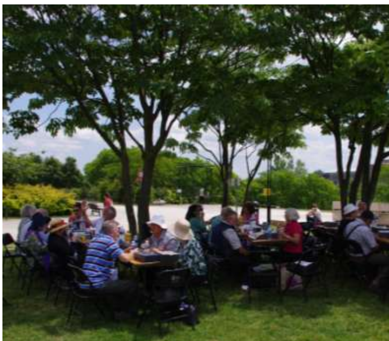
Lunchtime in the Roserie de Saint-Clair

Saturday, 30 th May - This afternoon the theme was Rose Gardens and Parks . We were taken by bus to Roserie de Saint-Clair in Caluire et Cuire which was on the other side of the Rhône just opposite the Centre de Congrès. Tables and chairs had been set up in the shade of some trees: Lunchtime. And what lunch-boxes the French can come up with! Super!!!