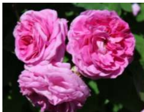
'Baronne Prévost' - 1842