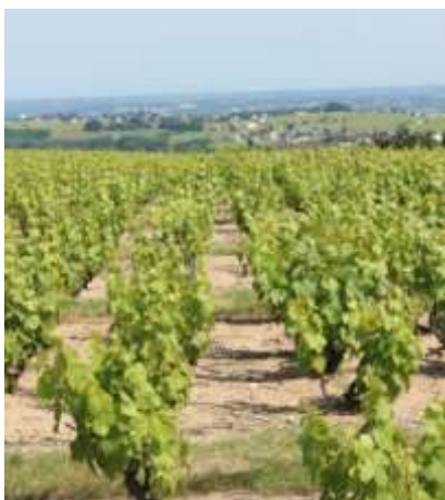
Acres of vineyards

We departed early Tuesday morning and headed northwest toward Orléans, travelling through the Beaujolais (wine) country. The region is filled with vineyards and buildings of local golden stones that are distinctive of the area.