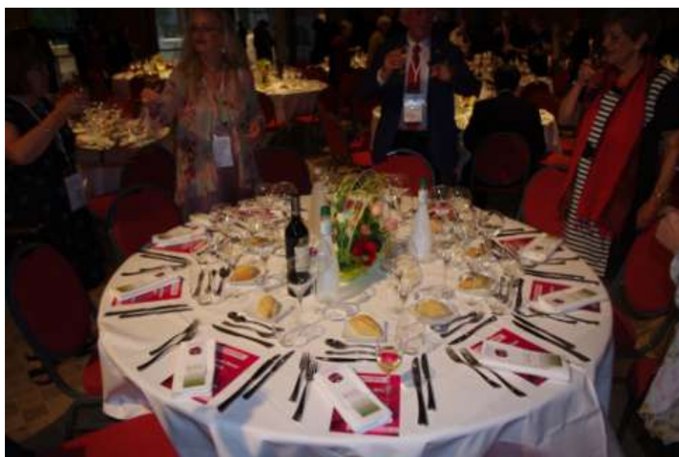
A table set for the Closing Dinner