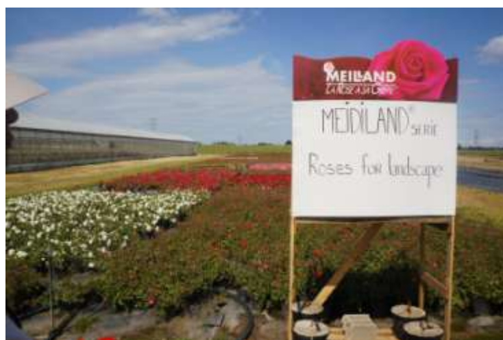
Growing area for Landscape Roses