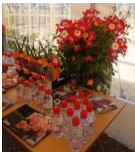
Welcome table with refreshing drinks

ROSERAIE MEILLAND RICHARDIER where delegates were offered refreshing cool drinks before an orientation from a member of the Meilland Richardier family followed by a guided tour of the various green houses and propagation areas.