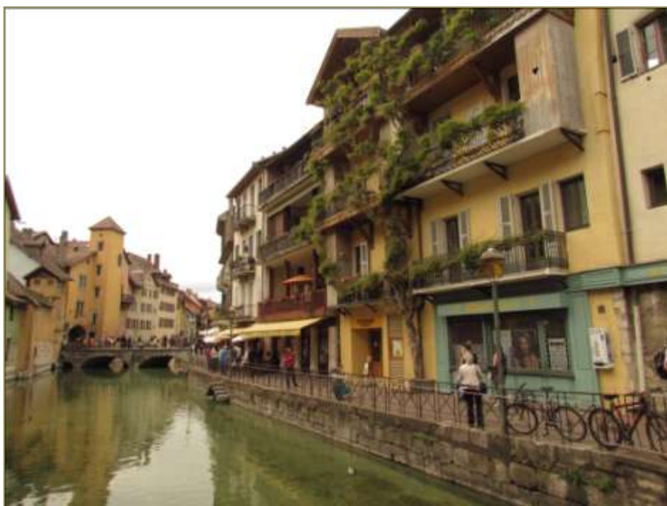
A venerable Wisteria in Annecy le Vieux

We left Annecy at about 15.30 and took the road to Chamonix. As we approached Chamonix, we passed the spectacular Glacier des Bossons , arriving in the town just after 17.00, in light rain. Chamonix is about 224km from Lyon.