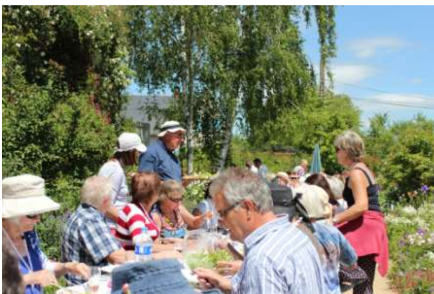
Lunch in the garden of André Eve

Food and wine flowed from the kitchen – tray after tray of delicious hors-d'oeuvre, entrees and desserts - enough to satisfy any appetite.