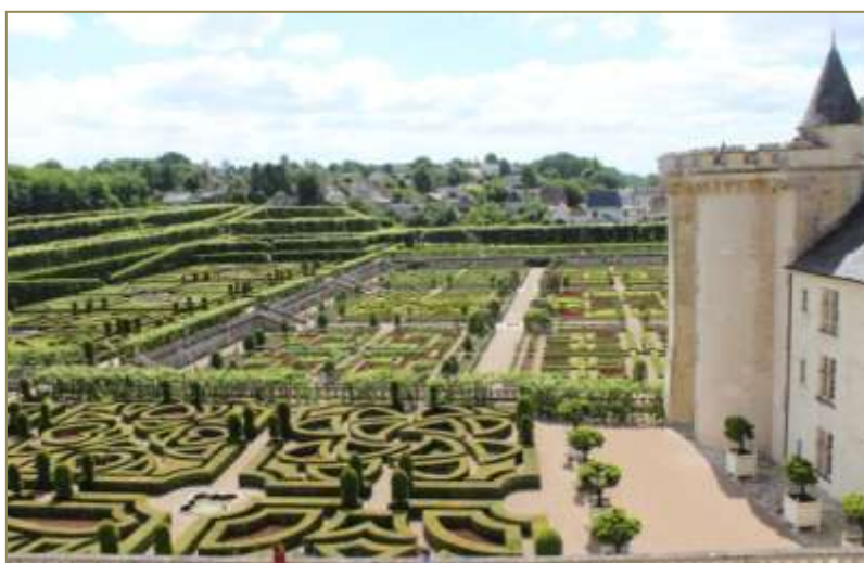
Two of the six gardens of Château de Villandry