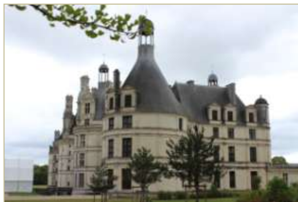
Château de Chambord

Next stop - Château de Chambord is the largest of the Loire castles. In 1516, Francois I, King of France, came back from Italy with Leonardo da Vinci with a desire to create a large pleasure palace, symbolic of his power. Since Leonardo da Vinci died in 1519, mystery still swirls about the extent of his involvement in the castle design. But some of the unique architecture, such as the positions of the double helix staircase, openings are included to provide a flow through the building and the presence of vaulted ceilings on the second story are many touches that appear to be da Vinci's.