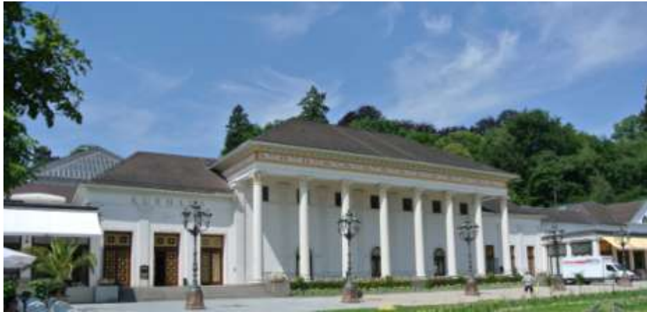
The Casino – Baden Baden

From Saverne we travelled to Baden Baden. It is a most elegant spa in Germany with two beautiful rose gardens - Gonneranlage and Beutig which received the WFRS Award of Garden Excellence in 2003 and where the Annual International Rose Trials take place. Unfortunately the tour was too early for the roses to be in bloom in the rose gardens of Beutig and Gonneranlage. The photos of Beutig below were taken later in the season. Baden Baden is also known for it's Casino.