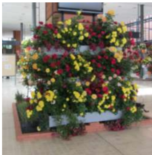
A display of roses at the entrance to the Centre de Congres