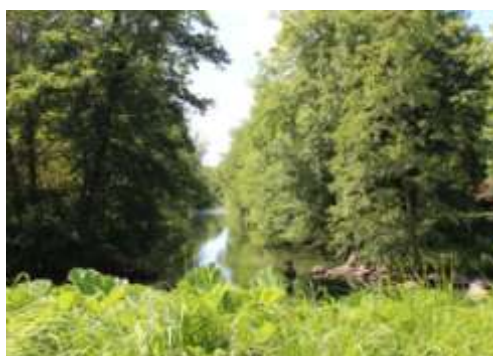
Loiret River meanders through the park