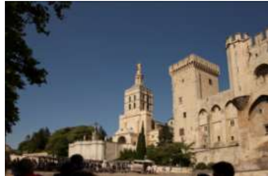
Palais des Papes

Then we visited the historical city Avignon with lots of churches, chapels and splendid medieval buildings. The most impressive is the gothic Palais des Papes with an area of 15,000 square metres - one of the largest medieval buildings in Europe, with its towers rising up to 50m high. Avignon is also called City of the Popes, because from 1309 until 1423 Avignon was the residence of popes.