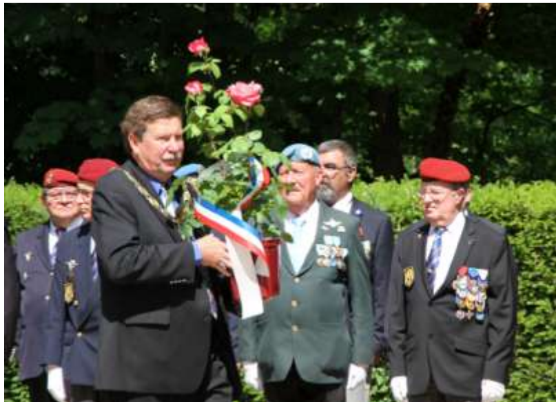
Drakkar ceremony in Lyon