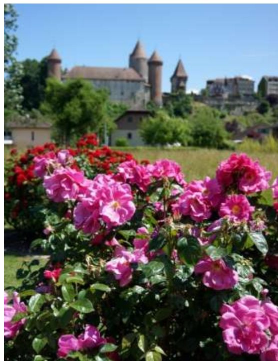
Château de Chaux à Estafvayer from Roseraie d'Estafvayer