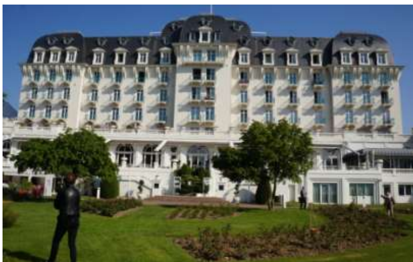
Hotel Imperial Palace