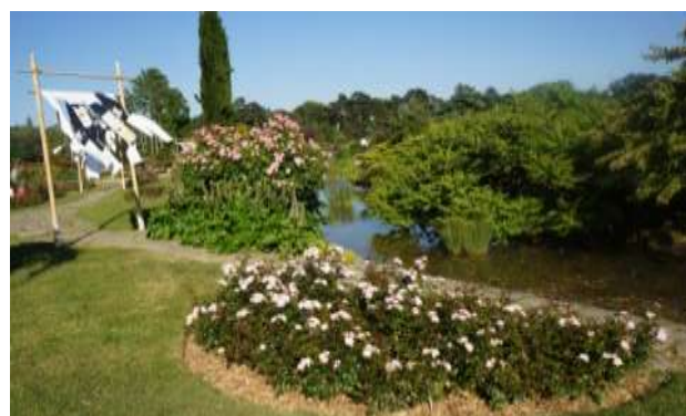
Part of the art exhibition in Parc de la Tête d'Or