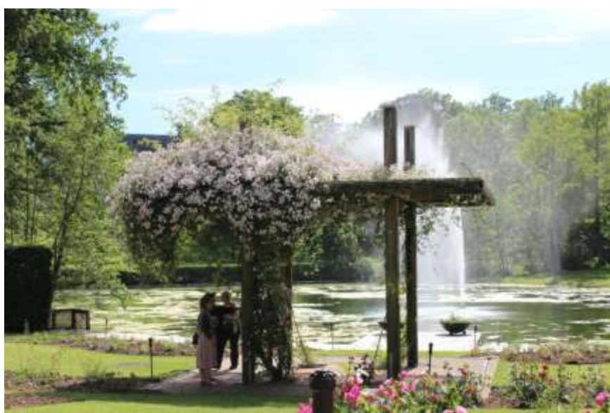
Pergola smothered in roses and clematis