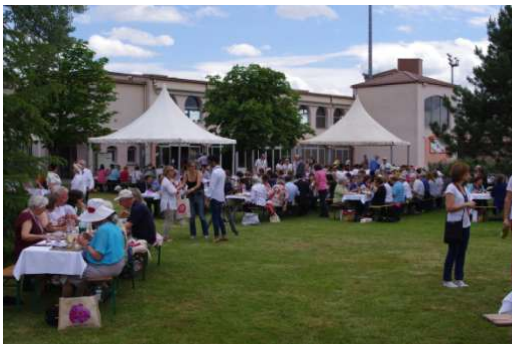
Picnic lunch “on the grass”