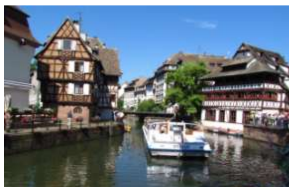
Delegates on the cruise