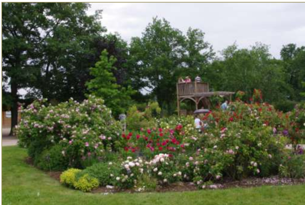
De Roseraie de St. Galmier

in your garden, get out and get it! It is simply stunning. The same goes for the modern, continuously flowering 'Sourire d'Orchidée'. We have it in our garden and love it! A new acquaintance was 'Suzon' reminding a bit of the Lens-rose 'Plaisanterie' with its shimmering colours. Often confused with 'Erinnerung an Brod' (Geschwind, 1884) it was exciting to see the velvet-like 'Souvenir d'Alphonse Lavallée'. 'Roville' – certainly an eye catcher – was one of the last impressions before leaving this wonderful, scent-intoxicating collection of roses.