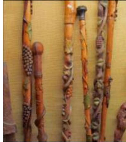
Part of the collection of walking canes carved with grapevines in the museum

After a tiring day with an afternoon wine tasting, many people slept on the journey back to Lyon (about 116km).