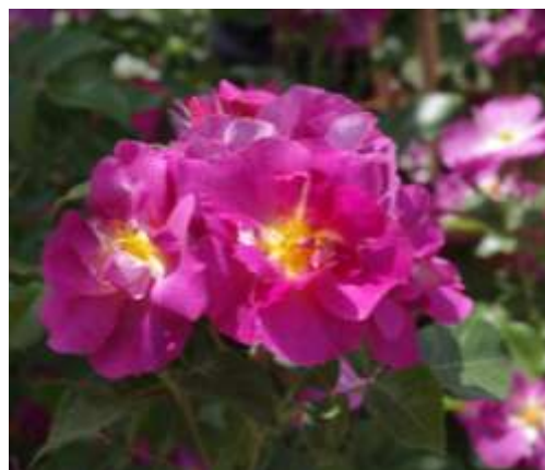
'Chateau de Pupetières' (Felix, 2014)

Walking around watching all the roses and shows I suddenly heard the sound of a street organ. I went after the sound and soon stood in front of a covered stage where five couples dressed in the style of 1890 performed dances from the period. I felt as if I was looking at a Toulouse-Lautrec picture and could not help feeling very lighthearted and happy.