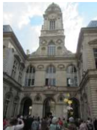
Hotel de Ville