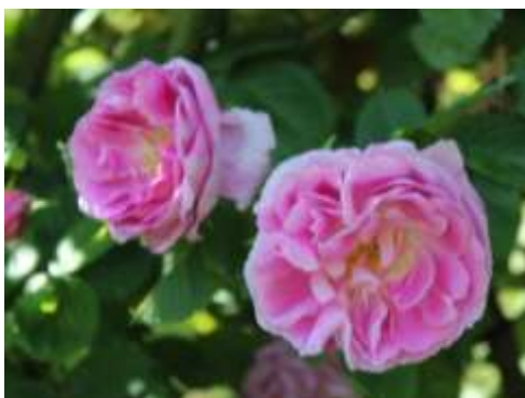
'Celine' - 1826