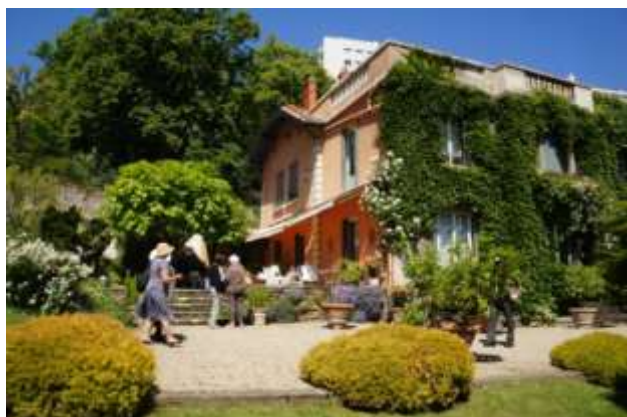
Rear of the house – La Bonne Maison