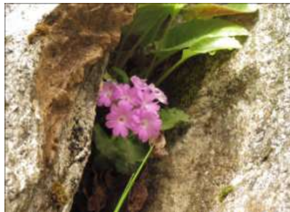
Primula sp. (possibly P. hirsuta ) flowering in a rock crevice at Montenvers

Only a few alpine flowers were in bloom near the station, including a small Primula species (possibly P. hirsuta ) with bright pink flowers but other plants such as Alchemilla alpina and various fern species were coming into active growth. No wild roses were evident in the vicinity but there were wide expanses of "Alpen Rose" ( Rhododendron ferrugineum ) that would flower about a month after our visit, in late June or early July.