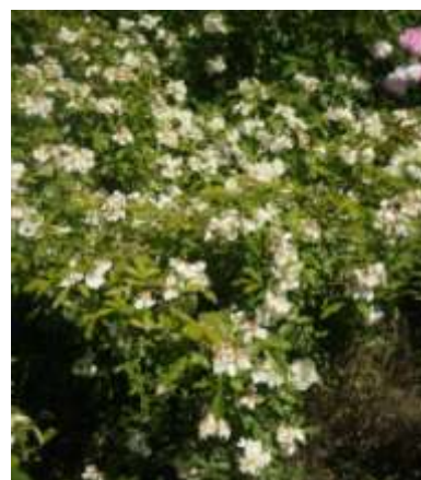
'Banksia Alba Plena' 1807