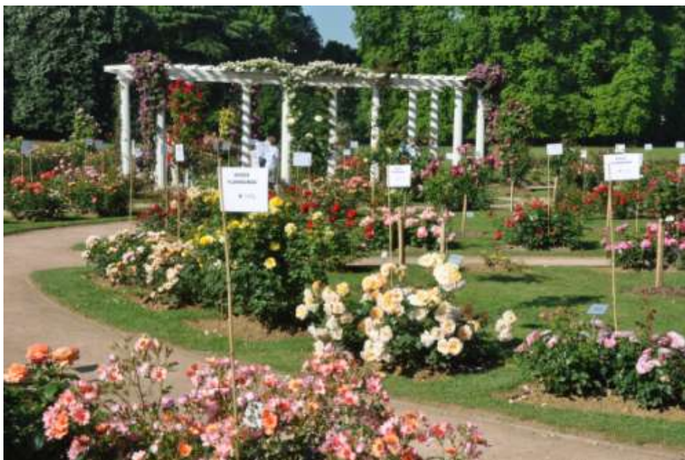
The Rose Trial Garden - Parc de la Tête d'Or

Markus Brunsing – Germany - text and photos