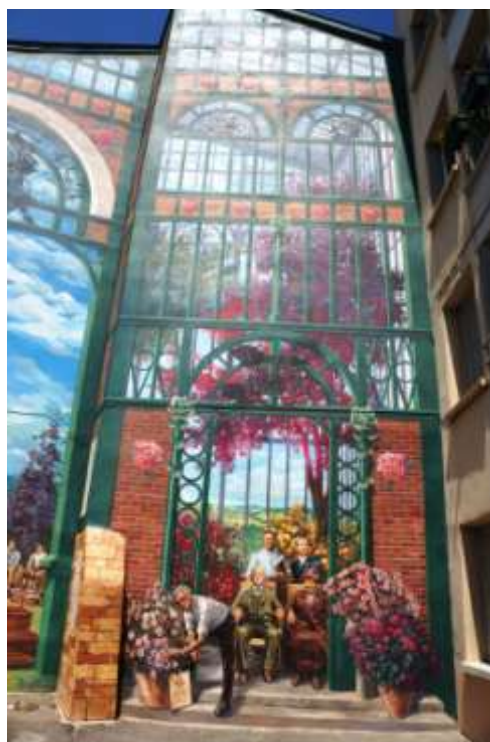
Fresco depicting the four generations of the Laperrière family