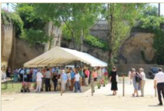
Le Mystère des Faluns lunch tent at Quarry - Rosiers and Fruiteurs Doué La

One last stop before returning to Lyon, Le Mystère de Faluns. We were greeted by the Rosiers and Fruiteurs Doué-La-Fountain, the number one marketer of roses and fruit plants in France, producing 3.5 million roses per year. Lunch was served under a tent by "des Perrières" and we were allowed some time to explore the historic quarry dating back to 500 B.C.