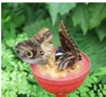
Butterflies and Orchids in the Butterfly House