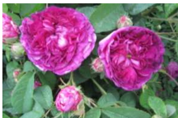
'Charles de Mills' (1790)