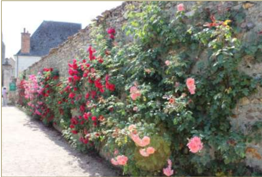
The rose garden – Villandry

Following a busy day of being tourists, we enjoyed another wonderful meal and wine in Nantes. After a good night's rest and breakfast at the Ibis hotel, we departed for Le Parc Floral de la Beaujoire in Nantes. This park offers beautiful views of the Erdre River and, is home to nearly 20,000 landscape roses, 1600 different varieties, along with iris, magnolias, heather and many other perennials. The city of Nantes and the French Society of Roses organise the "La Biennale Internationale de la rose parfumée" in this park. Every other year, the park hosts the only competition of fragrant roses that exists in the world. The jury consists of two panels. A technical jury evaluates the health, vigour and growth of the roses and the second, composed of perfumers, make up the international jury of Great Noses.