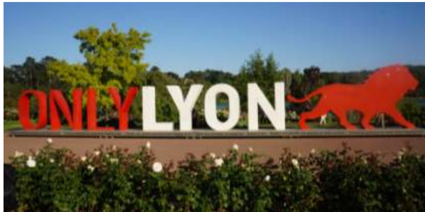
PARC DE LA TETE D'OR

The park is less than 5 minutes walk from the Centre de Congrès in Lyon - the venue for the World Rose Convention. It was part of The City of Lyon's Rose Festival to raise awareness of The Rose and their history. The entire Parc de la Tête d'Or is an area of approximately 117 hectares (290 acres) and within it, is The International Rose Garden of Lyon, inaugurated in 1964, which covers 40,000 sq.m. and has some 30,000 roses of 350 varieties. There are two other rose gardens: within the park - the Rose Garden of the Botanical Garden which traces the history of the rose; and the Rose Trial Garden where the International New Roses Contest takes place each year.