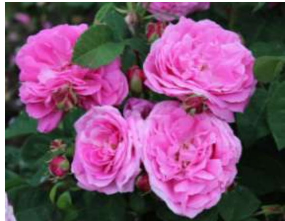
'Panachee d' Orléans'

Next stop - Château de Chambord is the largest of the Loire castles. In 1516, Francois I, King of France, came back from Italy with Leonardo da Vinci with a desire to create a large pleasure palace, symbolic of his power. Since Leonardo da Vinci died in 1519, mystery still swirls about the extent of his involvement in the castle design. But some of the unique architecture, such as the positions of the double helix staircase, openings are included to provide a flow through the building and the presence of vaulted ceilings on the second story are many touches that appear to be da Vinci's.