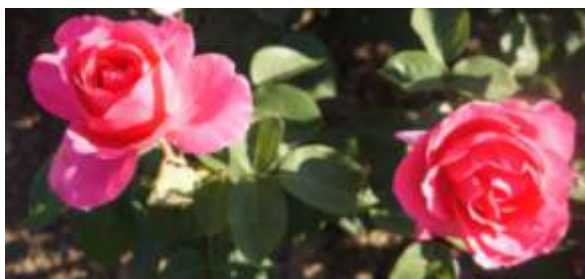
'Monique Laperrière' seen in La Clé de la Rose

Cluny is the centre for Romanesque Architecture in France and is approximately 90 km north of Lyon. The garden was opened in June 2010 and has more than 300 roses and 54 varieties and also contains many perennials and irises. In bloom at Cluny and with several plaques about its significance, was 'Resurrection', a deep pink HT rose, bred in 1976 by Michel Kriloff (France) in memory of 22 women from Cluny who were deported to Ravensbrück concentration camp in 1944.