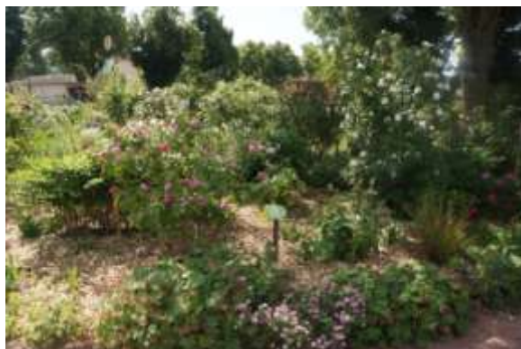
A section of the garden