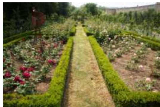
Château St. Bernard Rose Garden