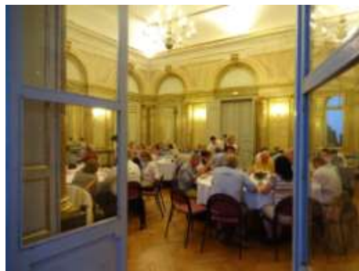
Dinner at the Château de Rohan