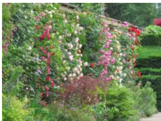
Bagatelle - Paris