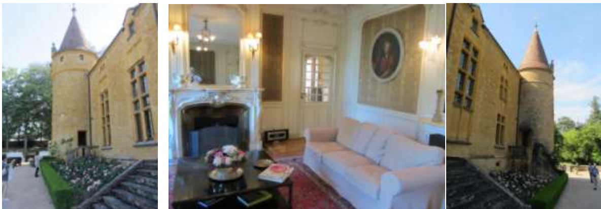
The yellow stone mansion surrounded by beautiful gardens