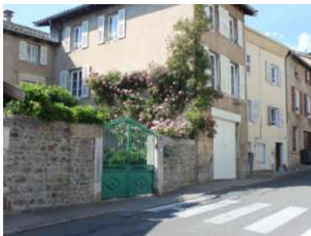
Local golden stone buildings