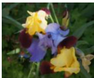
Colourful Irises among the roses