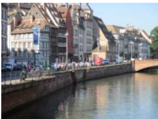
Delegates waiting for the boat in Strasbourg

On the last day we travelled to Strasbourg where we had a 1 hour cruise on the Third River. Strasbourg is the seat of the European Parliament.