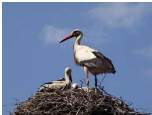
Storks on a nest in Strasbourg

On the last day of the Post Convention Tour a very enjoyable day was spent at the Rosheim Garden where rose society volunteers gave the delegates a delicious meal.