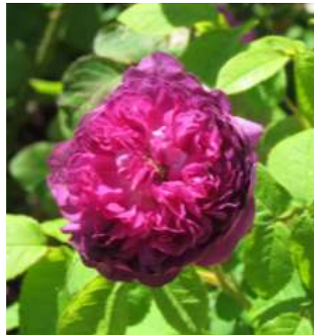
'Fleurs de Pelletier'

After three days of reveling in the beauty of the roses and admiration for the dedication and efforts of the people who made these wonderful gardens possible, our trip to Versailles was the low point of the post tour for me. Although it is one of the "must-see" venues for any visit to Paris and an architectural marvel, it struck me as a monument to royal privilege and excess, a culture which led inevitably to the French Revolution. Elbowing our way through the Hall of Mirrors with thousands of other tourists was a far cry from wandering through the rose gardens of previous days.