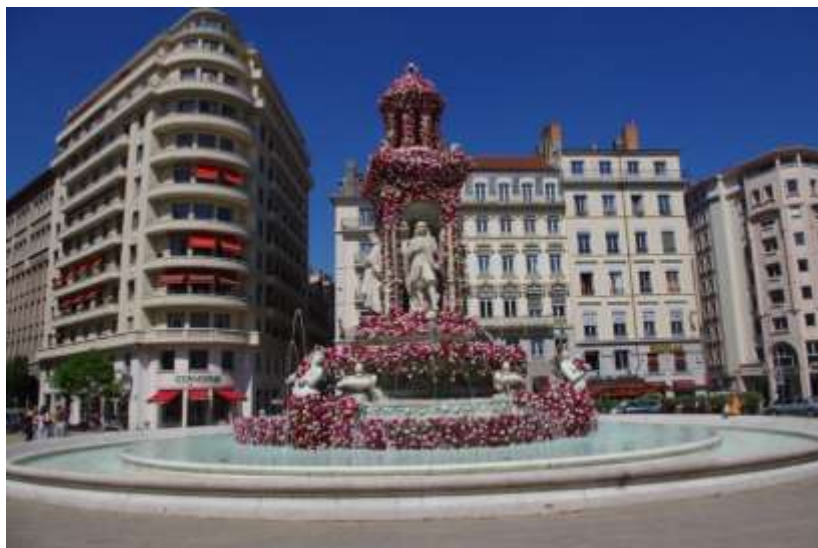
Place de Jacobins

In the centre of Lyon – wonderful city! In the basin in Place de Republique carpets of roses were floating and even the blue lion had been decorated with a necklace of roses, but the most spectacular view was definitely the fountain at Place des Jacobins.