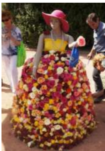
Seen at the Rose Festival in the park