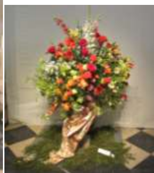
An interesting and innovative rose arrangement exhibition was enjoyed by the delegates