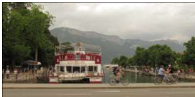
The boat 'Libellule' moored at the Quay Napoléon III

In the park close to the town, the 50 th International Volleyball Tournament was taking place with what seemed to be dozens of volleyball games taking place at the same time. We crossed a footbridge over the canal which contributes to the Annecy's nick-name ' Venice of the Alps ', eventually reaching the Quai Napoléon III where the restaurant boat ' Libellule ' (meaning 'Dragonfly') was moored. We boarded the boat and took our seats in the restaurant for lunch. As we ate, the boat sailed the length of the main part of the lake but some of us felt the need to leave the table at intervals to view the lake and mountain views that we passed from the top deck. It was a tasty lunch but it can be rather frustrating to be expected to concentrate on eating while passing through dramatic scenery that you cannot see properly from the restaurant! Many will have missed a view of the romantic 'fairy-tale' castle, Château de Menthon-Saint-Bernard , dwarfed by the nearby mountain escarpment. I chose to sit on the top deck for the whole return trip.