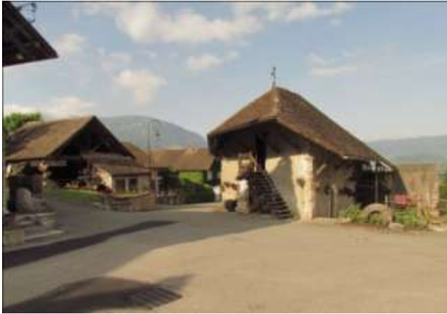
The museum and other buildings at Le Caveau Bugiste in Vongnes

We started our return to Lyon via Chamonix. On the way, we diverted to the village of Vongnes in the historic Bugey Region where we visited Le Caveau Bugiste , watched a film about wine production in the area and visited the museum of tools and equipment used in the vineyards and wine making. The museum included an attractive collection of walking sticks carved with grapevines. A wine tasting in the cellars followed, after which some members of the group purchased bottles or cases of wine!