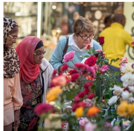
Midlands Rose Society Rose Show – October, 2015