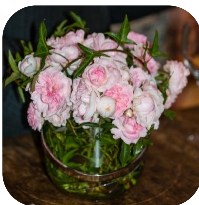
'Rousefrenn' – 'Rosefriend'