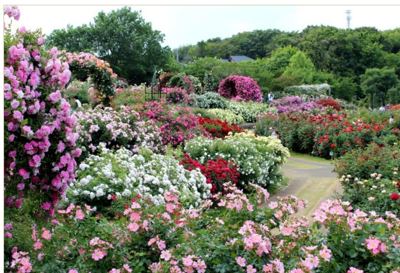
Keisei Rose Garden

Apart from the display garden, the Keisei Rose Nursery has an excellent rose themed shop and restaurant. As an outer suburb of Tokyo, it is a must visit destination.