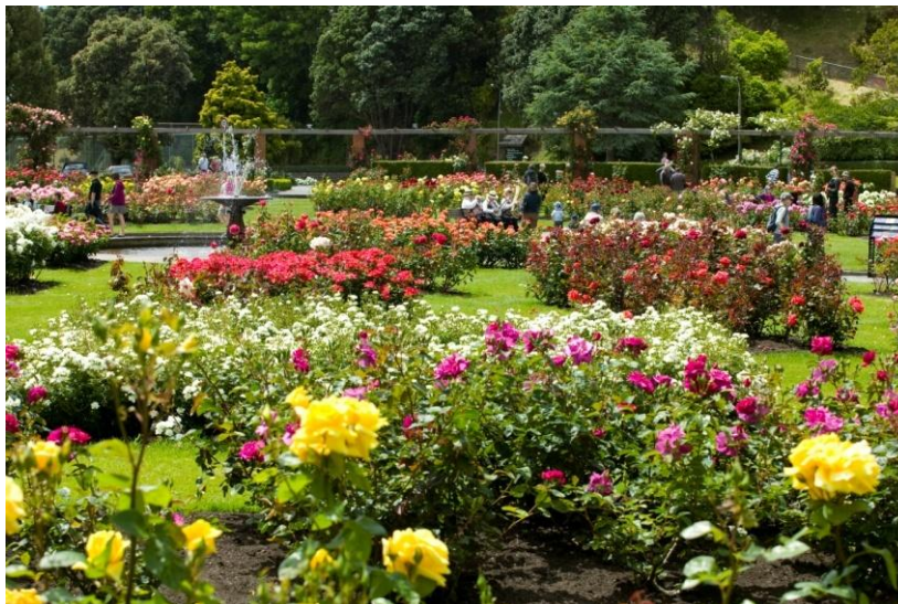
Lady Norwood Rose Garden in the Wellington Botanic Gardens