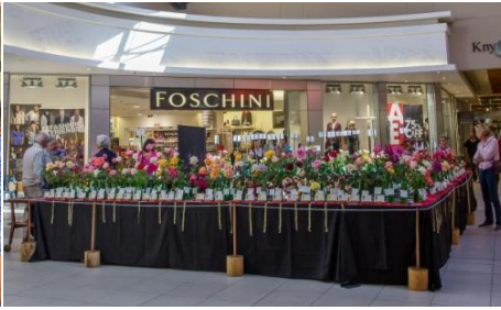
The Knysna Rose show in a shopping Mall – April, 2015