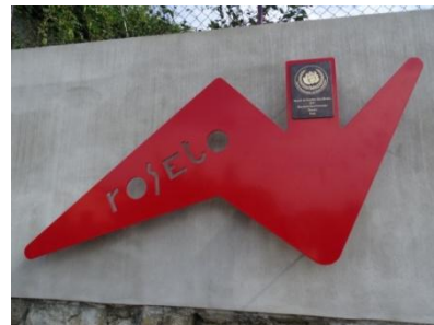
The WFRS plaque for the Award of Garden Excellence