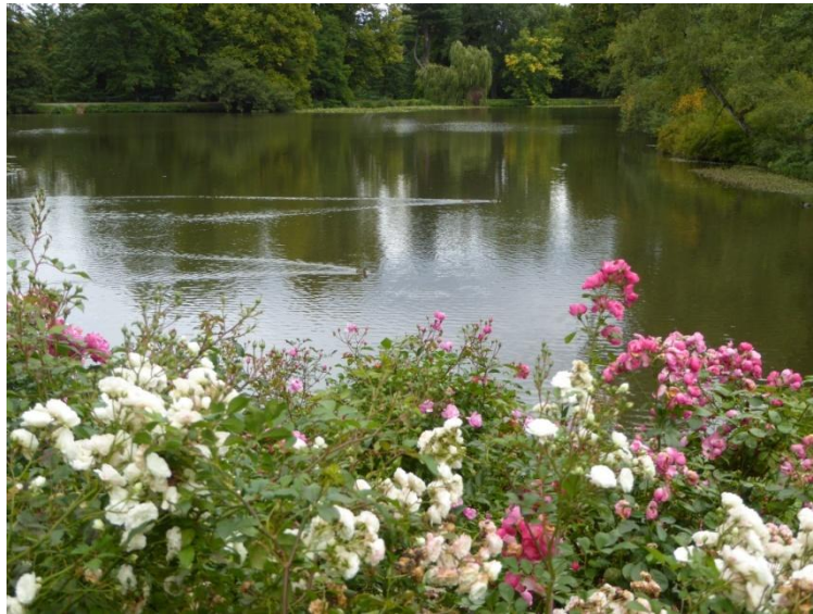
Flowering small shrub roses on the Wilhelmshöhe Park's Island of Roses