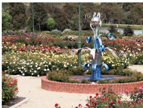
Mornington Botanical Rose Gardens

The Mornington Botanical Rose Gardens are located in the seaside town of Mornington, approximately 60 km. south-east of the city of Melbourne. This is a delightful garden comprising 4,000 roses of 250 varieties planted in 86 beds in a very well designed garden which forms the overall shape of a yacht, with sail, mast and waves.