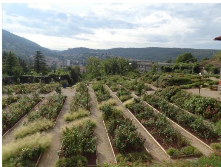
San Giovanni Rose Garden - Trieste

The Lyon Convention was attended by two representatives of the Rose Society in Slovenia and a group of members of Volčji Potok Arboretum, who spent one day visiting the venue to get ideas for the preparation of the Regional Convention in Slovenia.