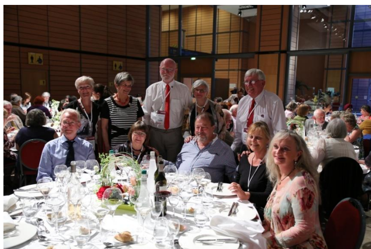
THE DANISH TEAM