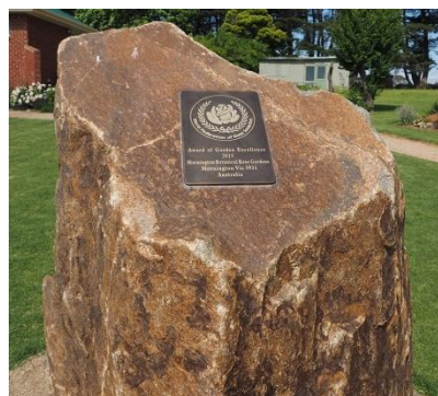
WFRS Award of Garden Excellence plaque