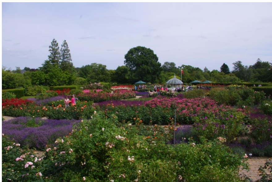
The Geographical Gardens in Kolding