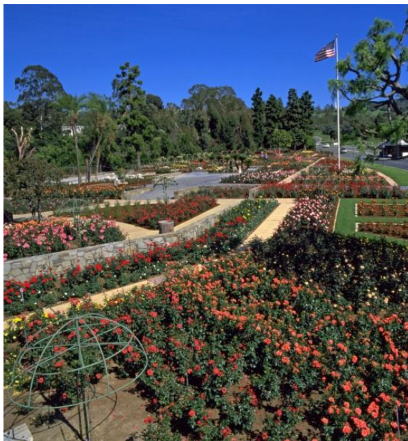
Rose Hills Rose Garden, California WFRS Garden of Excellence - 2006

I hope all of you reading this are enjoying your roses, wherever they grow!