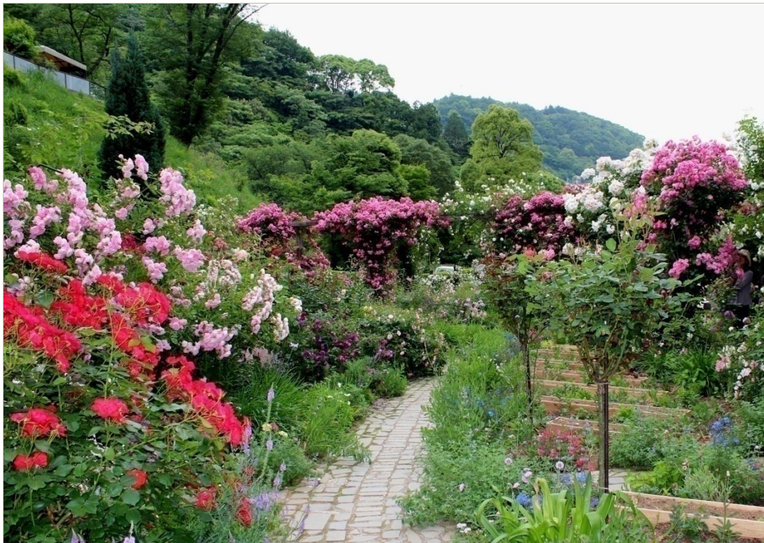
Akao Herb and Rose Garden