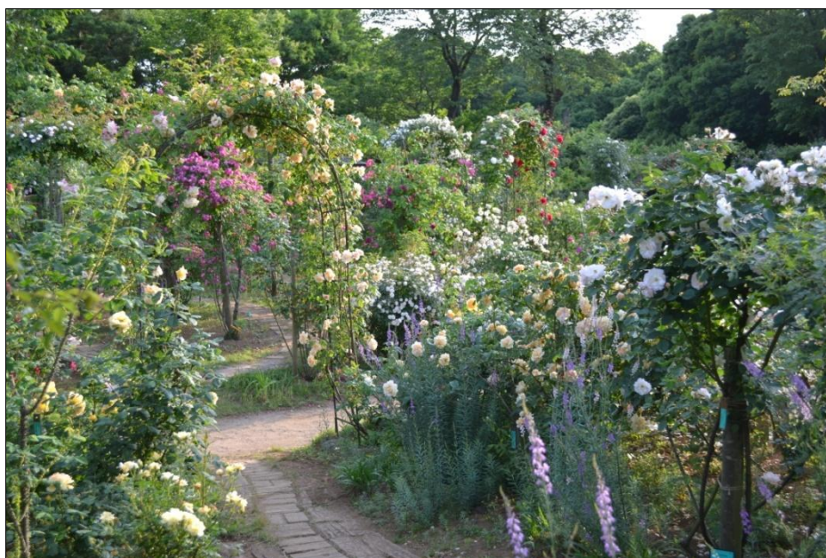
City of Sakura Rose Garden

This beautiful garden is relatively close to Narita Airport, Tokyo and is definitely worthy of a visit.