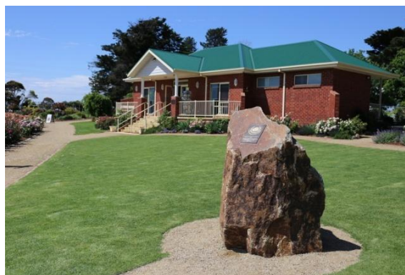
Mornington Botanical Rose Garden