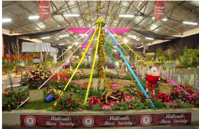
Midlands Rose Society Gold Medal display at the Witness Garden Show