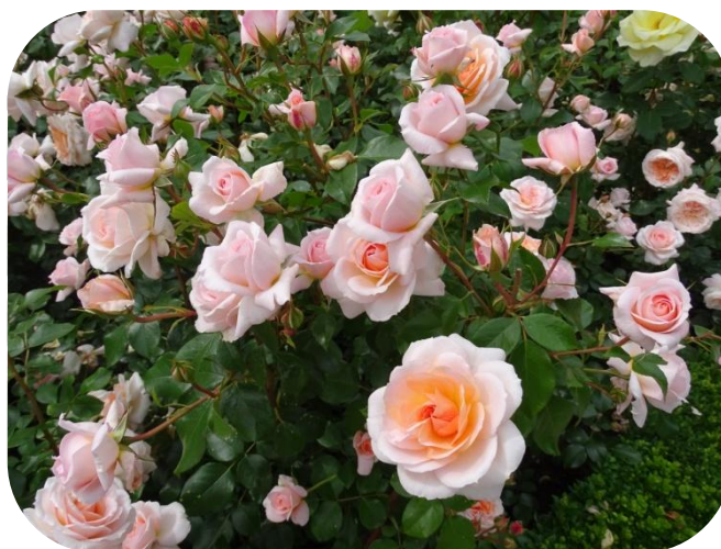
A beautiful Delbard floribunda