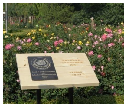
WFRS Award of Garden Excellence plaque