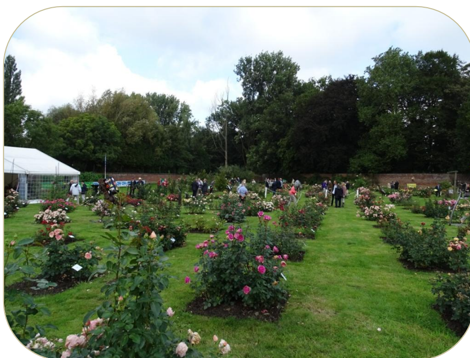
Le Roeulx Rose Trial Garden