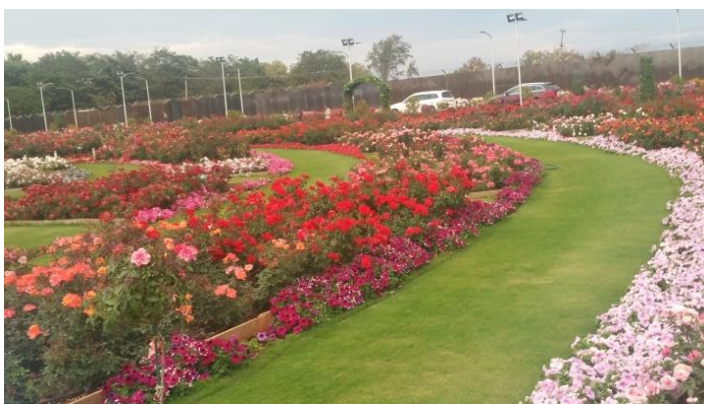
Green Valley Rose Garden