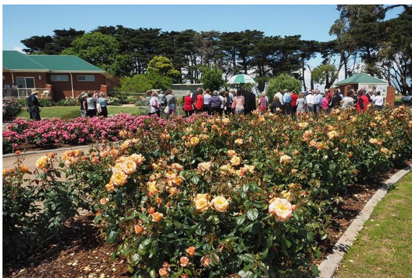
Mornington Botanical Rose Gardens