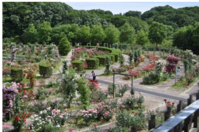
Flower Festival Commemorative Park Gifu