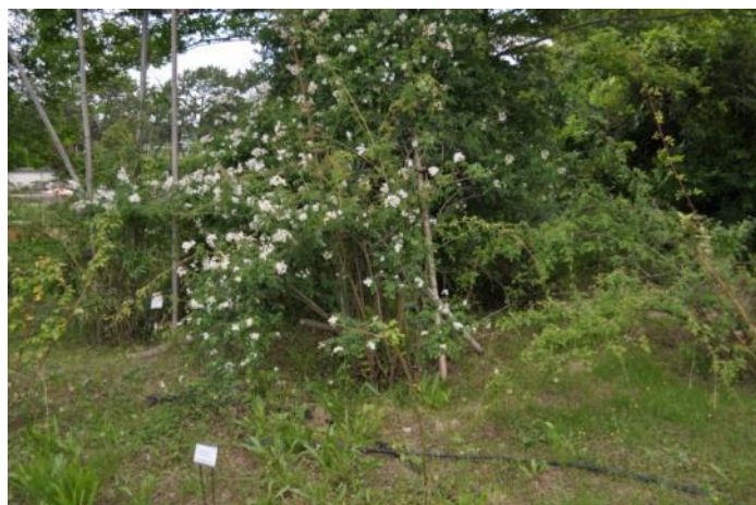
Wild roses planted in an area which reminds us of their natural habitat