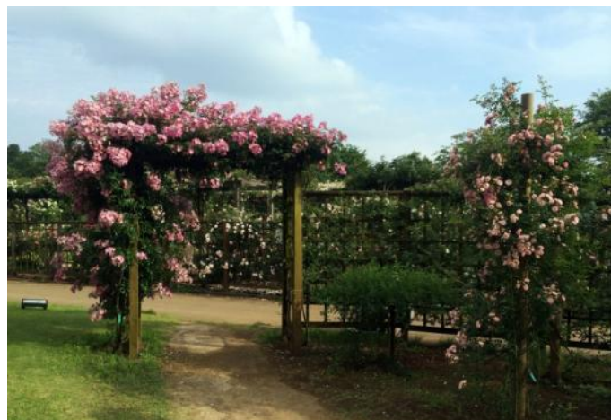
Kusabue-no-Oka Rose Garden