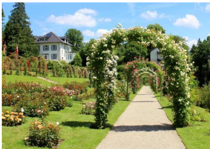
Rose Novelty Garden Beutig, Baden Baden