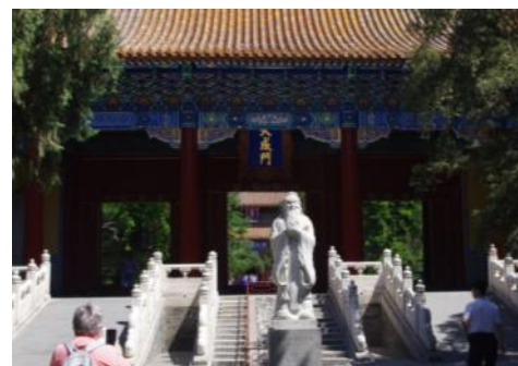
Entrance to Confucius Temple