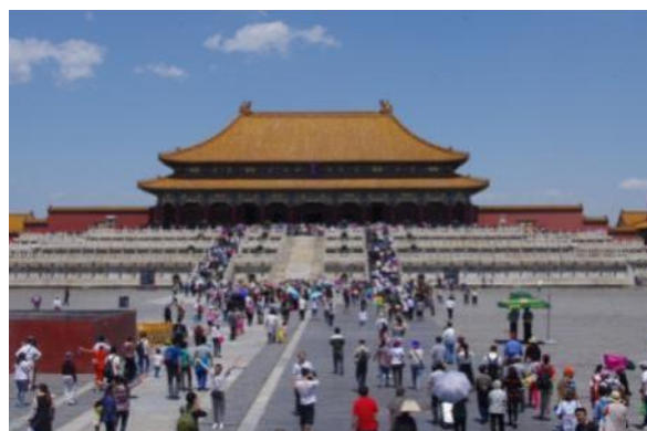
The Imperial Palace