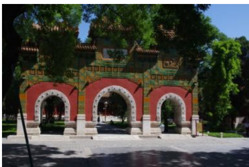
Memorial Arch in the Imperial Academy

In the morning of the last day, we went to the Imperial Academy, where the civil servants of the Chinese Empire were educated over a period of 800 years, the oldest building dating from 1287. There was a particularly beautiful courtyard with very old trees, some of them were dead, but still looking green because they were covered by ivy-looking plants. The central building was a sort of pavilion where the emperor once a year came to deliver a speech to the students at the academy. There was an old painting of that scene in the room of the pavilion. Then we went to the temple of Confucius. There was a marble statue of him in front of the temple building. The building was full of many exciting old music instruments to use during the worshipping of Confucius. During our visit, hundreds of young school children came dressed up like the students of former times. Perhaps a kind of re-educating the young people of China today? The Academy and the Confucius Temple were situated in a hutong with many interesting front doors. Here were the homes of many wealthy Chinese people.