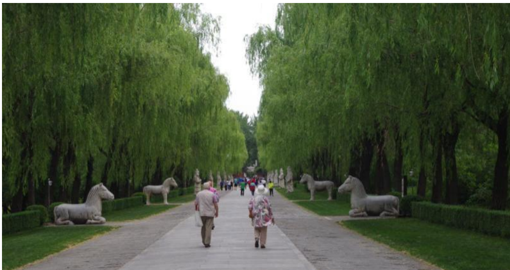
The Sacred Way with marble sculptures of animals

The second day we went 50 to 70 km. outside of Beijing to the north west, to the graves of the emperors of the Ming Dynasty, the Ming Changling and to the Great Wall at Mytianyü. That was a marvelous day with those two fantastic historical sites. On our way up to the Ming graves, we drove through plantations of cherries. It was just the time for ripe cherries. There are 13 graves from the Ming Dynasty, and we saw the most famous one with the beautiful porch and the gate building and walked from there up the Sacred Way with the marble sculptures of animals along the road up to the central hall of the burial site. The Sacred Way was a great experience. It was fantastic to walk alongside the sculptures of those big animals and sacred figures. Behind the sculptures, the most beautiful trees of weeping willows flanked the road. The whole site exuded an air of peace and sacredness. At the end of the road was the Great Hall.