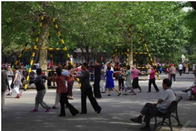
Dancing in Taoranting Park

The last morning – before we had to leave for the airport – we went for a walk in Taoranting Park to experience Chinese everyday life. Different groups of people all over the park were dancing different dances – some with an instructor, others just by themselves, doing exercises, singing, playing traditional instruments, practicing Chinese characters or giving each other massages. Energy, joy of life, relaxation and room for all made the walk that morning in the beautiful park (there was of course also a rose garden) an unforgettable almost emotional farewell experience. That, and the enormous amount of trees, roses and other flowers that filled Beijing – even along 6-laned highways through the city – will be in our minds for a long time.