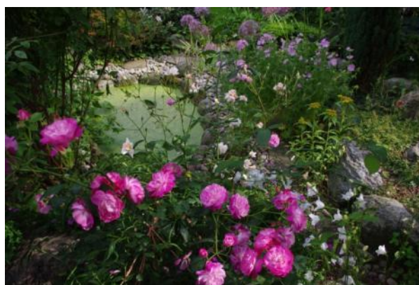
Two beautiful gardens to be seen on the tour