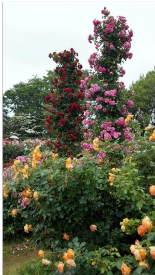
KEISEI ROSE NURSERIES