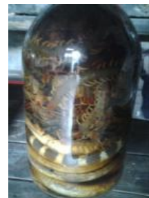
Snake wine was offered and was of interest but not many were keen to taste it.

Yuyuan Gardens was the private garden of the Ming Dynasty. It demonstrates the architecture and design style of a classical Chinese garden and is another pearl of southern gardens. The Jade Buddha Temple on Anyuan Road Putuo District in Shanghai is a well known temple all over the world. Even though it is situated in the flourishing downtown area it is a quiet haven in a busy neighbourhood. Bund on the Huangpu River in central Shanghai is surrounded by towering buildings such as Zhengda Plaza, Shanghai Financial World Centre Jinmao Building and the Oriental Pearl Tower. A quiet walk by the River is the perfect place to contemplate the wealth and splendour of Shanghai.