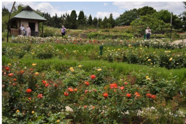
Modern roses planted in an area like terraced paddy fields