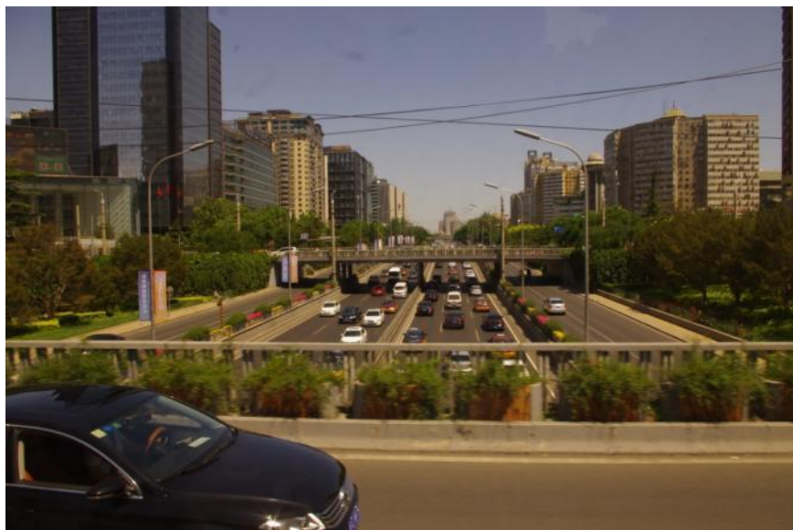
City of Beijing