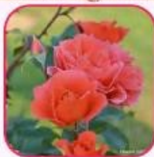
N° 93 Theodore Fontane Rose de Rosen Tantau