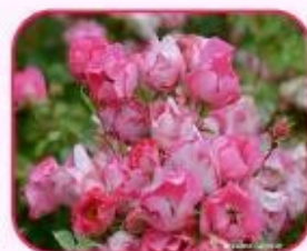
N° 20 Friendly® Pink de Meilland International