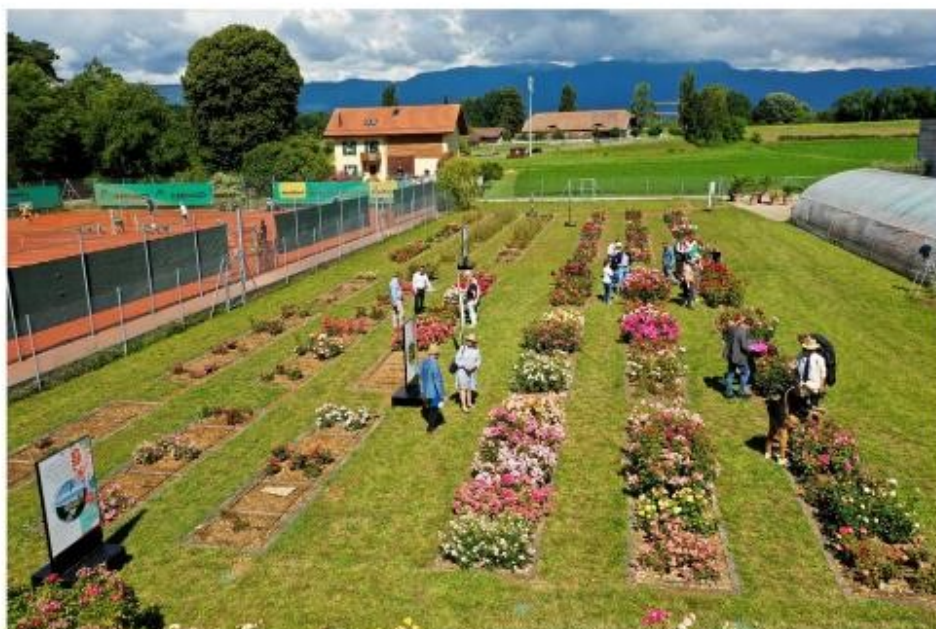
009 : Vue d'ensemble des plantations des éditions 2020 (à droite) et 2021 (à gauche)

Conférence de presse - palmarès du Concours international de la rose nouvelle de Nyon – jeudi 25 juin 2020