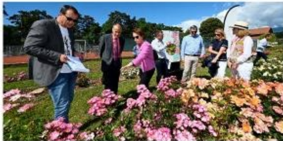
7392 : Jurés au travail