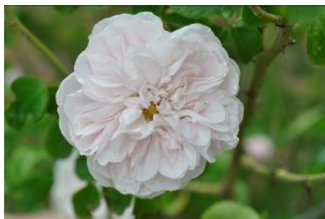
Left: Polyantha 'Grumpy', Right: Rambler 'Garisenda'