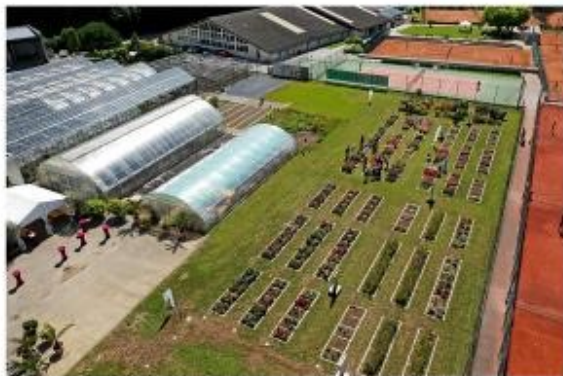
0116 : Vue d'ensemble de la roseraie et des serres du centre des Espaces verts et forêts de la Ville de Nyon

Photos libres de droit, crédit Michel Perret / 20 juin 2020