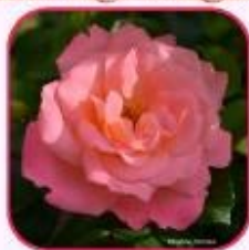
N° 76 Enjoy de Kordes Rosen