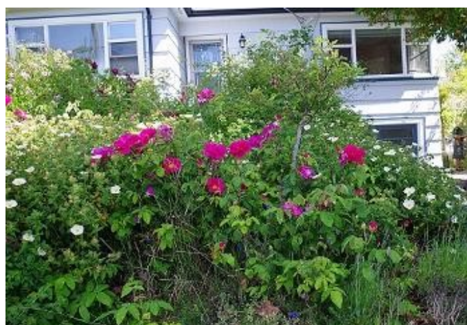
Left: Side of house with 'Goldfinch', Right: Front of house with Rosa gallica officinalis

We brought five roses from our old house, four of which were a wedding present from Rogers of Pickering, a long-time family friend. The first thing we did was to dig up the front garden and order roses from Peter Beales. It was simple then as it was easy to import plants from Britain to Canada. We were both interested in the older roses before they had become fashionable. Later a local nursery specialised in older roses and we added to our collection. We did add some roses which we had rustled and managed to root. In the back garden, also mainly grass, we discovered two roses that are still unknown. The pink one we have seen in the area so it may be rootstock or an old survivor. The other semi-double white/cream rambler was buried under a holly tree and did