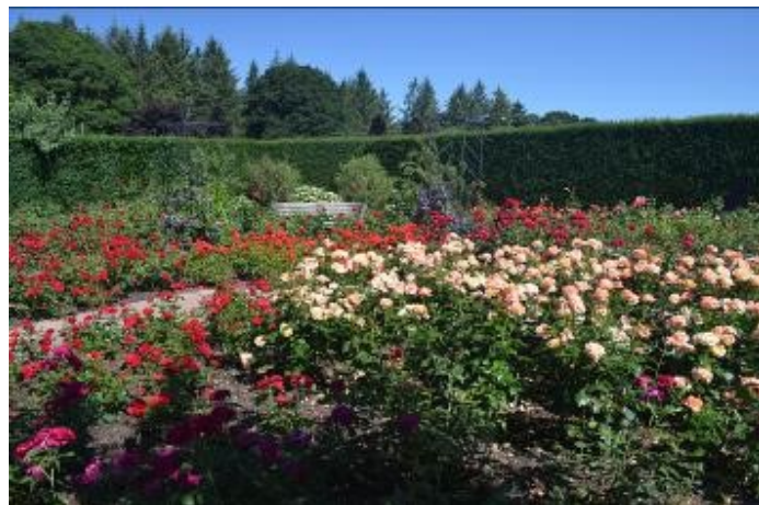
Rose Gardens at Rosemoor above and below

In essence, the area contains a fine jewel-box of cultivars worthy of being furnished in a 21 st Century garden. Floribunda bushes fill the beds with masses of vibrant blooms. The visitors can enjoy 'Amber Queen', 'Betty Prior', 'Betty Harkness', 'Dr Jo', 'Escapade', 'Fellowship', 'Southampton', 'The Times', and 'Trumpeter'. The rose enthusiast with only a small plot, balcony or patio is catered for with exquisite examples of patio roses: 'Pearl Drift', 'Honey Bun' and a particular favourite, 'Queen Mother'. These impressive gems are absolute stars if you wish to grow them in pots. Some commentators are of the opinion that the Hybrid Tea is merely consigned to the memories of the 60's and 70's. However, the planting scheme suggests otherwise. An abundance of healthy plants with fragrant flowers can be admired from such varieties as 'Elina', 'Malcolm Sargent' and 'Simply the Best'. English roses from David Austin, are evenly dispersed in equal measures with superb examples of 'Molineux', 'Olivia Rose Austin' and 'Windrush'. Obelisks placed in strategic places, are covered in clematis that are rich in hues of violet purple or blue, that blend particularly well with pink, cream, white or red coloured roses. A splendid example is the purple clematis, 'Viola', surrounded beautifully with a neat bed of the single pink rose, 'Betty Prior'.