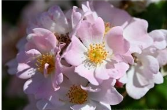
0989 : ROSE D'OR DE NYON à la variété STERNENHIMMEL®, obtenue par l'obtenteur W. KORDES' SÖHNE, Allemagne