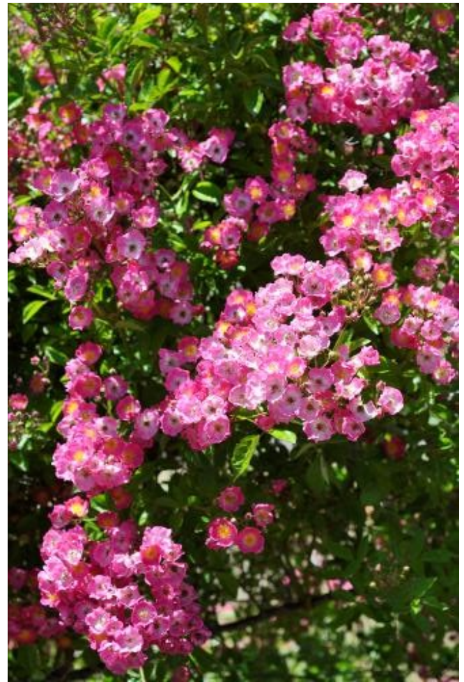
Ramblers - Left: 'Robinette', Right 'Maria Liesa'