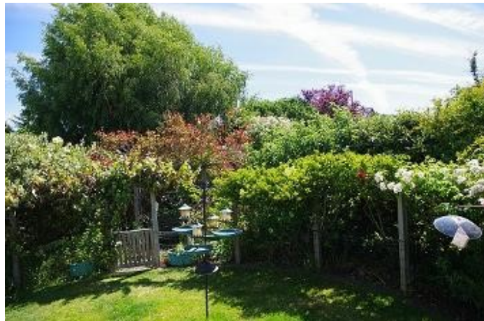
Left: 'F. J. Grootendorst', Right: Back yard view with unknown climber

The property is a slightly larger than average city lot (35m x 15m) and the house has a small footprint. The soil is a sandy loam which we checked on before we bought. Our garden was 95% grass in 1985 when we moved in and it sloped over the boulevard to the road. (The boulevard is owned by the municipality but maintained by the homeowner.) The front garden is now dominated by an evergreen Arbutus menziesii (Madrone in the USA), a native tree. This is a lovely tree but... it drops flowers, leaves, fruit and bark on the driveway throughout the summer and birds eat the fruit. We cannot remember whether we planted it or it was seeded from two doors away. There were some roses, mainly floribundas, which we removed when the access to the front door was redesigned.