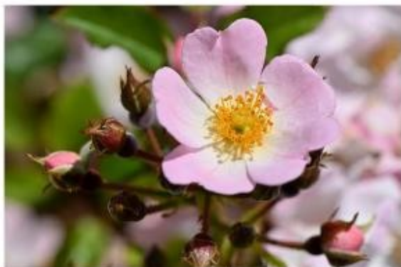
0989 : ROSE D'OR DE NYON à la variété STERNENHIMMEL®, obtenue par l'obteneur W. KORDES' SÖHNE, Allemagne