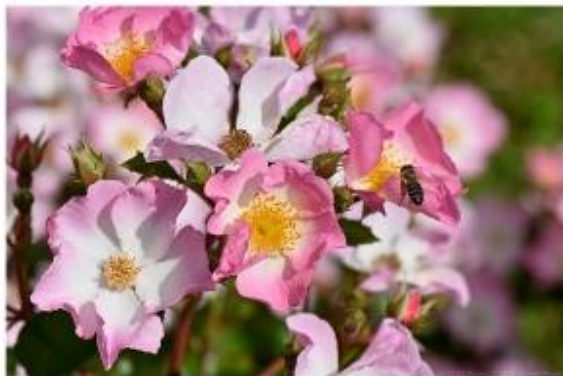
0930 : Catégorie Fleurs groupées : Médaille d'or à la variété UN GRAND SALUT® obtenue par l'obteneur VIVA INTERNATIONAL BVBA, Belgique