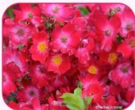
N° 24 Myka de Belle Epoque