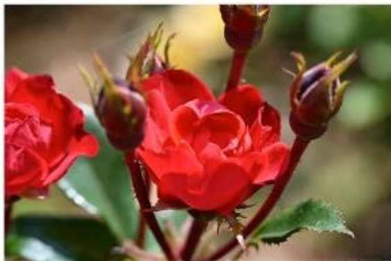
0973 : Catégorie Miniature : Médaille d'or à la variété ZEPETI® obtenue par l'obteneur MEILLAND INTERNATIONAL, France