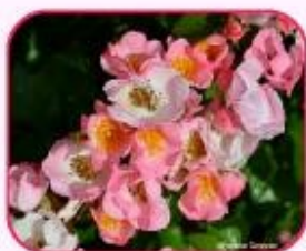
N° 05 Friendly® Sweet de Meilland International