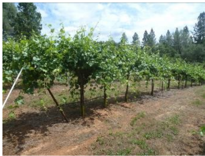
Left: Deer, Right: Barbera and zinfandel wine grapes