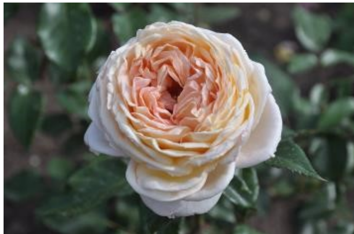
Left: Kortrijk Golden Rose winner 'Nervia', Right: Hradec Kralove Golden Rose 'Grossherzogin Luise'