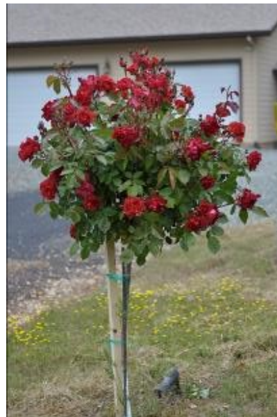
Left: Cottage garden and gazebo, Right: Floribunda 'Cinco de Mayo' rose tree