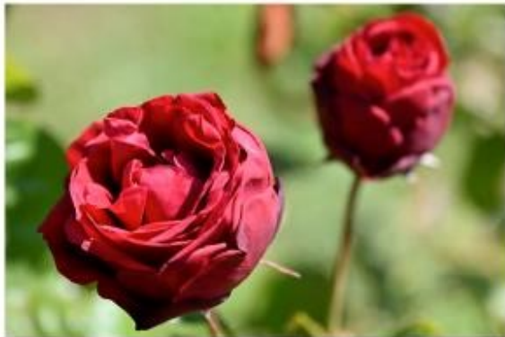
Coupe du parfum : COUPE DU PARFUM FEDOLCA (Hybride de thé) Obtenteur: MATILDE FERRER, Espagne