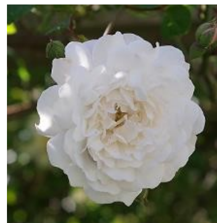
Left: Unknown climber, Middle: Rosa moyesii , Right: 'Felicite et Perpetue'

We each expected to grow fruit trees and vegetables and have specialised in varieties which are easy to grow and not common in the local supermarket. Broad beans and purple sprouting broccoli are favourites and so is fresh garlic. Small fruits were grown commercially in the area in the past so we have raspberries and Cascades but no strawberries because the house was built on a strawberry field and still has remnants of disease in the soil.