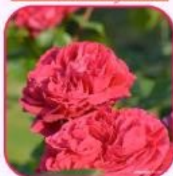
N° 96 DELroreni des Roseraies Georges Delbard