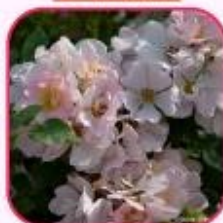
N° 21 Sternenhimmel de Kordes Rosen