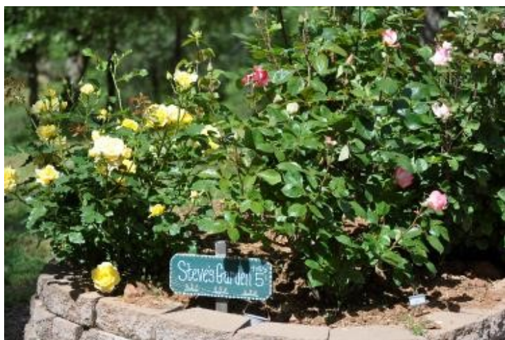
Left: Front deck with David Austin English Roses, Right: Raised rose bed with 'Gold Bunny' on left