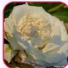
N° 80 WEKlipcrypep De Primavera