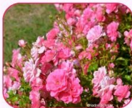
N° 07 Pink Wave de Pépinières de la Saulaie