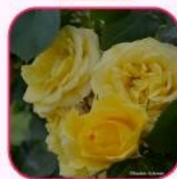
N° 04 : Gold Mountain des Pépinières de la Saulaie