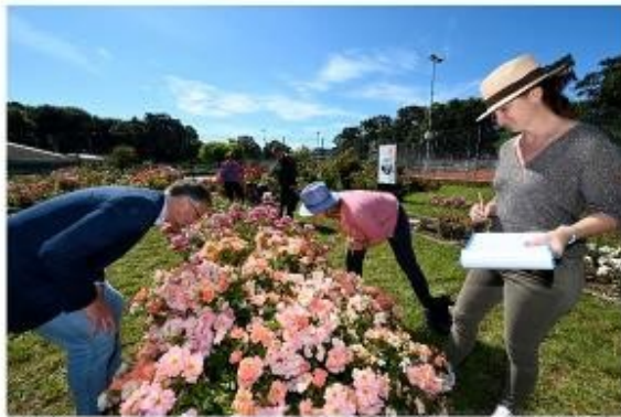
7432 : Jurés au travail