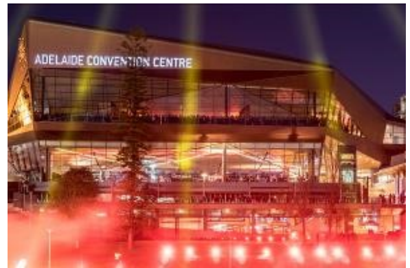
Left: Adelaide Convention Centre (ACC) and Elder Park, Right, Opening of the new West Wing of the ACC