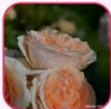
N° 52 ADAfloblanc de Michel ADAM