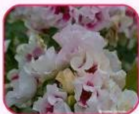
N° 03 See You in Purple de Kordes Rosen