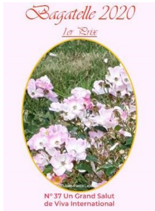
Bagatelle, France Golden Rose 'Un Grand Salut'