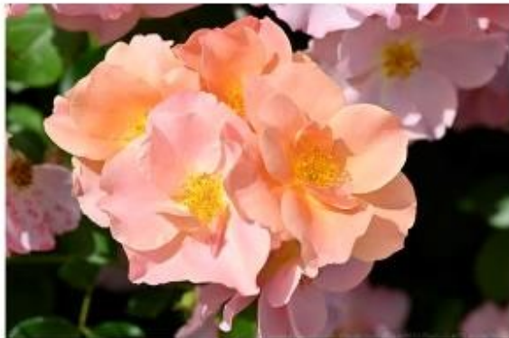
0915 : Catégorie Fleurs groupées : Médaille d'or à la variété CHINOOK SUNRISE® obtenue par l'obteneur VINELAND RESEARCH CENTER, Canada