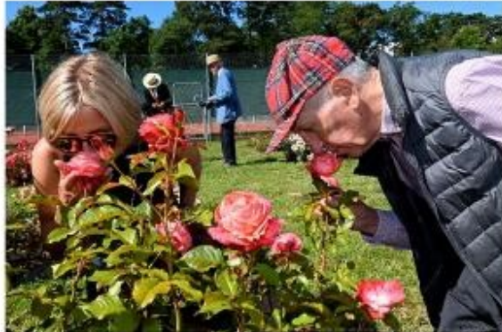
7413 : Jurés au travail