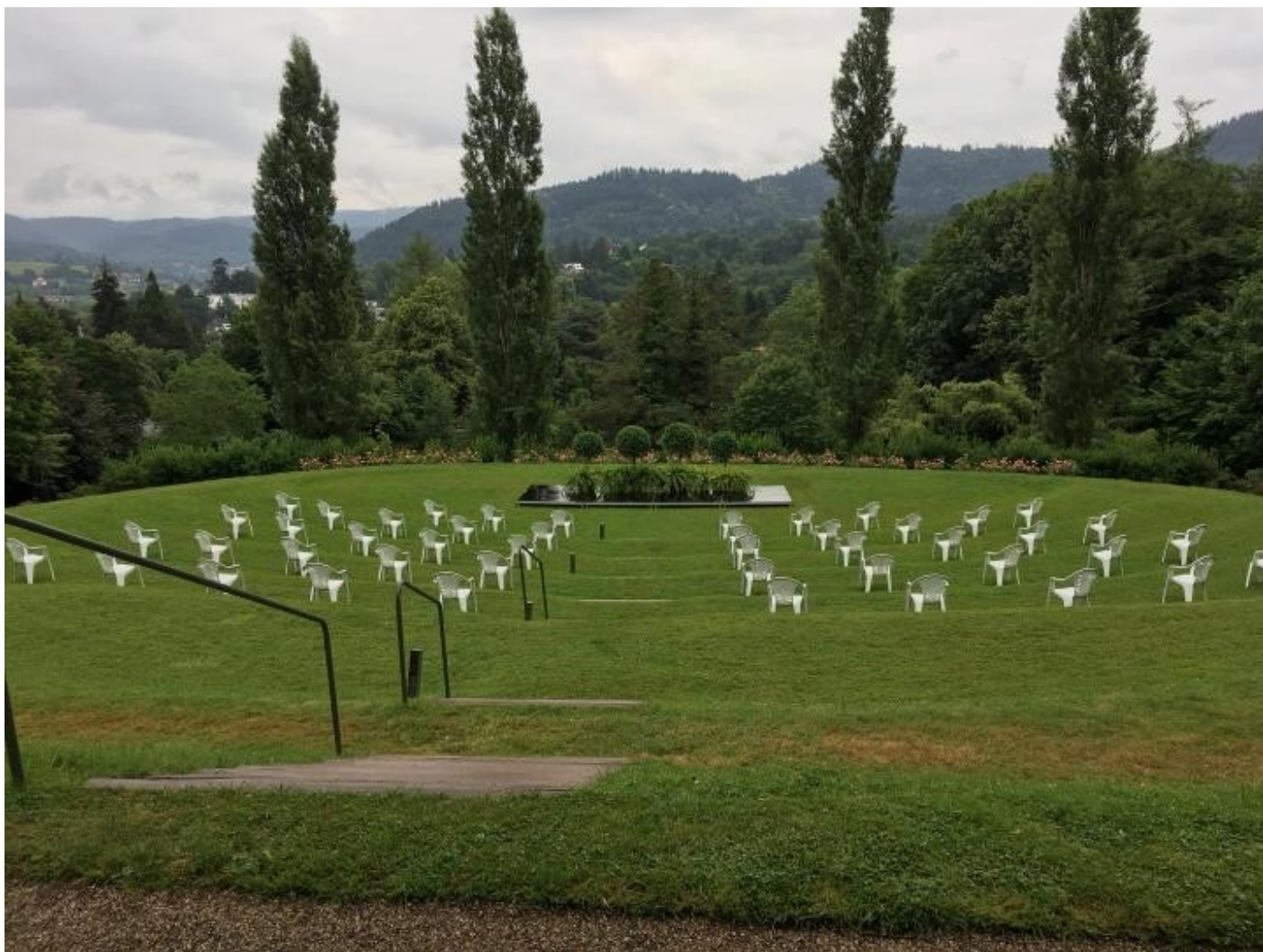
Social Distancing at Baden-Baden Rose Trials - 2020