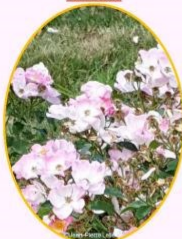
N° 37 Un Grand Salut de Viva International