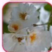
N° 212 Paragon de Belle Epoque