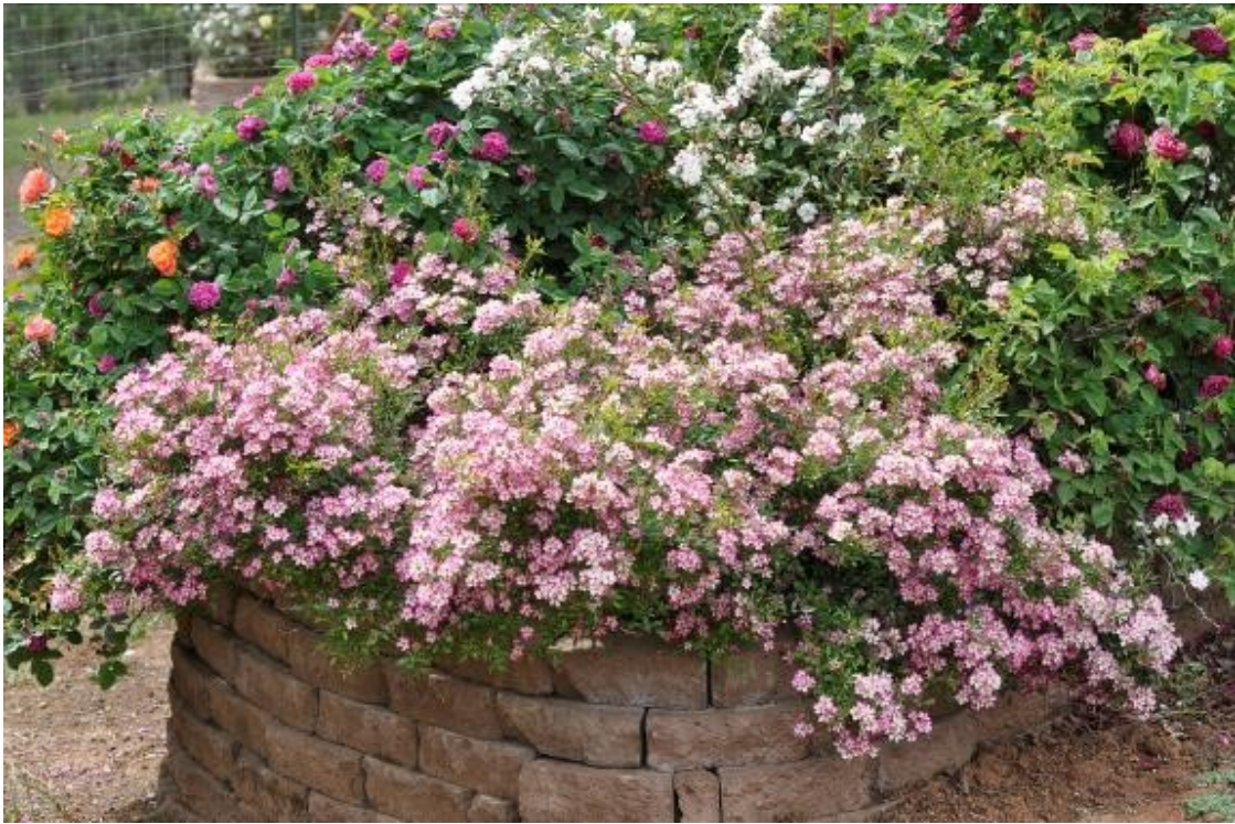
Above: Old garden rose raised bed with miniature 'Baby Ballerina'