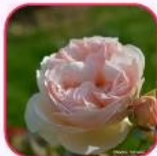
N° 13 Guillot n°1 de SCEA Sirphe