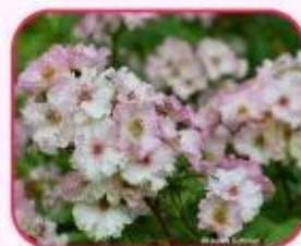
N° 17 August Deusser de Viva International