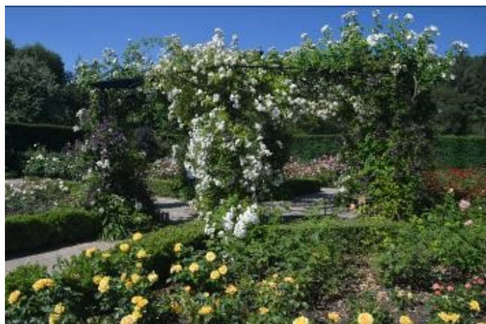
Left: Rosemoor Manor, Right: Arch with ‘Sander’s White Rambler’