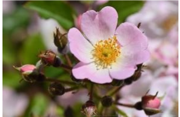
Nyon, Switzerland Golden Rose 'Sternenhimmel'