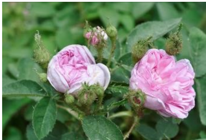
Left: David Austin 'Princess Anne', Right: Moss 'Salet'