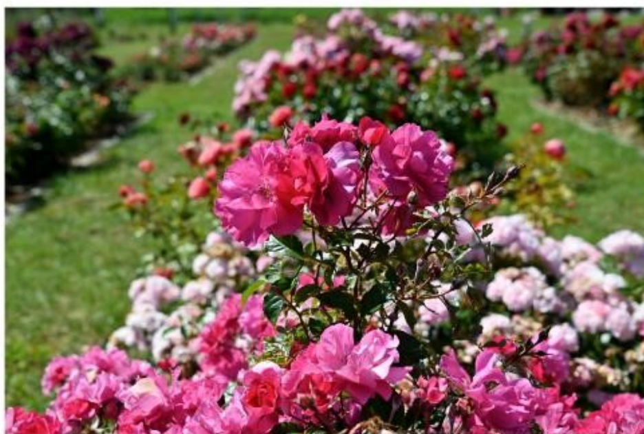
1021 : Détails d'un massif