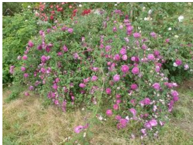
Left: Species Rosa multiflora , Right: Hybrid gallica 'Frederic II de Prusse'