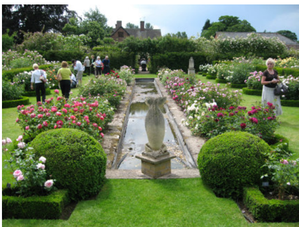
The Renaissance garden at the Austin Nursery

Our fourth GROW™ Rose Garden Hall of Fame honoree is the David Austin Rose Garden located on the site of David Austin Rose Nursery, Albrighton, Wolverhampton, UK. The garden evolved from an idea of Mr. Austin's to plant many of the roses he was using in his breeding program and grew as time and funds became available. The first section planted is now the Long Garden which displays a large collection of climbing roses on the pergola while box wood lined beds are filled with roses and companion plantings. The Renaissance Garden is undoubtedly one of the splendors of the rose world when in full bloom. A large part of the English Rose collection is planted along emerald green serpentine grass paths lined with low trimmed box wood. Each variety is planted out with three to five of each cultivar giving an unbelievable display at peak bloom. Best visited in early summer (as are all British rose gardens) the display and fragrance is intoxicating.