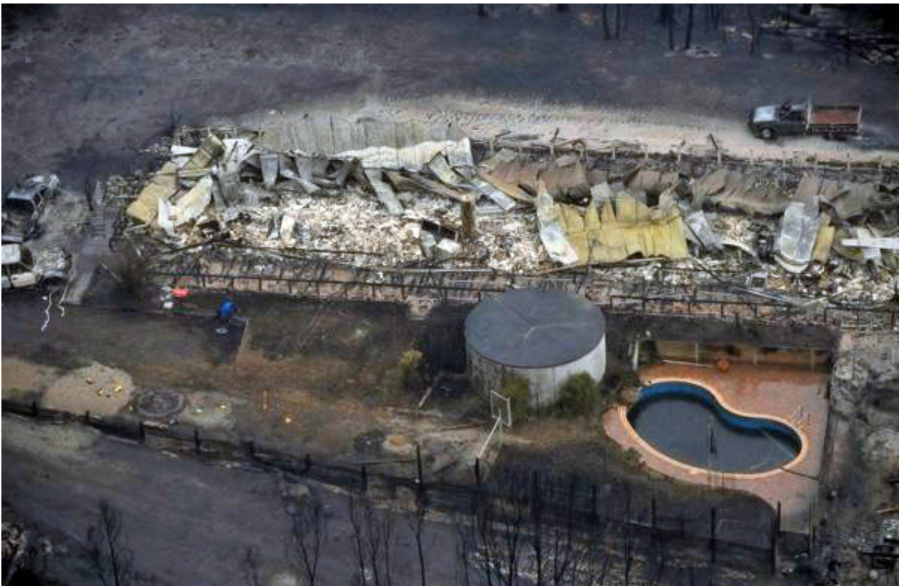
... and after