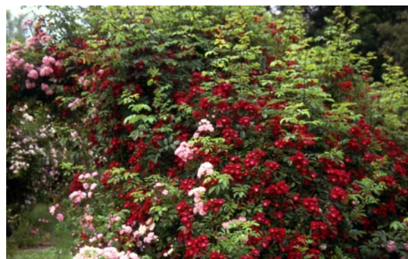
Chaumont-Gistoux roses rampant

Despite all this high-level scientific work, the garden is no dreary laboratory but a living treasury of beauty and delight. Just as one of the highest accolades a restaurant guide can give a hostelry is to say that it is "worth a detour", so one can confidently say to anyone visiting Belgium in the rose season that Chaumont-Gistoux is "worth a detour".