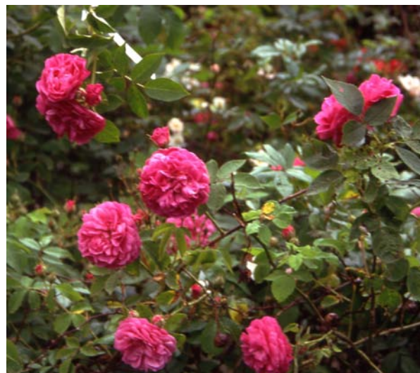
Rosa gallica officinalis x Etoile de Hollande

have been made using the Rosa chinensis cultivar 'Mutabilis' as one of the parents.