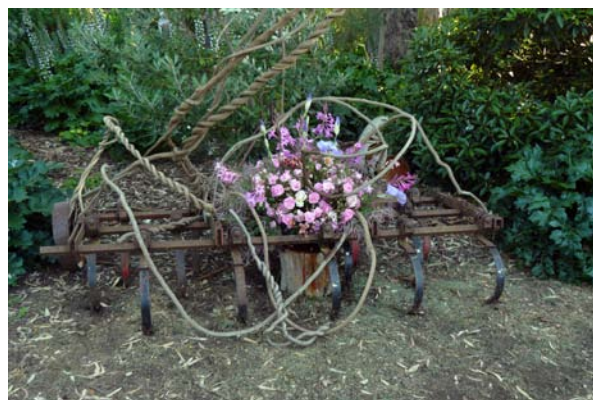
flowers arranged on a plough – this arrangement was done before the garden was opened to the public