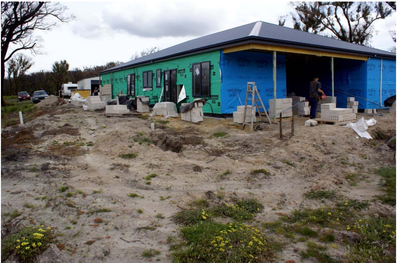
October 2009, rebuilding

Jill Collins (03) 97754549 0438 255 811 normancollins@bigpond.com