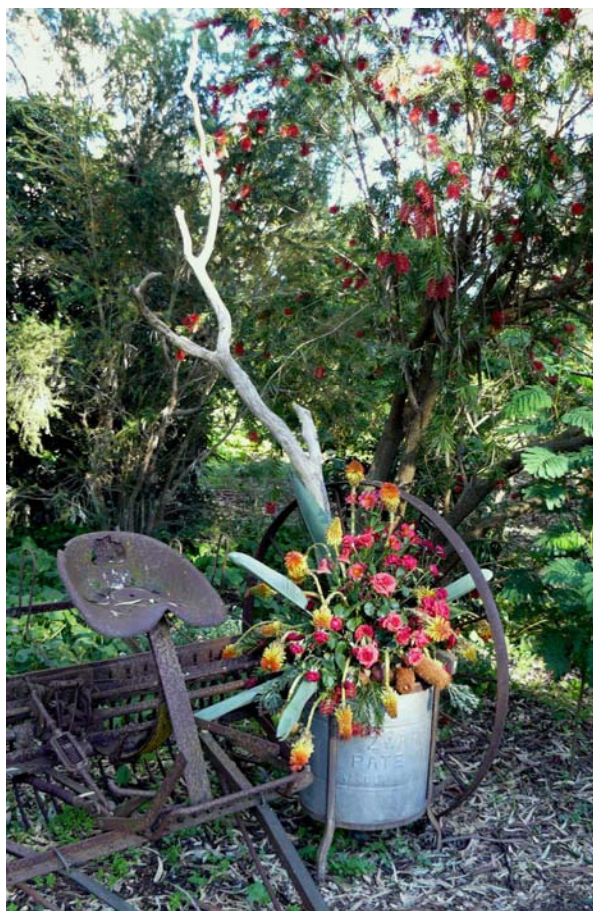
an arrangement in an old washing machine placed next to an old farm buck rake