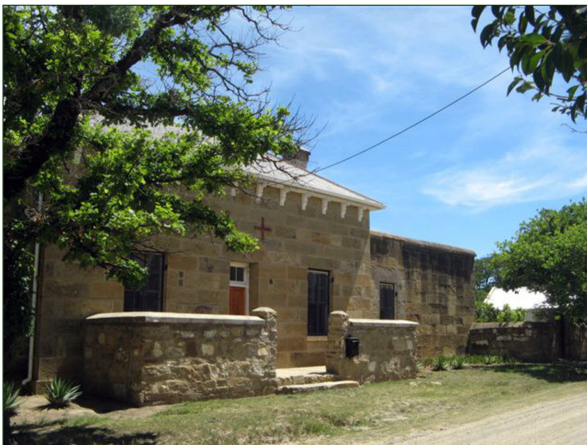
The refurbished Old Stone Jail, venue for the Rose Repository opening ceremony