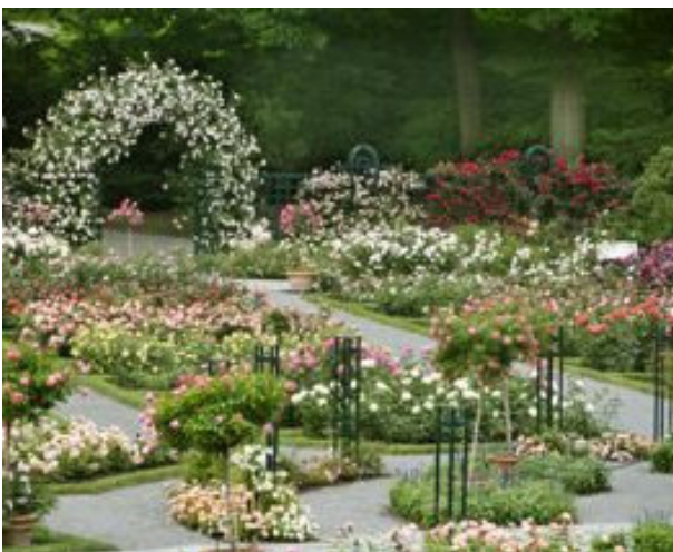
the North Gate, the Peggy Rockefeller Rose Garden – photo by Peter Kukielski

Our second 2010 honoree is Mottisfont Abbey Rose Garden a property of The National Trust located in Hampshire near Southampton. Mottisfont Abbey was a former priory with historic ties back to Saxon days. After becoming a National Trust property the former walled kitchen gardens were turned over to Graham Stuart Thomas who planted these walled gardens with his personal collection of historic shrub roses starting in 1972. The current rose garden contains over 300 cultivars of old-fashioned roses planted in beds lined by clipped boxwood hedges filled with roses and companion plants. Arches span walkways and the former kitchen garden's brick walls are covered with climbing roses and clematis. Mottisfont Abbey Rose Garden is being recognized for the depth of its collection of Old-Fashioned roses, the excellence of horticultural practices, and the importance of maintaining this invaluable collection for future generations of rose lovers.