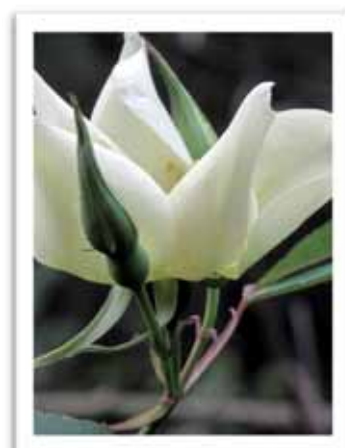
Seedling of gigantea