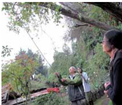
Most R. giganteas are not adapted to small gardens.