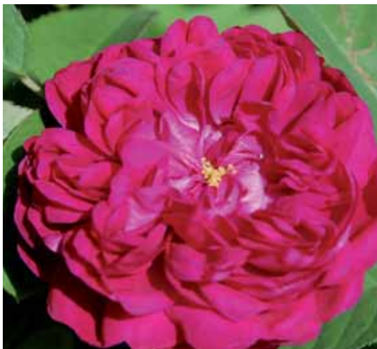
'Rose de Rescht'