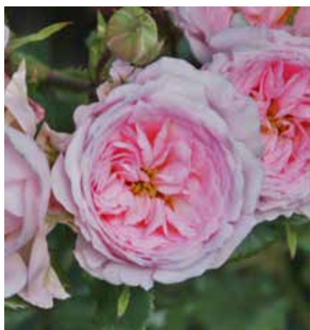
Rosa "August Jäger"