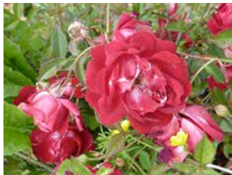
La Roseraie du Désert