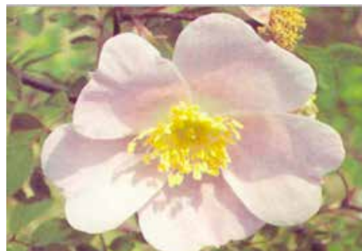
R. webbiana – lilac form