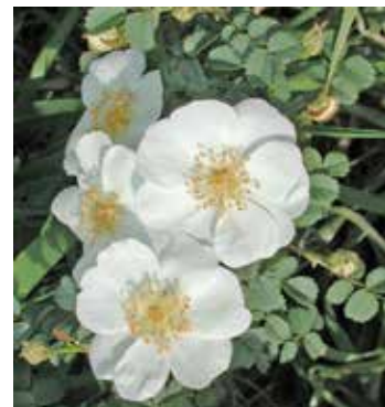
Wild single white R. spinosissima

"Single White", "Double White", "Single Yellow", "Single marbled or striped" ('Ciphiana'), and "Single Red" (see 'Hortensius', 1784). Several of these were illustrated in A Collection of Roses from Nature by Mary Lawrance in 1799. The half a dozen or so Scots Roses available by 1799 was soon to increase to hundreds of cultivars!