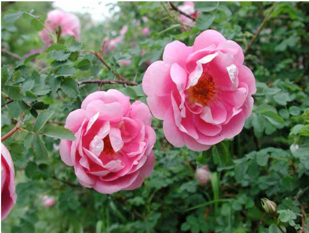
A good double pink Scots Rose from an old garden in Scotland, possibly one of Robert Brown's 'lost' cultivars!

beauty in flower and their heritage significance. Some of these roses may have originally come from the Perth Nursery.