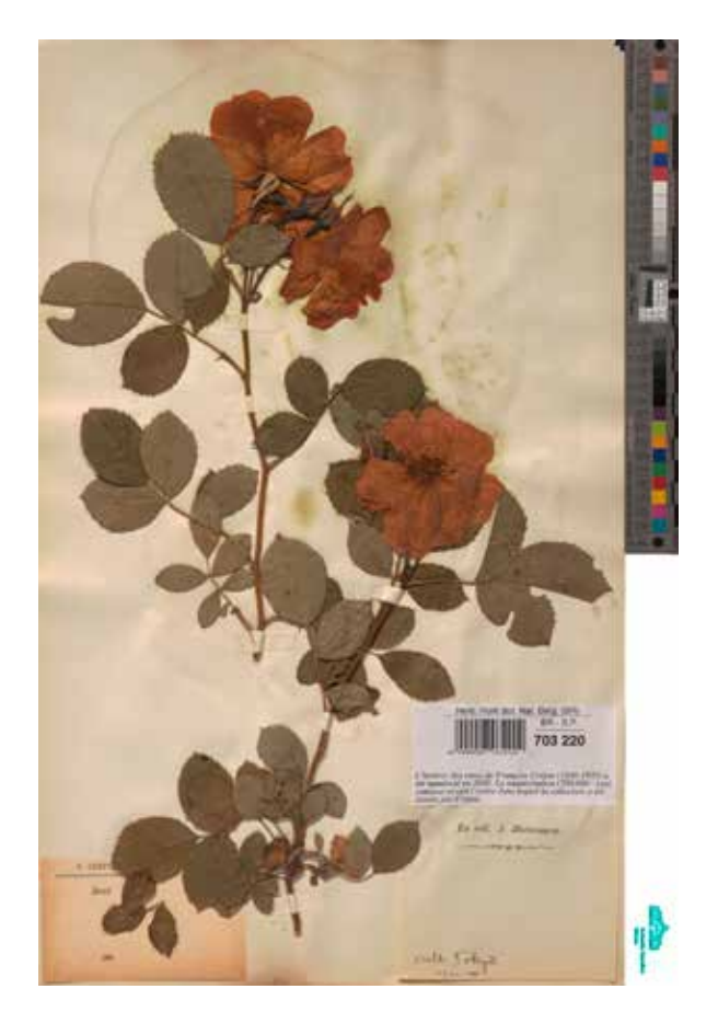
A specimen of Rosa indica from the Crépin Herbarium, collected by J. Matsumura (MGB coll.)

The Garden's botanical heritage on roses is of exceptional value but too little known because its visibility and accessibility are restricted. This has several reasons. First, the specimens of the Crépin Herbarium are very fragile and have to be handled with extreme care. Additionally, health regulations impede access to this collection, as it contains traces of mercury which in the early 20th century was commonly used to protect herbarium specimens against attacks by insects. Meise Botanic Garden has recently initiated two projects to make these heritage collections more visible and more accessible. The first project, with support of the World Federation of Rose Societies, the Royal and National Rose Society "De Vrienden van de Roos" (Belgium) and the Piaget Foundation, is a pilot project which digitized circa 25% of the rose collection and tested the usefulness of the collection for genetic studies. A second project is the creation of a new rose garden in order to showcase the rich collection of wild roses to the public.