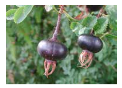
Fig. 2. Black heps

R. spinosissima is a very variable species regarding habit, armature, size of flower, size of leaves and height. It may only grow a few centimetres tall in windy sand-dune habitats, spreading by underground stems (root-shoots) so that a single clone may cover several square metres. In more sheltered parts of a dune system, R. spinosissima may grow larger, up to about one metre tall, forming a thicket. In inland sheltered habitats, even taller-growing 'Grandiflora'