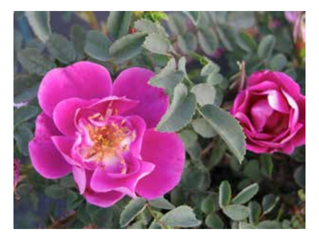
Rosa 'Peter Boyd'

Other times when I have crossed a once flowering with a recurrent one, some of the seedlings could pop up as recurrent. I think there must different types of recurrence genes in this group of roses. In the first example the two recurrent roses could have different types while in the second example the nonrecurrent rose could have hidden possibilities for recurrence.