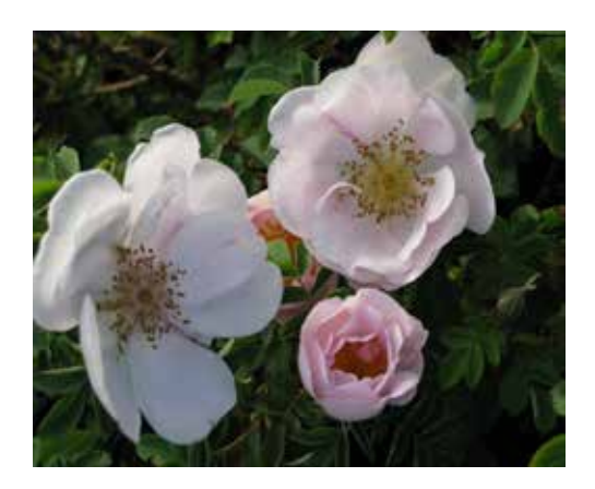
'Christiane' a sport of 'Stanwell Perpetual'.

I have been working with this group for several years and have come up with many hand-pollinated hybrids. Most of them had only a hidden potential to flower more than once each year but more recent crosses have proved to be truly recurrent.