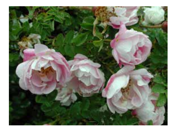
Semi-double marbled Scots Rose found by roadside near Peebles, Scotland.

produce abundant black heps and many have attractive foliage that can produce striking autumn colours in yellow, orange, pink, red and scarlet in different cultivars. Their prickly stems are attractive in the winter, particularly with the frost on them. Therefore, although they normally have one main period of flowering, they have interest for much of the year. R. spinosissima cultivars will grow in a wide range of soils. They are also extremely cold-hardy and resistant to drought and diseases. Some of the cultivars already in commerce, old cultivars not presently in commerce and new hybrids offer great potential as garden plants.