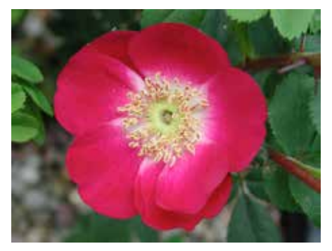
Fig. 7 Single crimson flowers of 'Mrs Colville', a Scots Rose of the Reversa Group.

The nomenclature of Scots Roses and other cultivars of R. spinosissima is confused but attempts have been made to gain some semblance of order by clarifying names and separating cultivars into groups of cultivars with similar character or presumed same parentage (Boyd, 2004, 2007, 2008a, 2015). Some groups are quite well-defined, such as the Reversa Group (cultivars that have characteristics of R. spinosissima and R. pendulina ) and a Harisonii Group (cultivars that have characteristics of R. spinosissima and R. foetida ). Some are less well-defined groups such as 'Complex Hybrids' with a wide range of forms that show little of their R. spinosissima heritage but are often described as 'Spinosissima Hybrids'.