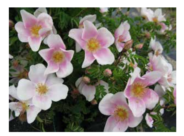
Rosa 'Blushing Love'

Other times when I have crossed a once flowering with a recurrent one, some of the seedlings could pop up as recurrent. I think there must different types of recurrence genes in this group of roses. In the first example the two recurrent roses could have different types while in the second example the nonrecurrent rose could have hidden possibilities for recurrence.