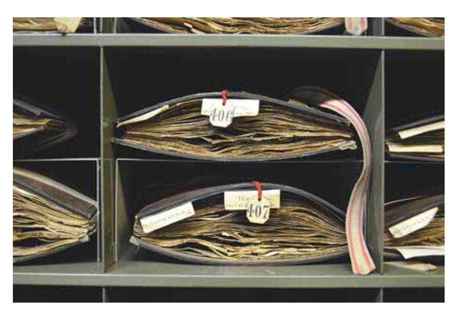
Crépin's Herbarium of roses at Meise Botanic Garden

Crépin assembled an herbarium that comprises about 43,000 herbarium sheets of wild roses. In contrast to other important herbaria, this collection covers the whole natural area of distribution of Rosa and documents an unparalleled range of taxa. These specimens, often received from other famous rhodologists, are enriched with identification labels, annotations, comments and analytic drawings by Crépin. Meise Botanic Garden also preserves information about Rosa collections from other herbaria that were revised by Crépin.