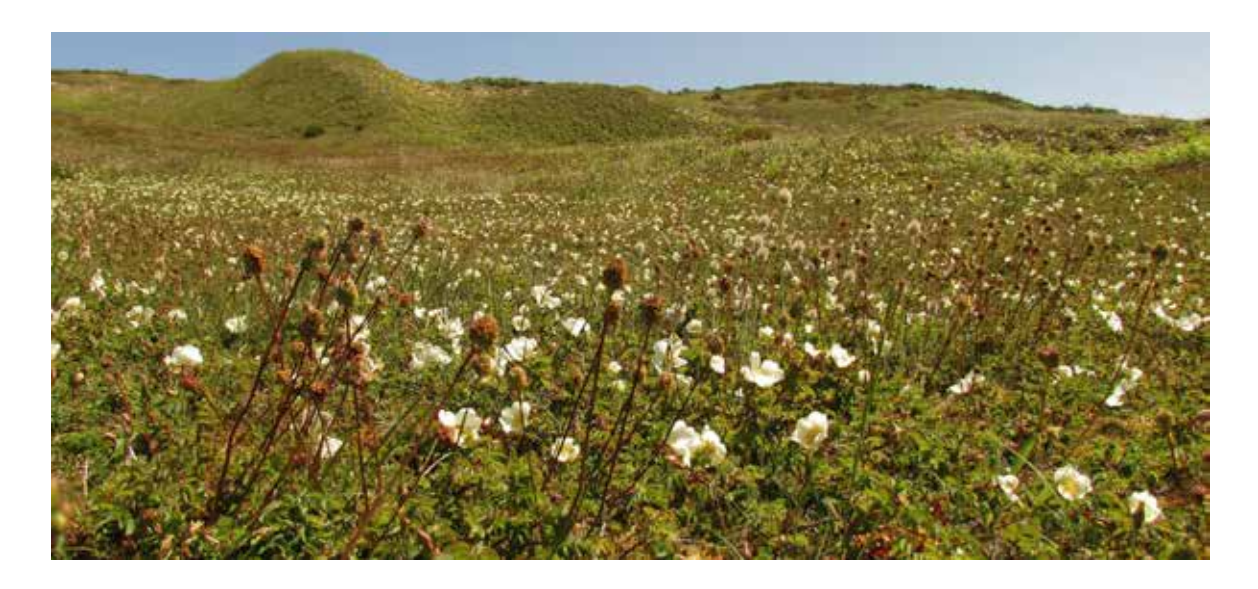
Fig. 1. A perfumed carpet of wild Rosa spinosissima on stabilised sand-dunes in Normandy, France

'Scots Roses' are natural variants, hybrids and other cultivars of Rosa spinosissima (also known as R. pimpinellifolia ) with a similar habit and character to R. spinosissima as it occurs wild in Scotland and other parts of northwest Europe. Most "true" Scots Roses were bred before 1840. Many of the more recent 20th century R. spinosissima hybrids utilized taller, larger-flowered Asian variants of the species (e.g. 'Altaica').