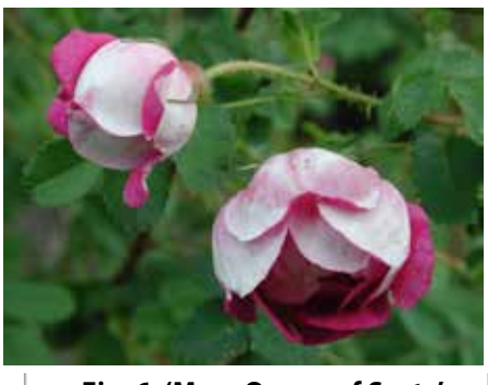
Fig. 6. 'Mary Queen of Scots' - a true Scots Rose

One particular rose provides a good example of the confusion that exists in the naming of Scots Roses and related cultivars. Thomas described one very distinctive rose, 'Mary Queen of Scots', in his 1962 book (see Fig. 6). That rose has typical Scots Rose character as regards form, foliage and black heps. The flowers are semi-double with the partially opened buds (the back of the petals) appearing white but opening to expose deep carmine on the front of the petals. The combination of grey-white buds and carmine creates a very striking effect.