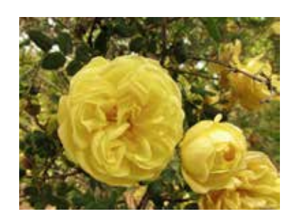
Fig.5.'Harison's Yellow', a Scots Rose of the Harisonii Group