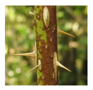
Fig. 4. 'Altaica' m. type

R. spinosissima has the widest natural geographical distribution of any rose species in temperate regions, extending from the coastal fringes of Western Europe to north-west China and adjacent areas and it even occurs in part of the Atlas Mountains of North Africa. Its distribution overlaps with that of the circumpolar Arctic Rose Rosa acicularis in parts of its range. R. spinosissima has also become "gently" naturalised in North America and its cultivars are widely planted in both the Northern and Southern Hemispheres. The wild species occurs in mountain habitats to well over 2000 metres, down to sea-level, including calcareous grasslands and coastal sand-dunes.