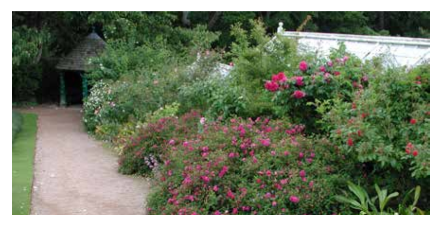
Mounds of Scots Rose 'William III' at Crathes Castle, Aberdeenshire, Scotland