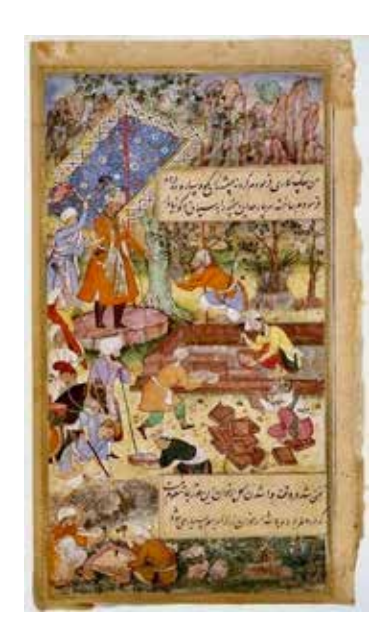
Babur inspecting the making of a garden.

While the Sintra Prashasti tablet, dated to 1287 CE, is the earliest written evidence that roses may have reached India from other lands, in ancient India where history was never documented but was invariably only passed on by oral tradition, it is difficult to be precise. From earlier times there are references to roses for the treatment of various illnesses and ailments in the ancient treatises on Ayurveda , the Indian system of medicine, by medical practitioners like the surgeon Susruta (c. 6<sup>th</sup> century CE) and the physician Charaka (c. 4<sup>th</sup> century CE). The "Arkaprakash" text mentions the discovery of rose water by the Buddhist monk Nagarjuna. These roses could be both the indigenous species in the Himalayas and those which may have come in from other lands, since there was trade between India and adjacent countries from earliest time and pilgrims traveling from region to region.