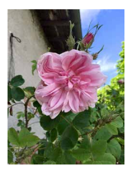
R. x damascena 'bifera'