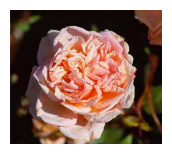
'Souvenir d'Elisa Vardon' Marest 1854

In the year 1854 the first telegraph line opened in Australia; Britain and France declared war on Russia, thus beginning the Crimean War; and the Kansas-Nebraska Act left the issue of slavery up to popular vote in that territory, creating violence among its populace, apprehension among international cotton traders who foresaw the handwriting on the wall, and outrage in the North, which then became strongly antislavery. The Crimean War demonstrated just how linked and global the world was becoming. Ten thousand Colt revolvers were sent to the war front; about forty doctors from the States worked as medics in the Tsar's army, and 500 Americans served with the Russians.