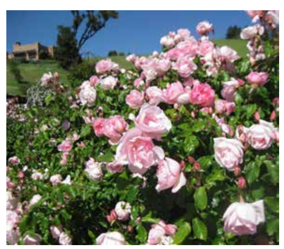
'Duchesse de Brabant' Bernéde 1857

One remaining rose of that year is 'Comtesse de Labarthe', a Tea with a second name: 'Duchesse de Brabant'. This rose is a survivor. It has been discovered growing through drought and neglect in pioneer cemeteries, abandoned homesteads, and Gold Rush towns in California time and again. It should be no surprise that it has earned the Earth Kind certification for roses of stalwart endurance and health. Its cupped blooms look shrimp pink, silvery pink, or soft rosy pink, with concave petals, quite fragrant. The bush grows to five or six feet high and about as wide, densely branching and twiggy in habit.