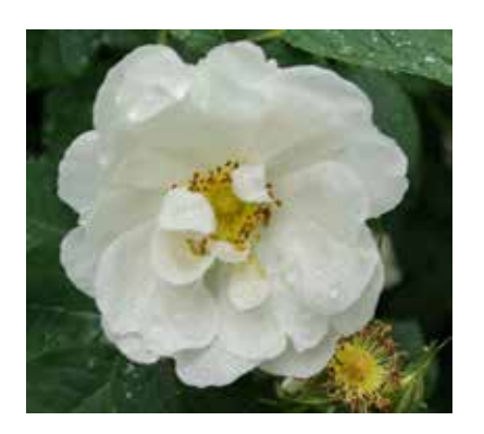
Rosa alba ~ 'Sappho' http://roses.shoutwiki.com/wiki

If Zeus chose us a King of the flowers in his mirth, He would call to the rose, and would royally crown it; For the rose, ho, the rose! is the grace of the earth, Is the light of the plants that are growing upon it! For the rose, ho, the rose! is the eye of the flowers, Is the blush of the meadows that feel themselves fair, Is the lightning of beauty that strikes through the bowers On pale lovers that sit in the glow unaware. Ho, the rose breathes of love! ho, the rose lifts the cup To the red lips of Cypris invoked for a guest! Ho, the rose having curled its sweet leaves for the world Takes delight in the motion its petals keep up, As they laugh to the wind as it laughs from the west.