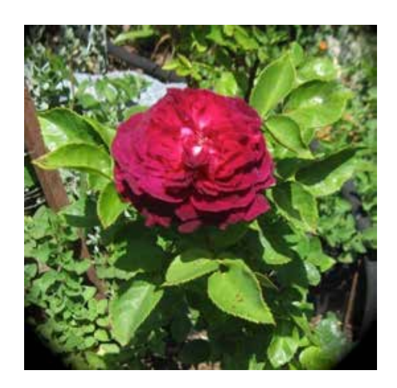
'Arthur de Sansal' Cochet. P. 1855

Four roses of 1855 remain on the market, all Hybrid Perpetuals, the popular rose class of the time. One of these is 'Arthur de Sansal'.