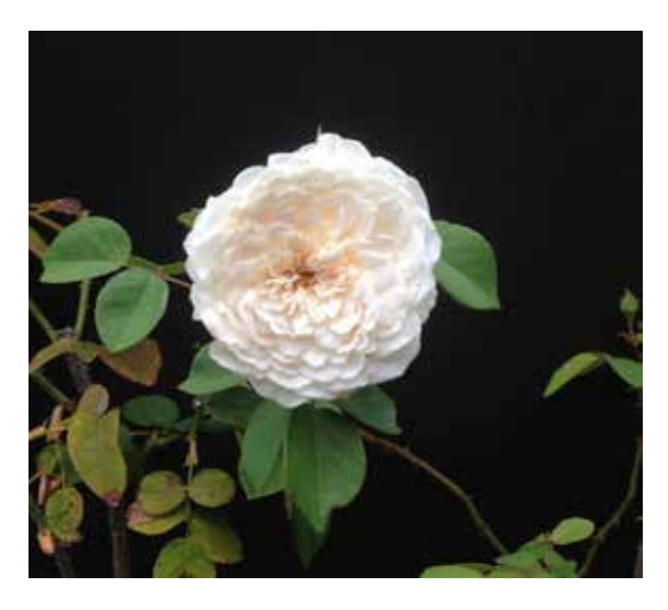
'(Mlle de) Sombreuil' Robert 1851

Of the half-dozen surviving roses of that year, the Tea 'Mlle de Sombreuil' will claim our attention. This rose can be described as white, tinged with pale pink or light blush, blooming in small clusters on strong stems, and floriferous. Supposedly it was a bush form of the rose, but by 1898 Lord Broughan and Vaux, who grew it on the Riviera, wrote that it was "very effective growing up a tree." Was this the same rose, or was it a sport of the original—or another similar rose entirely?