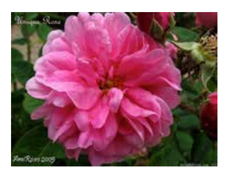
'Unique Rose' Cels prior 1810 © Etienne Bouret

Some rose writers have expanded on the second part of Peter Beales' citation above and declared that our "modern" Centifolia, the Cabbage Rose, could not be the same rose as that described by Theophrastus and Pliny because of its apparently complex parentage. Again, citing Byrne: "The only definitive way to know if the modern centifolia is the same as (or different than) that of Pliny would be to compare them directly". In other words, a "complex hybrid" (if indeed that is what it is) such as the Cabbage Rose could have originated 2 millennia ago as readily as 400 years ago.