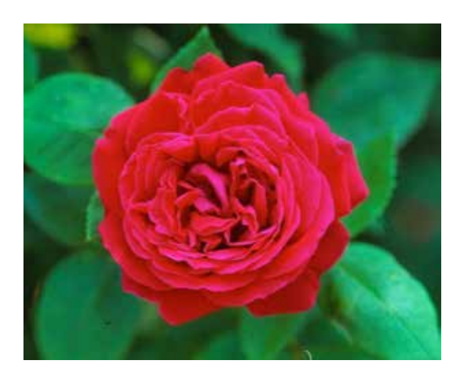
'Empereur du Maroc' Guinoisseau 1858 ~ © Bill Grant

At least seven roses from that heady year have survived. Three of those are Hybrid Perpetuals, three are Tea roses and one is a Noisette—'Céline Forestier'— the most popular being the Hybrid Perpetual 'Empereur du Maroc'. It is still sold globally by nineteen rose nurseries, only one of which is in the USA. A stunning rose, it is one of the darkest crimson-maroon roses, verging on black, ever raised (until 'Nigrette' of 1934), aging to purple. The foliage, however, leaves something to be desired, for it is sparse and given to black spot. But it remains popular for the beauty of its incredible color, form, and scent.