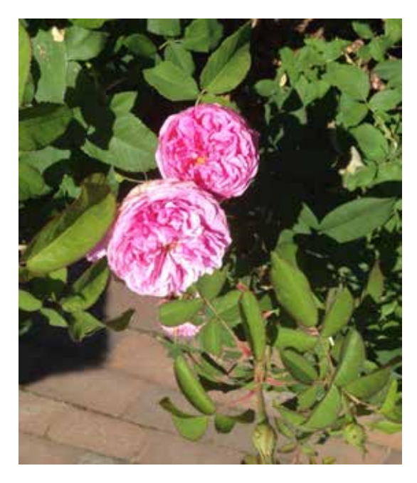
'Mme Boll' Boll 1859 ~

The end of that decade saw the release of four roses that have survived into our times: 'Comte de Chambord', 'Mme de Tartas', 'Victor Verdier', and 'Mme Boll'. Because it is the one least discussed in the literature, I will focus on 'Mme Boll'. Like so many heritage roses, it is far more popular abroad than in the U.S.