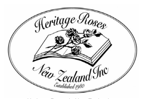
Heritage Roses in New Zealand. a brief history, pp. 13-14