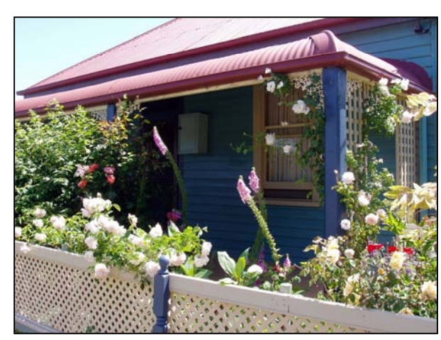
Poppylands: the delightful cottage belongs to Wendy Langton who lives at Latrobe

In another area an old Hills hoist has been put to good use with Veilchenblau , Violette , Amethyste and Rose Marie Viaud – all shades of purple – growing over each corner. This charming picture was made complete with a wonderful collection of old Mosses and Portlands growing at their feet amid a profusion of dianthus, aquilegias, species geraniums and lupins.