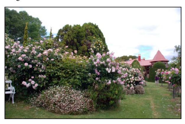
The Scented Garden at Glazier's Bay

An immaculately trimmed huge cypress hedge of National Trust significance edged the western side of the garden.