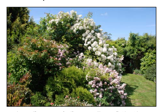
A magnificent array of self-sown seedlings at Petticoat Lane

Huge trellised walkways divided one garden room from the next until the area opened out onto an orchard with a casual pond and attractive fountain.