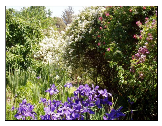
Vivid blue iris backed by Wedding Day , American Pillar , and Veilchenblau all cascading from a wooden trellis at Rosedown .

New Norfolk, further up the Derwent River, was our next stop where we visited Rosedown, home of Brenda and Ian Triffitt. This garden was a series of rooms many of them divided by arches, pergolas, and other structures, most of them housing rambling roses. Fritz Nobis, with beautiful soft pink fully double blooms, was backed by Francis E. Lester, another soft pink but with clusters of small single flowers, making a lovely combination. Perle d'Or was growing in combination with Nevada and a seedling of Rosa brunonii which was threatening to grow up into a nearby London Plane. A semicircular metal archway was massed with huge specimens of New Dawn, Crepuscule, and Talisman. A large spreading Madame Hardy was thriving despite growing at the base of a scarlet oak while a massed bed of vivid blue iris looked magnificent growing with Veilchenblau and Silver Moon. Near the back of the garden we came across a delightful formal rose garden with a central pathway leading to a birdbath and divided by box hedging. Within this was a wonderful mix of old and modern roses with one of my favourite species, Rosa swegenzowii, featured several times.