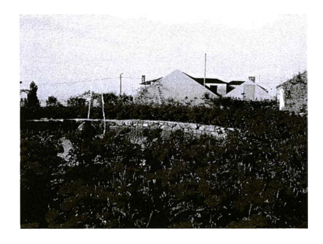
Miguel Albuquerque is Mayor of Funchal, the capital of Madeira.

The visitor should pay special attention to our collection of China Roses (57 varieties), Bourbon Roses, and Portland Roses. Both the old and more recent kinds of rosebushes are filled with beauty and vigour waiting for your visit.