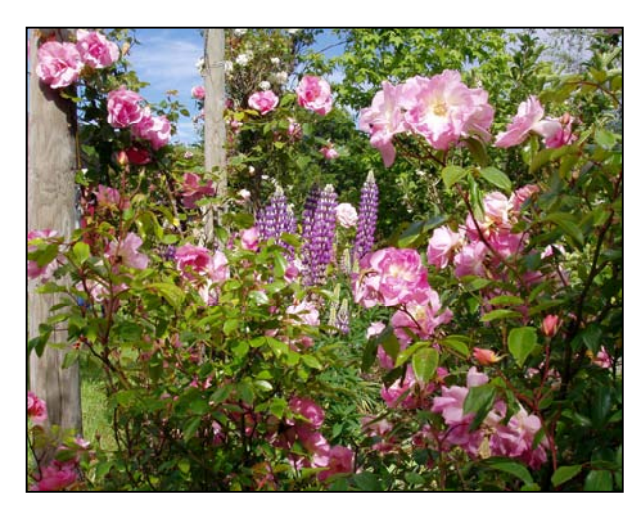
Light Touch , a Tasmanian-bred rose combines with Alister Clark's Cicely Lascelles and lupins to create a charming picture in Ros and Steve Murdock's garden at Sandfly.

We began our touring from Hobart. Sandfly is a few kilometres to the south and it was here that we visited the home of Ros and Steve Murdock. This is a twenty year old garden cut out of undulating farming country fast being overtaken by five acre allotments. It was a casual, flowing garden with large grassed areas interspersed with garden beds of roses, salvias, lupins and other easy care plants. The salvia 'Hot lips' was a favourite along with a Tasmanian-bred rose Light Touch. In fact, Australian-bred roses are used extensively throughout the garden, Alister Clark's Sunlit, a lovely apricot, Editor Stewart, a clear crimson, and Gwen Nash, a simple semi-double salmon pink, especially taking my eye.