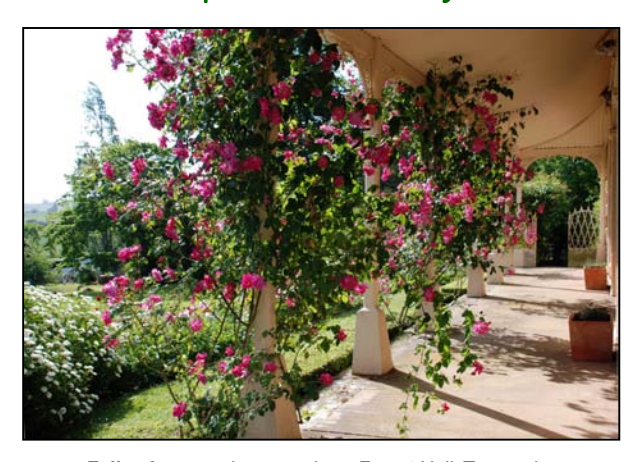
Fellemberg on the veranda at Forest Hall , Tasmania. More roses in Tasmania feature in Sue Zwar's article, pp. 5-10