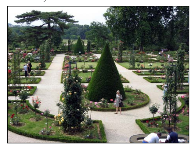
Bagatelle: a beautiful garden, but not reported on here

To adequately describe the three days of the 11<sup>th</sup> International Heritage Roses Conference within a 1,500 word article is challenge I'll only manage by committing the crime of not mentioning the fabulous grand rose gardens of Paris – Bagatelle and Roseraie de l'Hay . These gardens were everything I'd seen in books and then some, even though an unseasonably beautiful April followed by an equally unseasonable terrible May had resulted in a somewhat rose-less June.